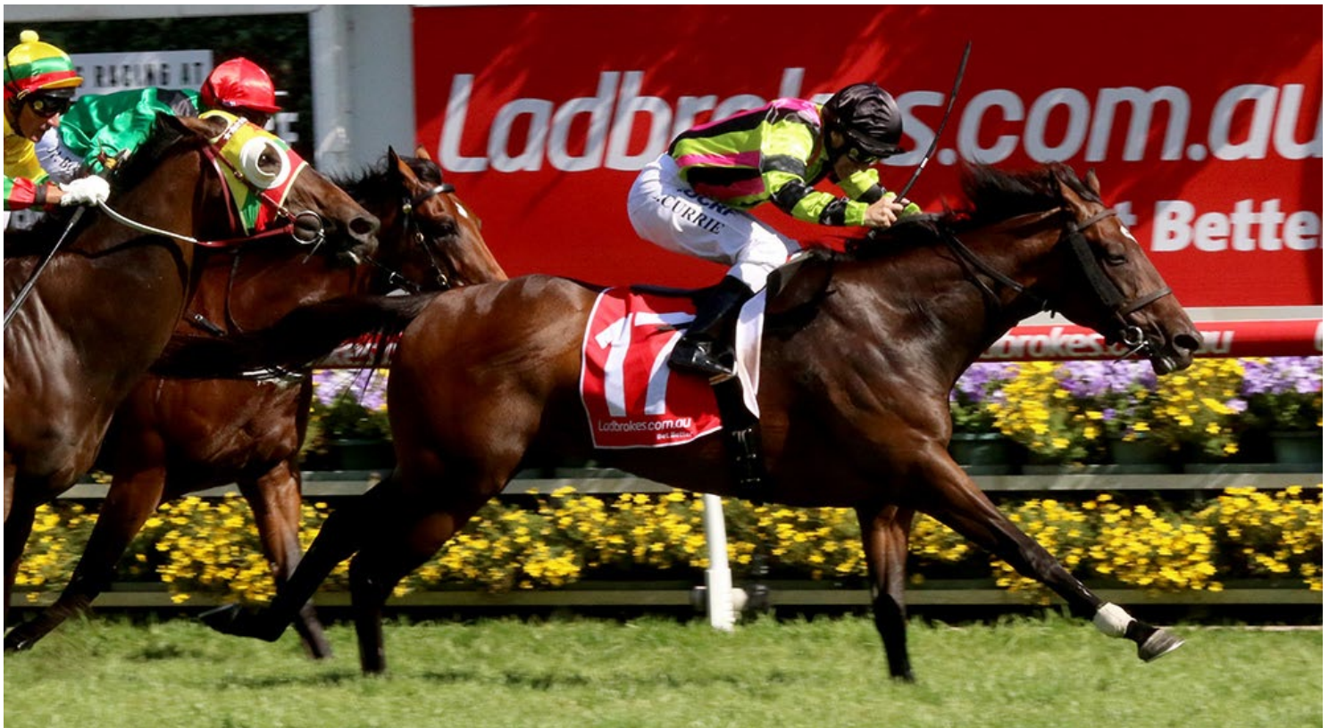
Multiple stakes winner Suavito is back in work and will be aimed at early spring features