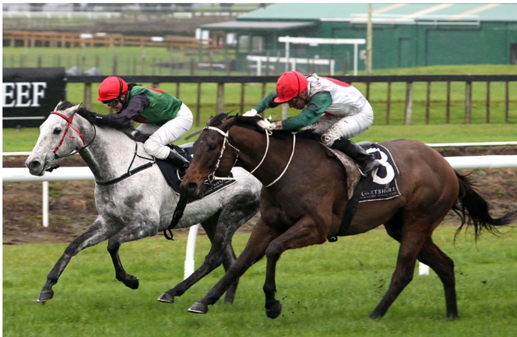
El Duque (outer) gets in the deciding stride to defeat a game Rich Billie Marsh

"He is a very tough customer who thrives on the winter tracks. He's only had seven starts and won three of them so we think he can pick up some more while the tracks stay wet.