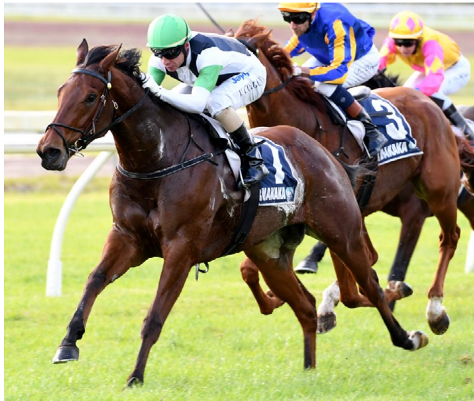
Exciting prospect Koenigsegg One dashes home to score handsomely on the weekend