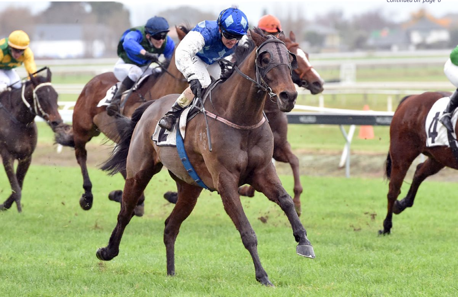
Pump Up The Volume and Lisa Allpress combine superbly for a comprehensive victory at Awapuni