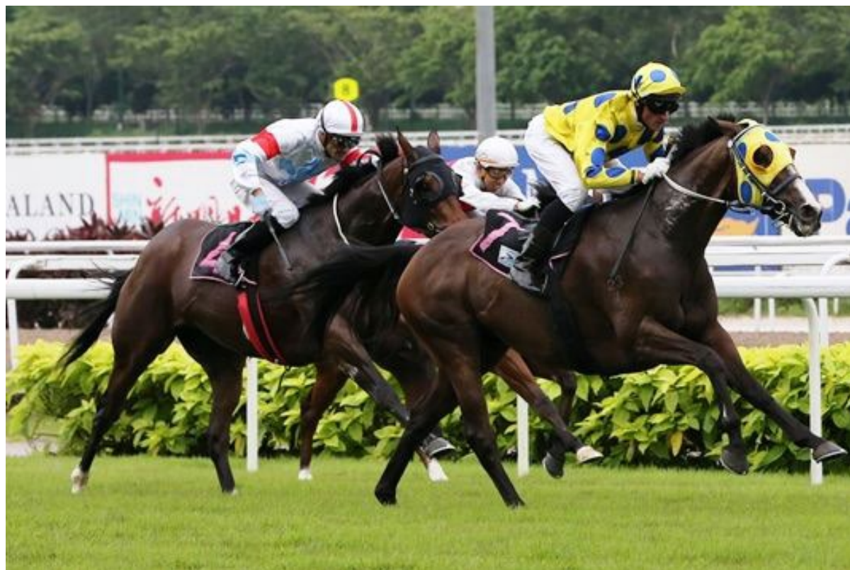
Mr Spielberg bounces back to his best at Kranji

Mr Spielberg has now brought his handy record to five wins from 18 starts for stakes earnings past the $210,000 mark for the Oscar Racing Stable.