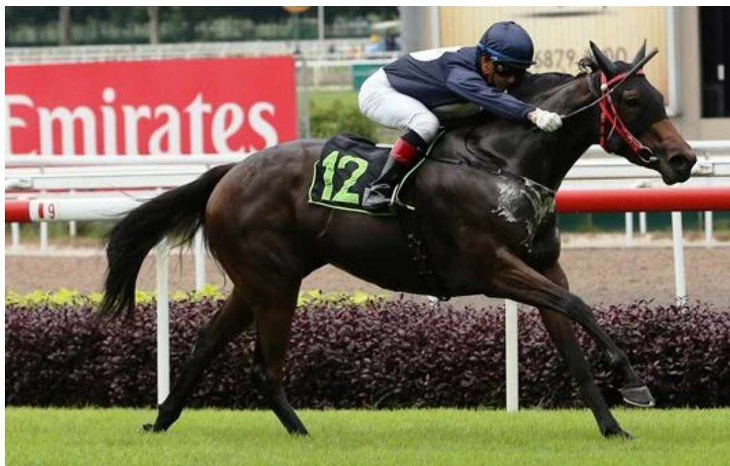
Moonraker dashes to victory to record the first win for her sire Onceuponatime.