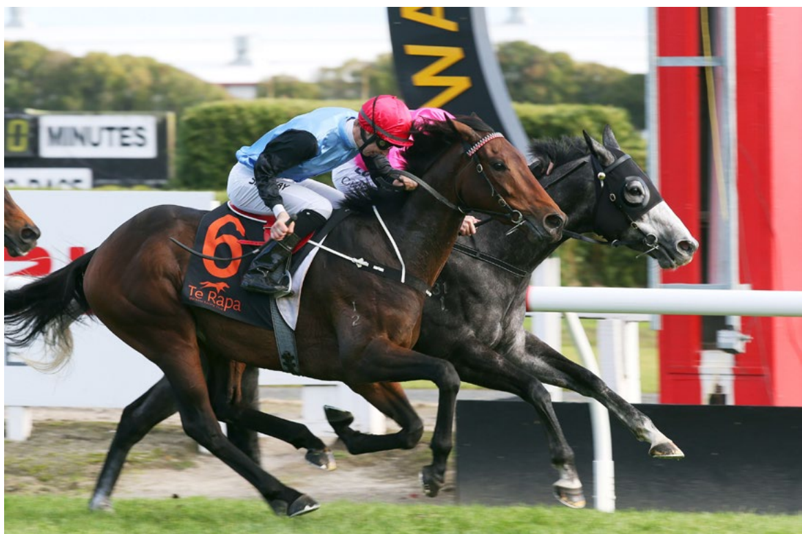
Blue Wagon pokes his nose in front along the rail to snatch victory at Te Rapa

Forsman had been confident of a good showing from the winning pair