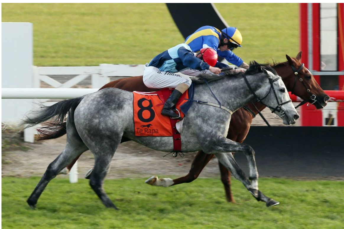
Scamp emulates his stablemate with another narrow victory margin to cap off a top day for his stable