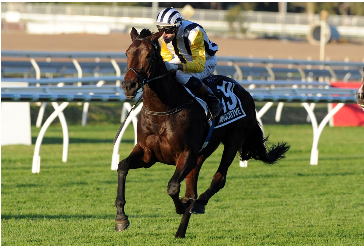
Group One Queensland Oaks winner Provocative