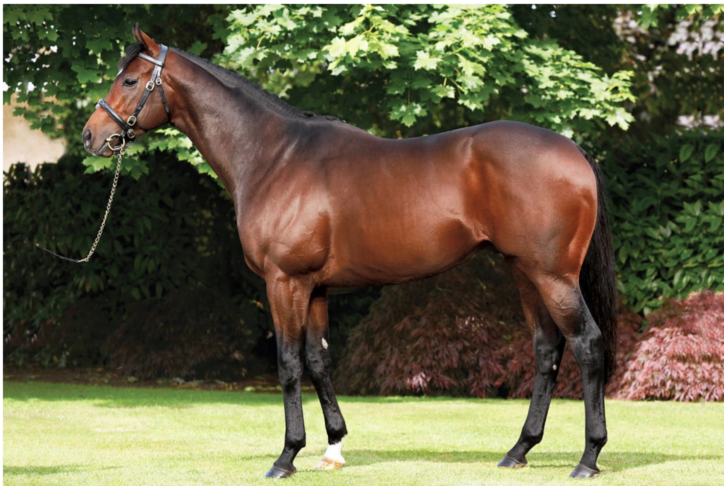
Cambridge Stud based stallion Power