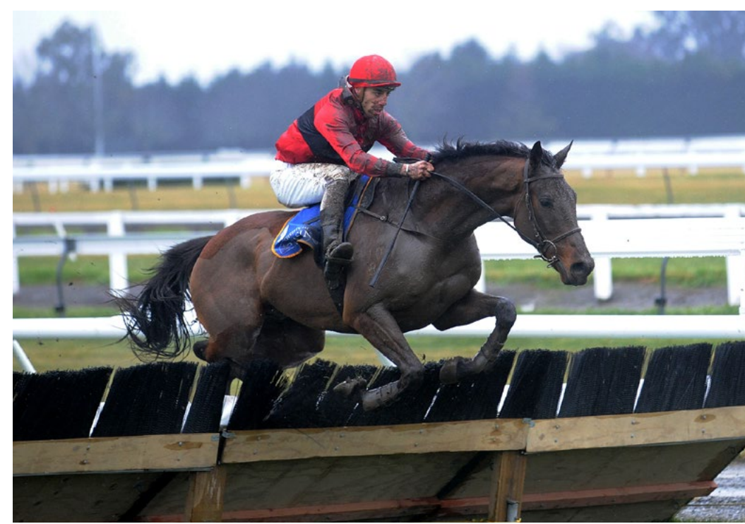
Second Innings produced a gritty display to make it back-to-back wins over the hurdles at Riccarton

"He hasn't been backed up that quickly before so I guess