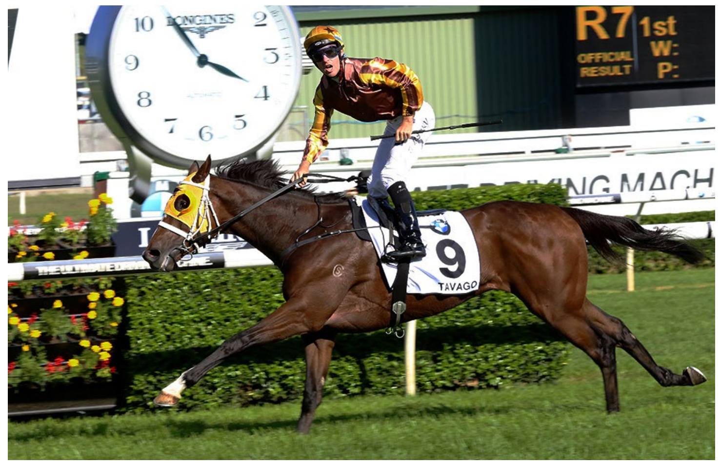
Tavago is on schedule to resume in the Gr. 1 Memsie Stakes

ustralian Derby winner Tavago (NZ) (Tavistock) is on target to kick off his spring campaign in the Gr. 1 Memsie Stakes at Caulfield.