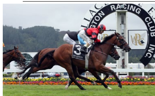
Dukedom (NZ) (Bachelor Duke)

"He's staying at home – he showed signs of going over the top so he'll have a couple of weeks in the paddock and then we'll get him ready for the Hawke's Bay carnival," she said. Full story here.