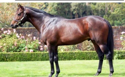
Per Incanto (Street Cry)

"It was only really the last 20 metres that she really attacked the line and showed a good will to win, and obviously good staying ability. The extra distance in the Oaks is going to be no dramas with her and she's clearly on the up."