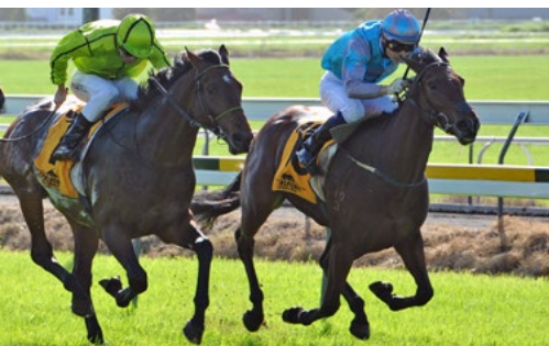
Hello M'Lady (NZ) (Shocking)