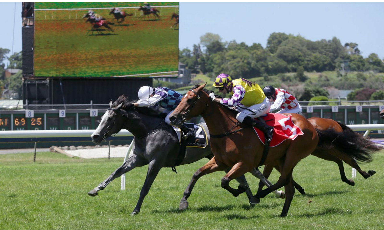
Sacred Elixir will look to maintain his unbeaten Queensland record in the Gr. 2 Sires' Produce Stakes at Doomben