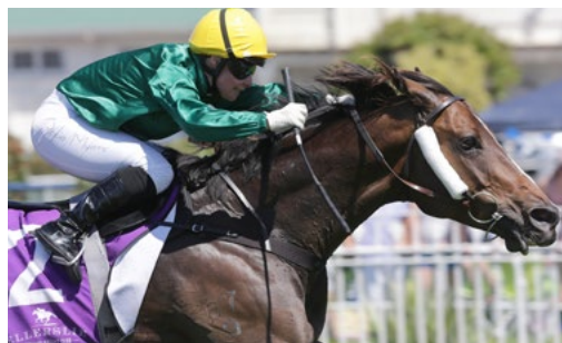
Benzini (Tale Of The Cat)

"It's all about keeping him happy wherever he is in the run, as he can get off the bridle and pull hard. With the right run, I think he can finish in the top four."