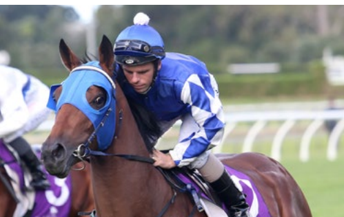
Quantum (NZ) (Keeper)