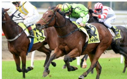
Street Smart (NZ) (Shocking)

"She loves wet ground and she wants a bit more distance," Prendergast said. "I keep wanting to turn her out, but she keeps giving me excuses not to."