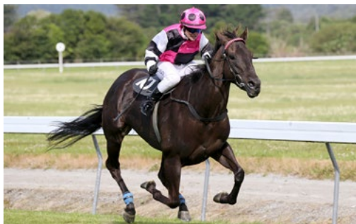
Hayley Maree (NZ) (Le Bec Fin)

The fee for Per Incanto's associate sire Nadeem, who has produced two Group Three winners in Australia this year, will also stay unchanged at $6500 + GST.