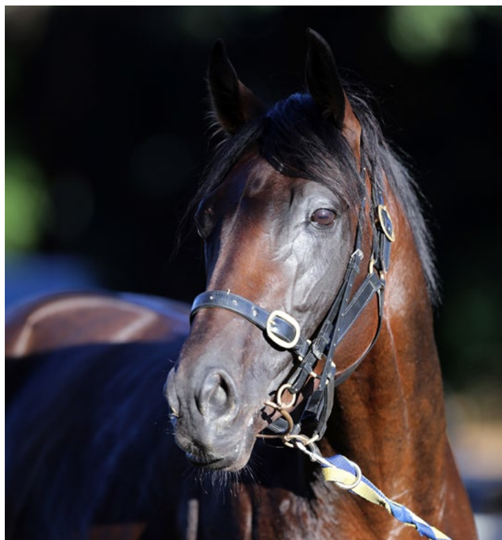
Windsor Park Stud have joined forces with the Inner Mongolia Rider Horse Group to stand multiple Group One winner Mongolian Khan

Mongolian Khan is a son of Danehill’s highest ever rated juvenile Holy Roman Emperor, an internationally successful Group One producer of the Hong Kong Horse of the Year Designs On Rome.