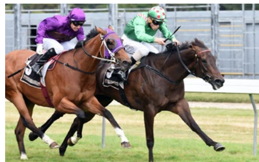
Duchess Kate (NZ) (Savabeel)