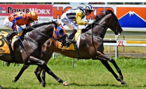
Provocative (NZ) (Zabeel)

"I've won a few Group Ones in partnership with my father. The only difference is I didn't get to see any of that money whereas if Music Magnate does win, I'll get to see a fair chunk of it."