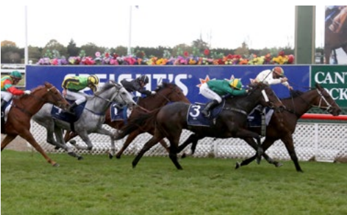
Authentic Paddy (NZ) (Howbaddouwantit)

"I was a bit disappointed in her last run, but she's very well in herself and she may have just had an off day," he said. Full story here.