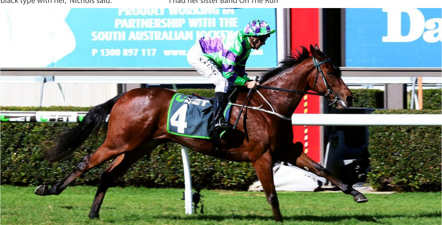
I Am A Star has no trouble racking up a three-length win against the juveniles at Morphettville.