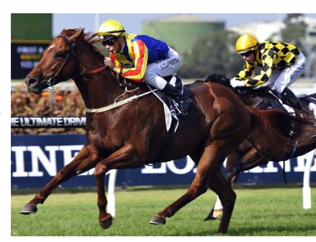
Spieth lives up to his reputation with a demolition job on the three-year-old sprinters at yesterday's Rosehill meeting.

"He's got a vicious turn of foot. That's going to hold him in brilliant stead going forward.