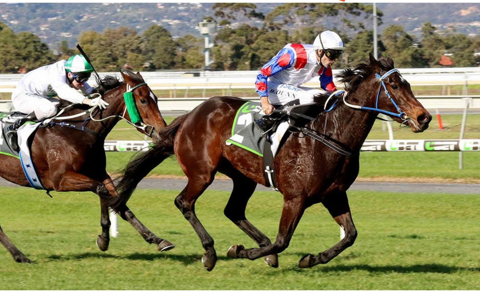
The well-travelled Chabaud gets a deserved win in the South Australian Fillies Classic.

he durability shown by Chabaud (NZ) (Lookin At Lucky) has earned her a trip to Queensland following a gritty victory in yesterday's Group Three South Australian Fillies Classic over 2500 metres at Morphettville.