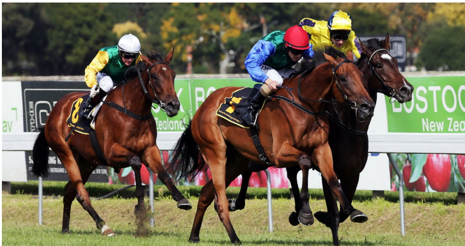
Jon Snow puts a disappointing Te Rapa debut behind him with a decisive win at yesterday's New Plymouth meeting.