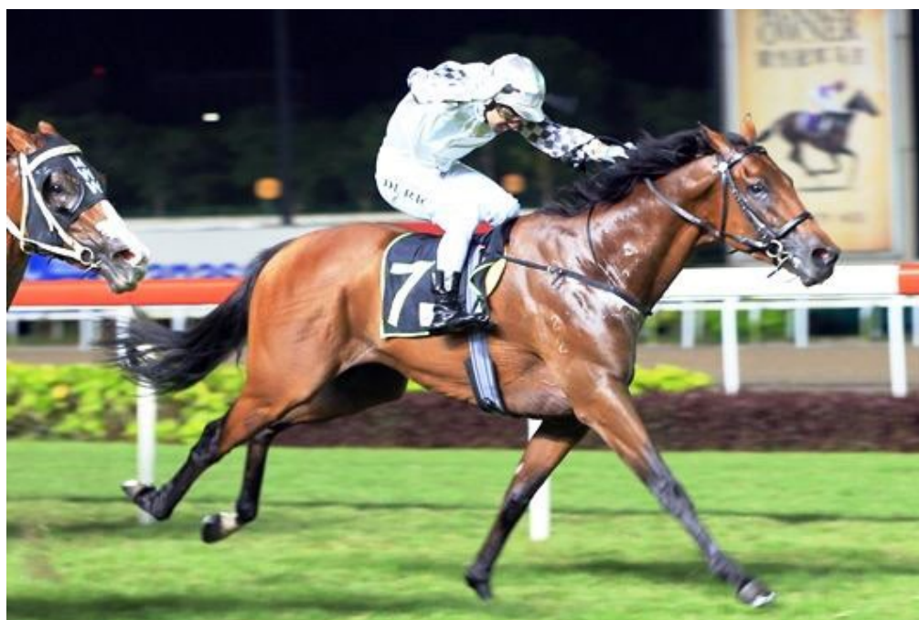
Alibi makes it two-from-two at Kranji on Friday night.