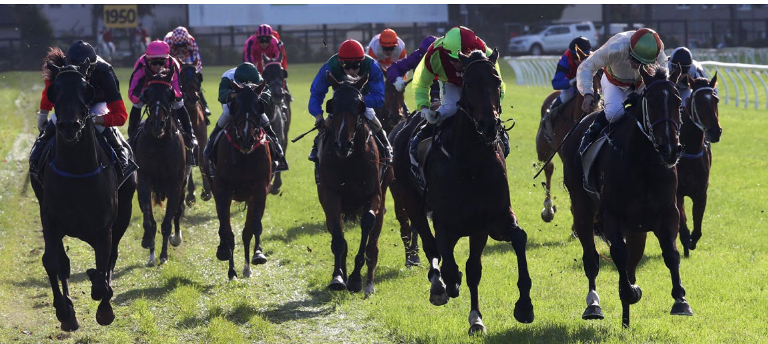
Wide on the track in search of better going, the Rotorua Cup field are led in their charge to the finish by Storming The Tower (green and maroon colours), with Gentil Tonton (black and red) to his outside and topweight Authentic Paddy on his inner.