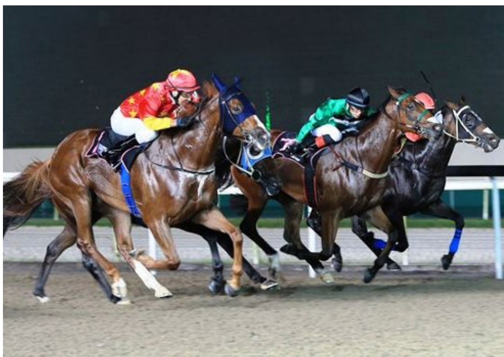
Olympic Anthem (nearest camera) does best in a massed finish to Friday night's sprint.