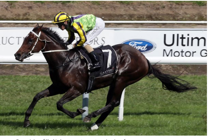
Promising filly Nahema returns to winning form in style at Tauranga on the weekend

"We just haven't been able to work out what has been going on with her during this preparation," he admitted 24 hours after her Tauranga victory.