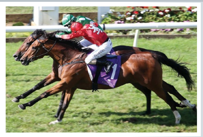
VOLKSTOK'N'BARRELL (NZ) (Tavistock) wins the Gr.1 Bonecrusher New Zealand Stakes 12-3-16