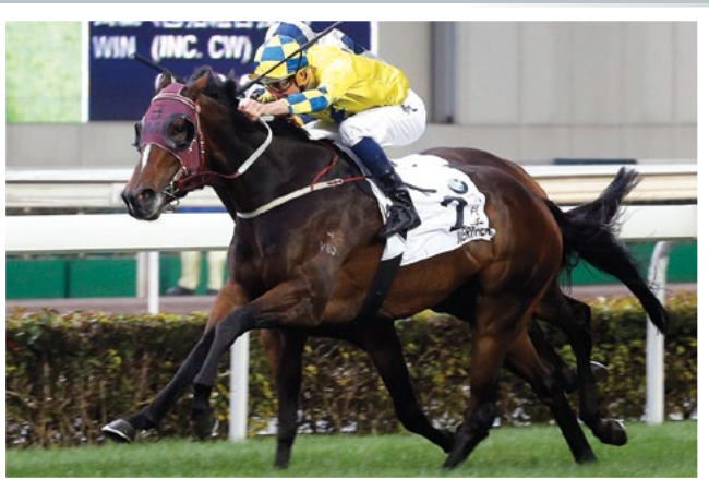
WERTHER (NZ) (Tavistock) wins the HK Gr.1 BMW Hong Kong Derby 20-3-16

Applications for nominations to Tavistock 2016 Service season are now being received and will close on the 30th April 2016