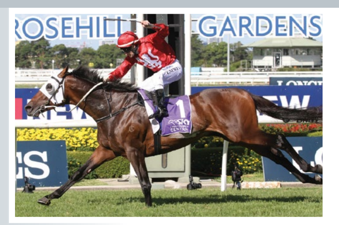
TARZINO (NZ) (Tavistock) wins the Gr.1 Rosehill Guineas <u>19-3-16</u>