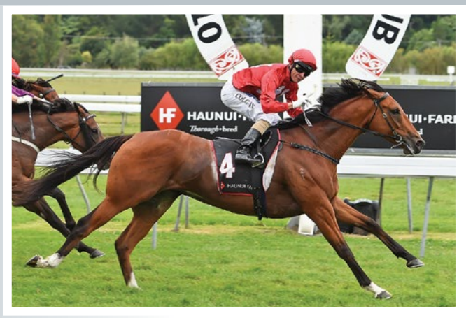
VOLKSTOK'N'BARRELL (NZ) (Tavistock) wins the Gr.1 Haunui Farm Classic 27-2-16