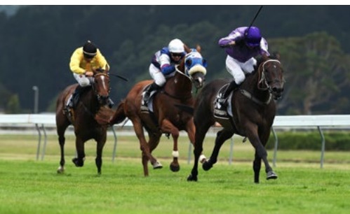
Mabeel (NZ) (Savabeel)