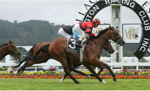
Dukedom (NZ) (Bachelor Duke)