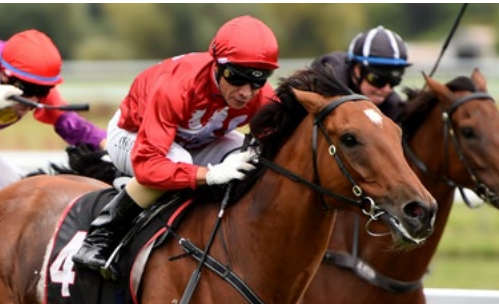
Volkstok'n'barrell (NZ) (Tavistock)

partner the multiple Group One winner, but an 11 meeting suspension has ruled him out of the opening day of The Championships on April 2.