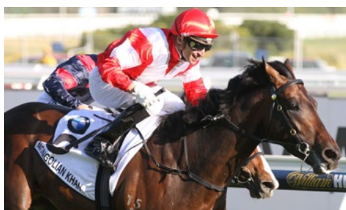
Mongolian Khan (Holy Roman Emperor)

"I'm going to sit down with the owners and contemplate Queensland. Obviously last week's Hong Kong Derby winner Werther went to Queensland before he went to Hong Kong last year so we should have plenty of time to do that." Full story here.