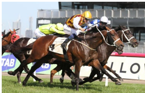
Preferment (NZ) (Zabeel)