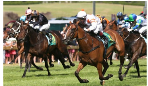
Capella (NZ) (Rip Van Winkle)

"If Who Shot Thebarman and Grand Marshal are going to be winning a Sydney Cup they are going to have to run well in a BMW, which I think they can," he said.