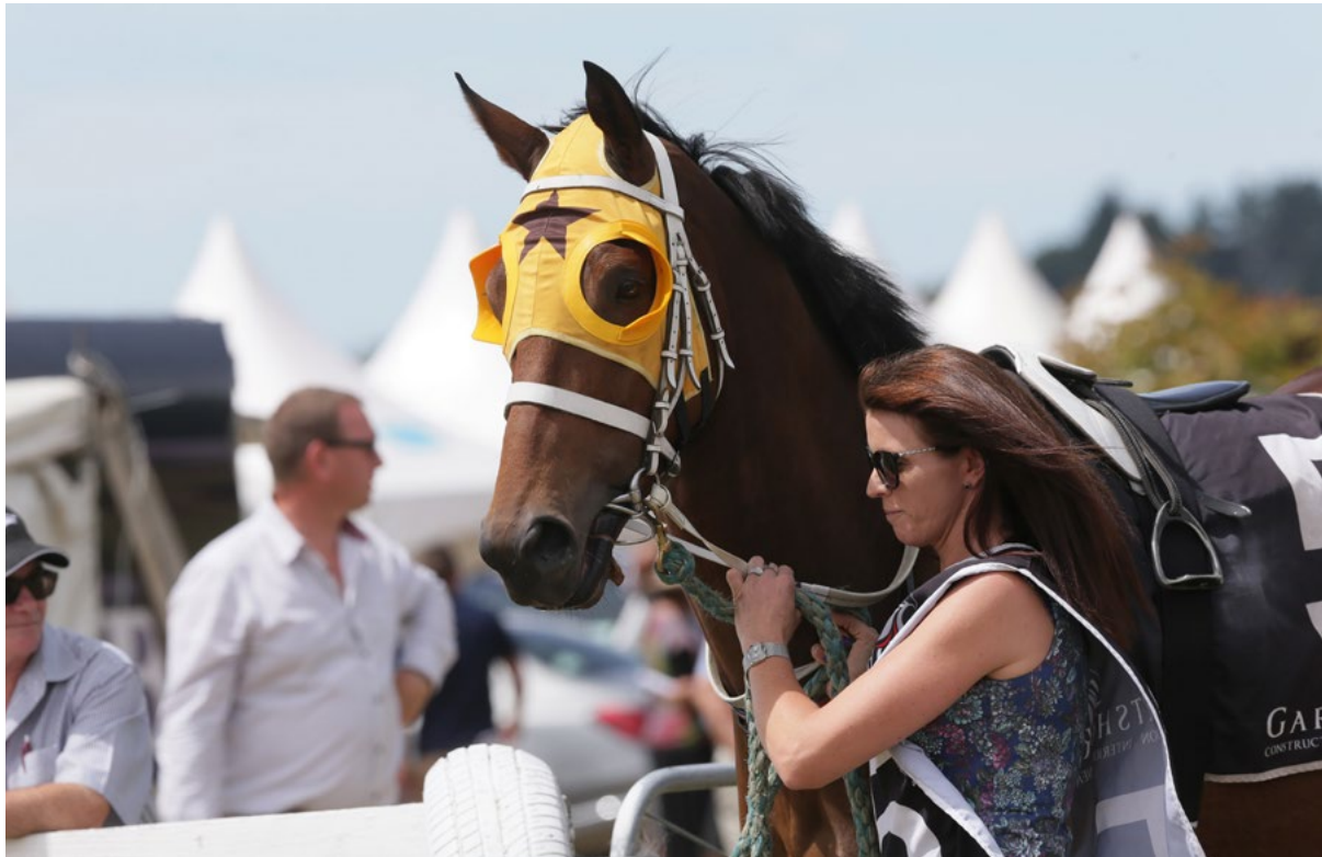
New Zealand galloper Predator will attempt to force his way into Australian Derby contention at Rosehill on Saturday