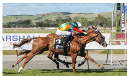
Motorbike Mike (NZ) (Perfectly Ready)

"I think he's improved again from the run, and he's thriving here in Sydney and enjoying plenty of time in the pool. There was nothing wrong with the way he hit the line last week and he only missed third by inches."