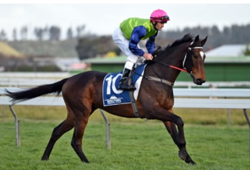
Gobstopper (NZ) (Tavistock)