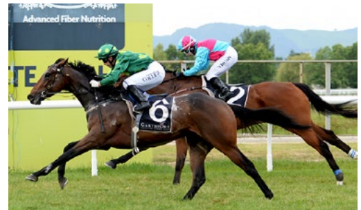
Hiflyer (NZ) (Tavistock)