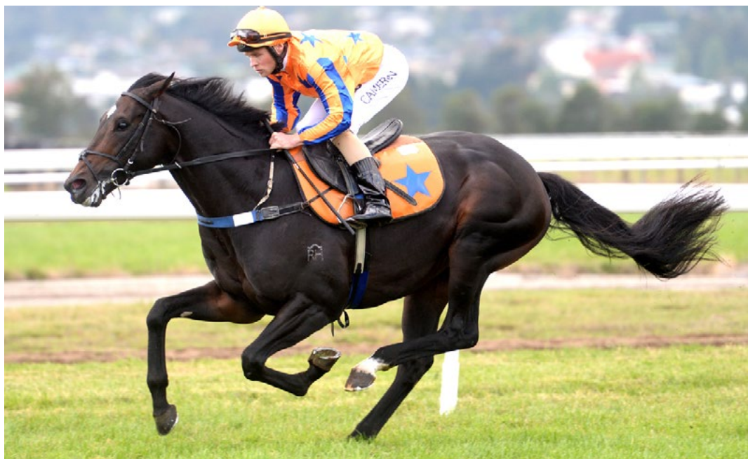
Brilliant three-year-old Xtravagant is primed for his raceday return at Te Rapa tomorrow