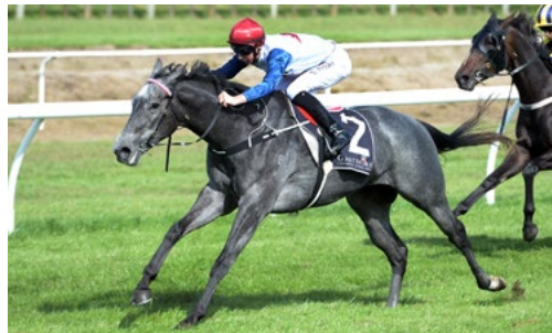
Barnaby (NZ) (Shocking)