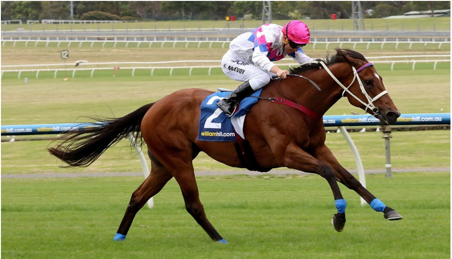
Famous Seamus will be looking for firm surfaces when he heads to Brisbane for his fourth attempt on the major sprint prizes on offer during the upcoming Queensland Winter Carnival

A change in his travel routine is expected to help spark Group One winner Famous Seamus (NZ) (Elusive City) back to top form during his fourth Brisbane campaign.