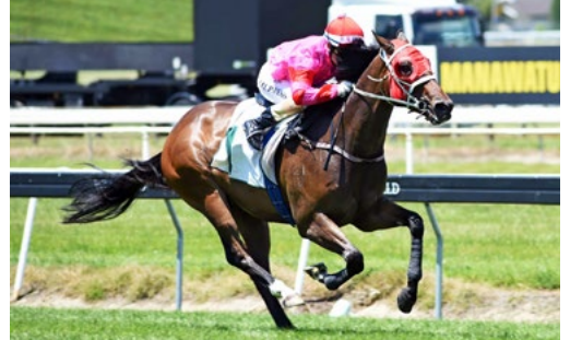
Caorunn (NZ) (Showcasing)