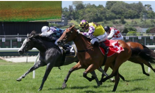
Sacred Elixir (NZ) (Pour Moi)

His biggest wins came in last year's Doncaster Mile and George Main Stakes, both over 1600m at Randwick.