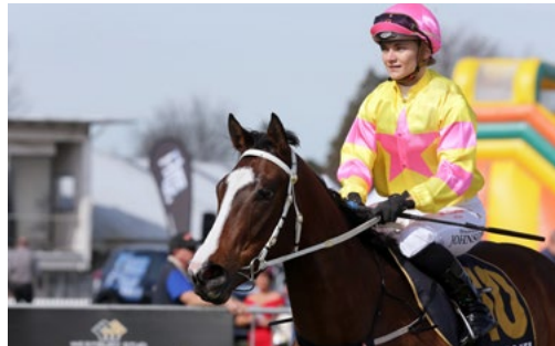
Serious Satire (More Than Ready)

The stakes-winning five-year-old mare goes into the Travis Stakes after a third placing when resuming in the Gr.2 Japan-New Zealand International Trophy (1600m)