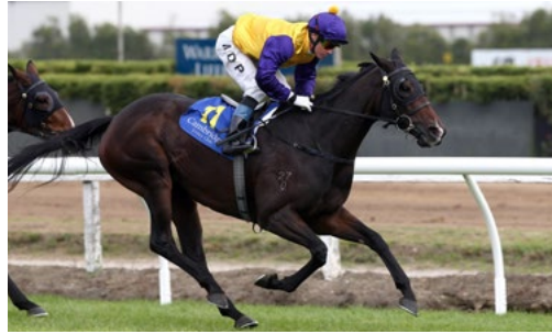
Nigelissima (NZ) (Pentire)

Full results of the April sale can be found here .