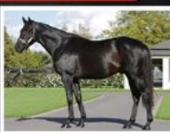
FERLAX G1 Aus Guineas Winner First Fools Impressing Service fee: $7,000 + GST

HAUNUI FARM Thoroughbred • bred | haunuifarm.co.nz