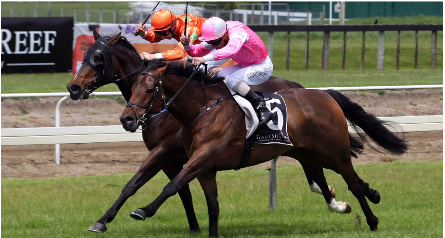
Consistent performer Gustavo will be looking to head to the spelling paddock on a high note at Awapuni today