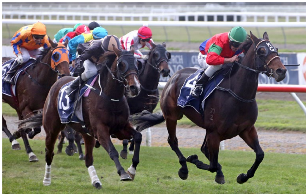
All In Vogue strides clear to score with aplomb at Riccarton