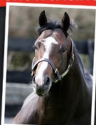
IFFRAAJ NZ's Leading 2nd Crop Sire Sire of 2016 Karaka 3YO Mile-winner Service Fee: $15,000 + GST Limited to 125 mares