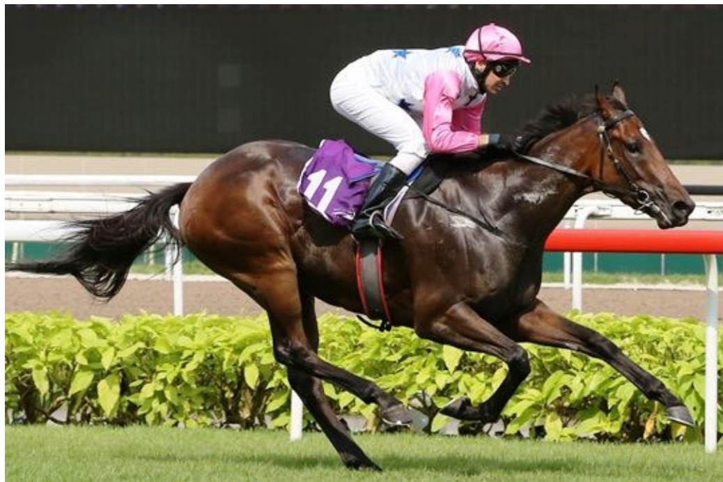
Debt Collector comes off a tough run to score a soft win in the Singapore Three-Year-Old Classic.