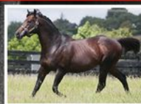
IFFRAAJ NZ's Leading 2YO Sire Sire of 2016 Karaka Million-winner Service Fee $17,500 + GST Limited to 100 mares