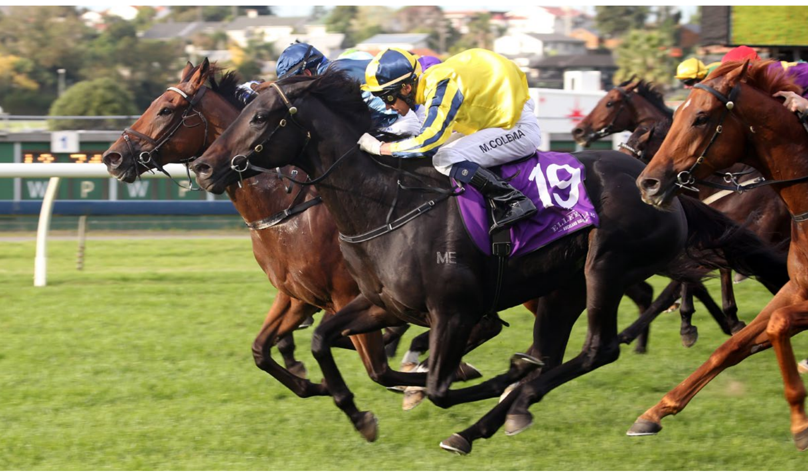
In a thrilling finish typical of Ellerslie's iconic Easter, Sound Proposition (#19) gets up in the last stride to snatch victory from Trojan Warrior. To their inside, the totally obscured Rasa Lila ran third, nosing out Sakhee's Soldier, who manages to poke his head into the picture out wide.

istory repeated itself for Wexford Stables when Sound Proposition (NZ) (Savabeel) came off the ballot to win the Group One Manco Easter Stakes at Ellerslie yesterday.