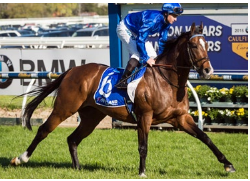
Contributer (High Chaparral)

Fellow Waikato Stud stallion Sacred Falls (O'Reilly) will again stand at a fee of $30,000 plus GST, LFG; Ocean Park (Thorn Park) will stand at a fee of $30,000 plus GST, LFG; Pins (Snippets) will stand at a fee of $25,000 plus GST, LFG; Rock N Pop (Fastnet Rock) will stand for $9000 plus GST, LFG; Rios (Hussonet) will stand at a fee of $4,000 plus GST, LFG. Full story here.