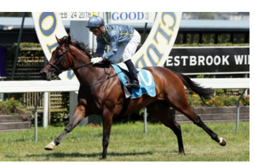
Romantic Maid (High Chaparral)

Romantic Maid (High Chaparral) will attempt to turn the tables on stablemate The Hassler (NZ) (Shocking) and defeat