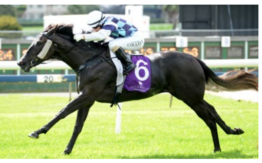
Astara (NZ) (Dalghar)