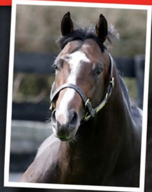
NZ's Leading 2nd Crop Sire Sire of 2016 Karaka 3YO Mile-winner

Service Fee: $15,000 + GST Limited to 125 mares