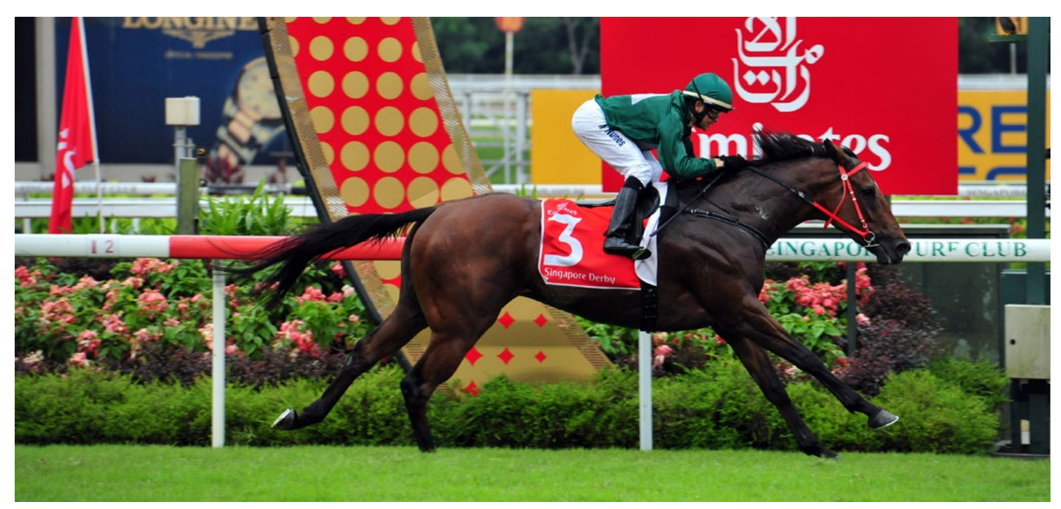
Spalato is looking to bounce back to winning form in the rich Gr.1 Lion City Cup on Sunday

"I just hope he bounces back on Sunday but it will be tough. Even though it is now a set-weight race, he is up against the same horses who beat him, and Emperor Max and Zac Spirit are not just any horse, they were first-up and they have improved from that run as well."