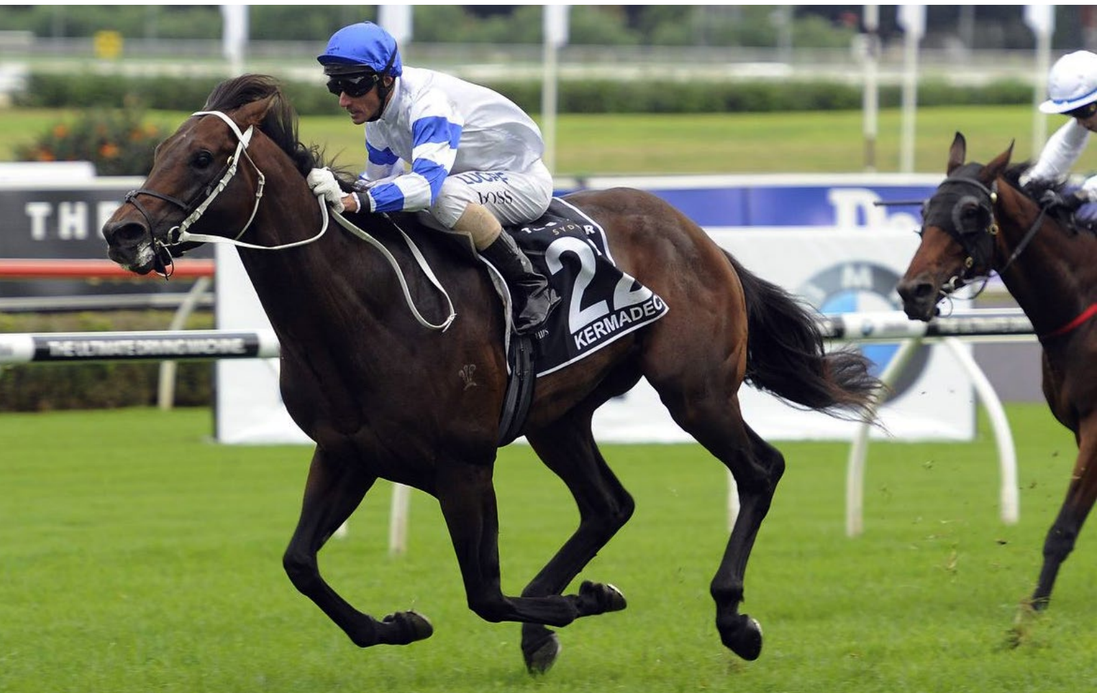
2015 Gr. 1 Doncaster Handicap winner Kermadec

A stud deal is imminent for Group One winner Kermadec (NZ) (Teofilo) who could still round out his career at Royal Ascot.