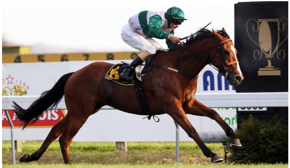
Southern Icon scoots clear for another impressive front-running victory

“He is doing all the right things at the moment and I guess as he has matured it has ironed out some of the kinks he had