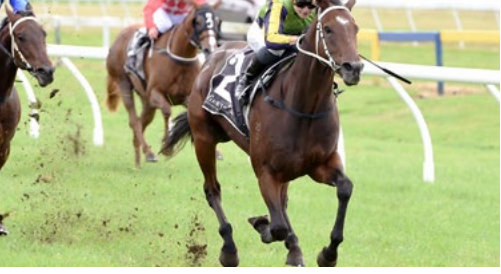
Ugo Foscolo (NZ) (Zacinto)

important for his future at stud to see that ability confirmed as a three year old."