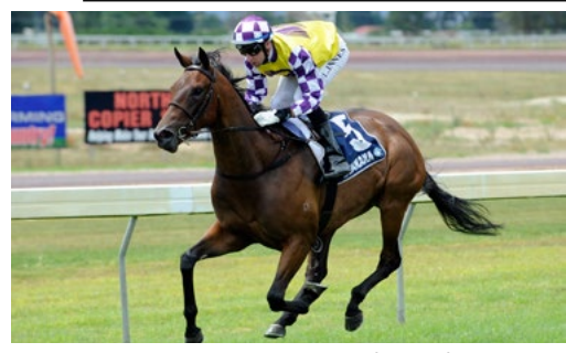
El Sagrado (Azamour)

enough to convince him he's worthy of a trip to Riccarton for the Gr.3 Canterbury Gold Cup (2000m) seven days later. Full story here.