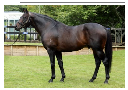
Shocking (Street Cry)

They will be joined once again by G1 Australian Guineas-winner Ferlax (NZ) (Pentire), whose fee remains at $7,000 + GST. Full story here.