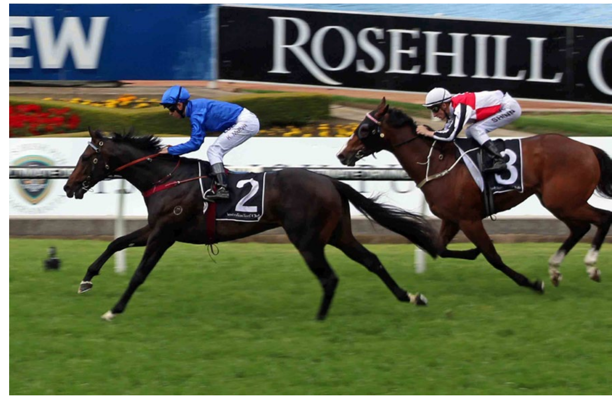
Sweynesse winning the Gr. 3 Gloaming Stakes

"Sweynesse is the highest-rated stallion from the Zabeel sire line to begin stud duties in New Zealand since Savabeel. On the racetrack, Sweynesse was