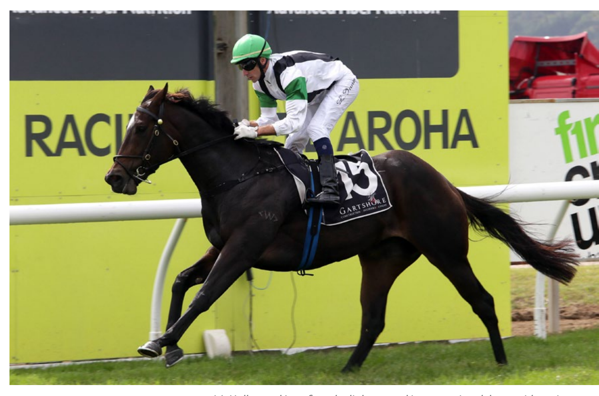
It's Hollywood Lass first, daylight second in a stunning debut maiden win.

Hollywood Lass had won both her trials leading into the Te Aroha Liquor