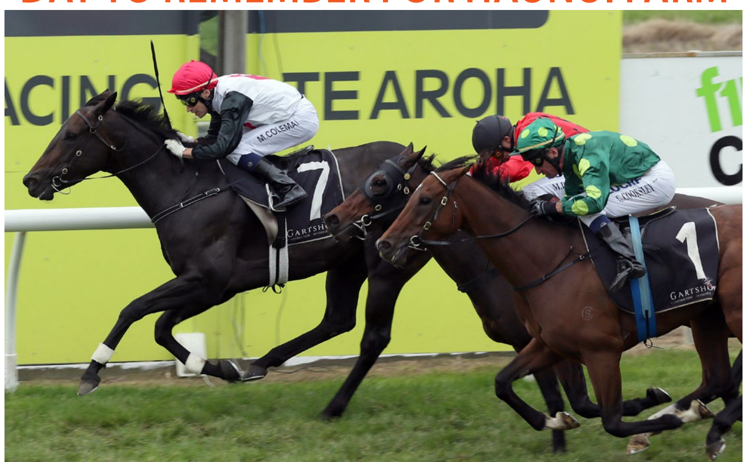
Perfect Fit (#7) has enough in hand to hold out the late charges of Abidewithme (#1) and the southern mare Soubrettes in the New Zealand Thoroughbred Breeders' Stakes.

stunning Group One success capped a perfect day at Te Aroha for one of the country's leading nurseries. The Haunui Farm-bred and owned pair of Nelson Park (NZ) (Iffraaj) and Chancery (NZ) (Makfi) quinellaed the Rating 65 mile before the Karaka stud's star performer Perfect Fit (NZ) (Elusive City) continued her rapid rise to the top with victory in the Fiber Fresh NZ Thoroughbred Breeders' Stakes.