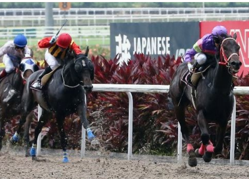
Zip A Dee Doo Dah stakes his claim for a tilt at the Singapore Derby