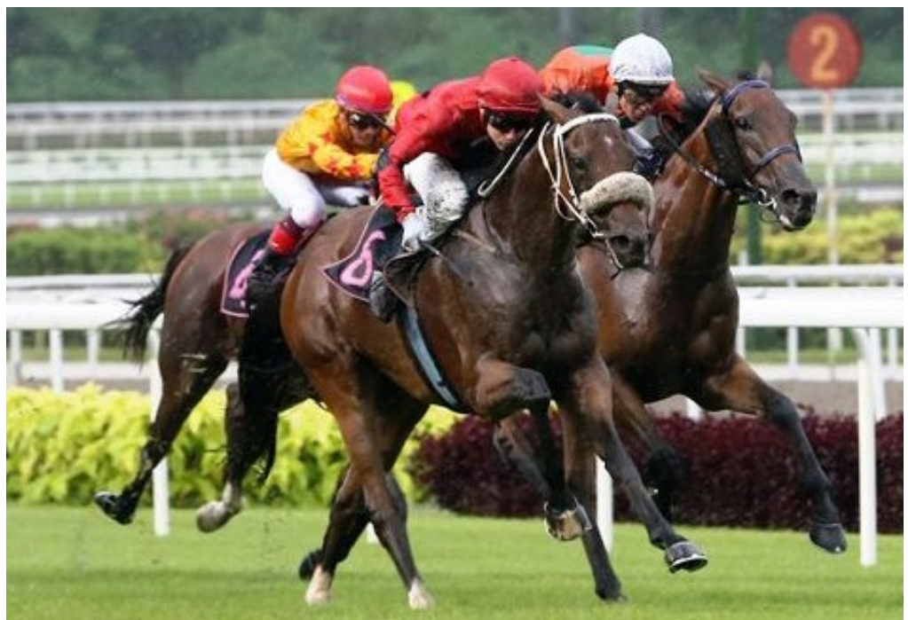
Humdinger comes with a late charge to score nicely at outside odds.