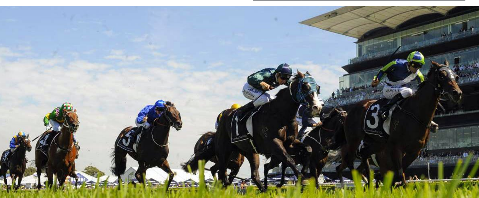
He's Our Rokkii (#3) stamps himself as a miler of the future with a Carbine Club win at Randwick on Doncaster day.