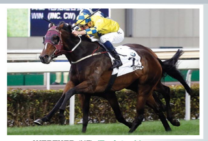
WERTHER (NZ) (Tavistock) wins the HK Gr.1 BMW Hong Kong Derby <u>20-3-16</u>

Applications for nominations to Tavistock 2016 Service season are now being received and will close on the 30th April 2016