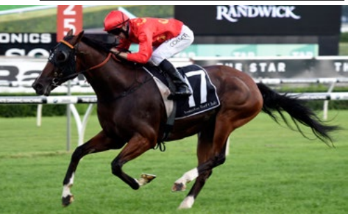
Montaigne (NZ) (Road To Rock)

"He has played a key role in our operation, which during his time with Ballymore has produced 115 wins, including six at Group or Listed level for prizemoney just short of $2 million."