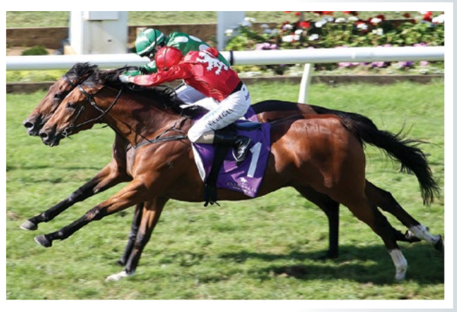
VOLKSTOK'N'BARRELL (NZ) (Tavistock) wins the Gr.1 Bonecrusher New Zealand Stakes 12-3-16