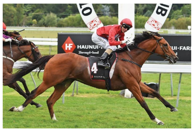
VOLKSTOK'N'BARRELL (NZ) (Tavistock) wins the Gr.1 Haunui Farm Classic 27-2-16