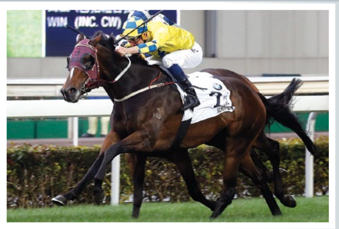
WERTHER (NZ) (Tavistock) wins the HK Gr.1 BMW Hong Kong Derby 20-3-16

Applications for nominations to Tavistock 2016 Service season are now being received and will close on the 30th April 2016