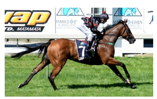
Volpe Veloce (Foxwedge)

A $240,000 Karaka yearling purchase, the daughter of Foxwedge took out the