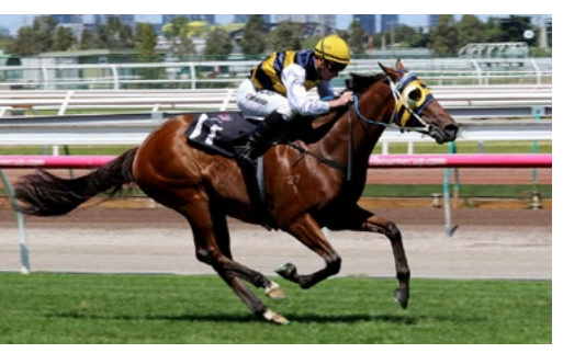
Pemberley (NZ)