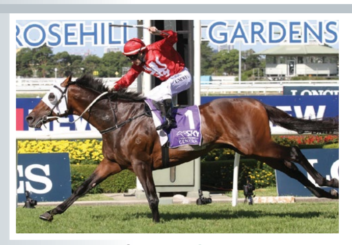
TARZINO (NZ) (Tavistock) wins the Gr.1 Rosehill Guineas 19-3-16