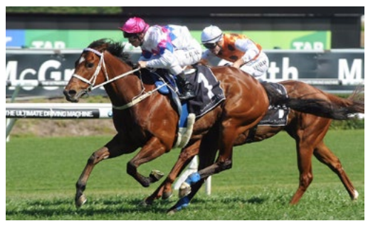
Famous Seamus (NZ) (Elusive City)

Give Famous Seamus (NZ) (Elusive City) an inside barrier and a firm racing surface and his bona fides as a Group One sprinter