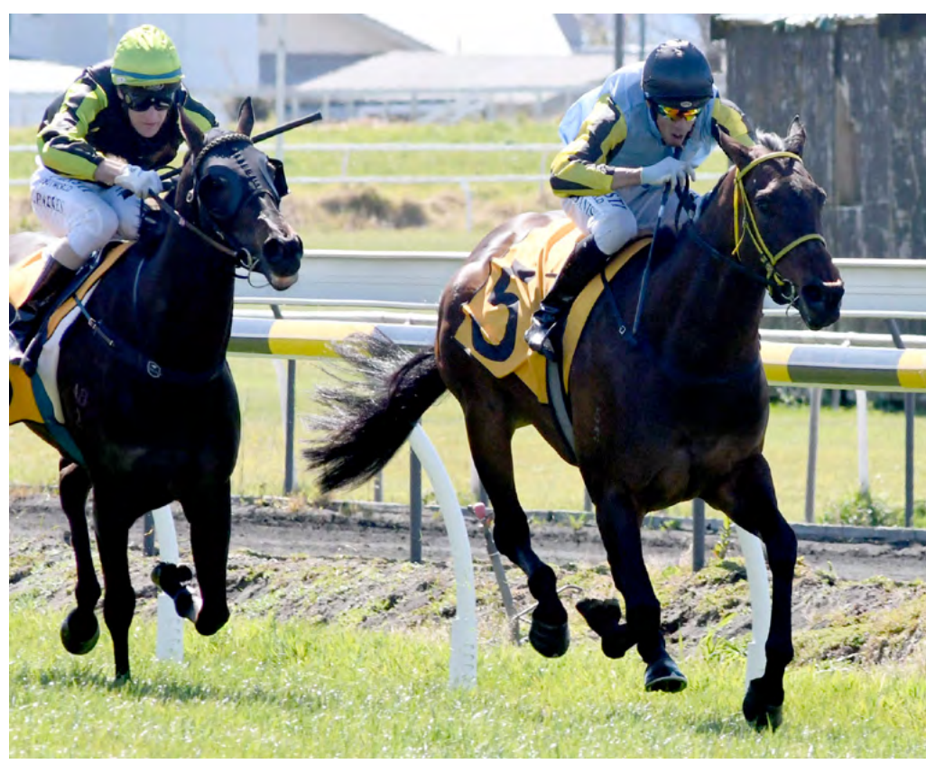
Santa Monica bursts clear to score at New Plymouth

Rotorua stakes race now and get some black print," he said.