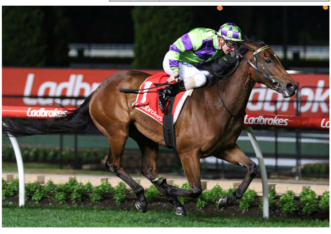
I Am A Star has Group One assignments ahead of her after her Gr.2 Stocks Stakes win