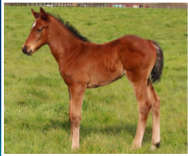
Colt ex. Silke Top (Librettist) Bred by Valachi Downs