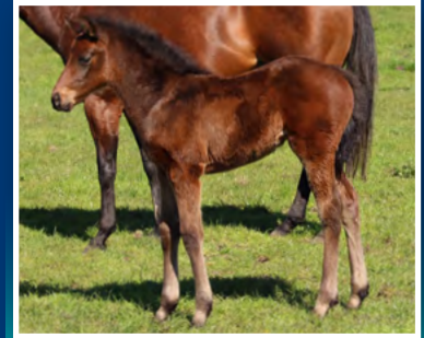
Filly ex. Penthouse Princess (Pentire) Bred by Rich Hill