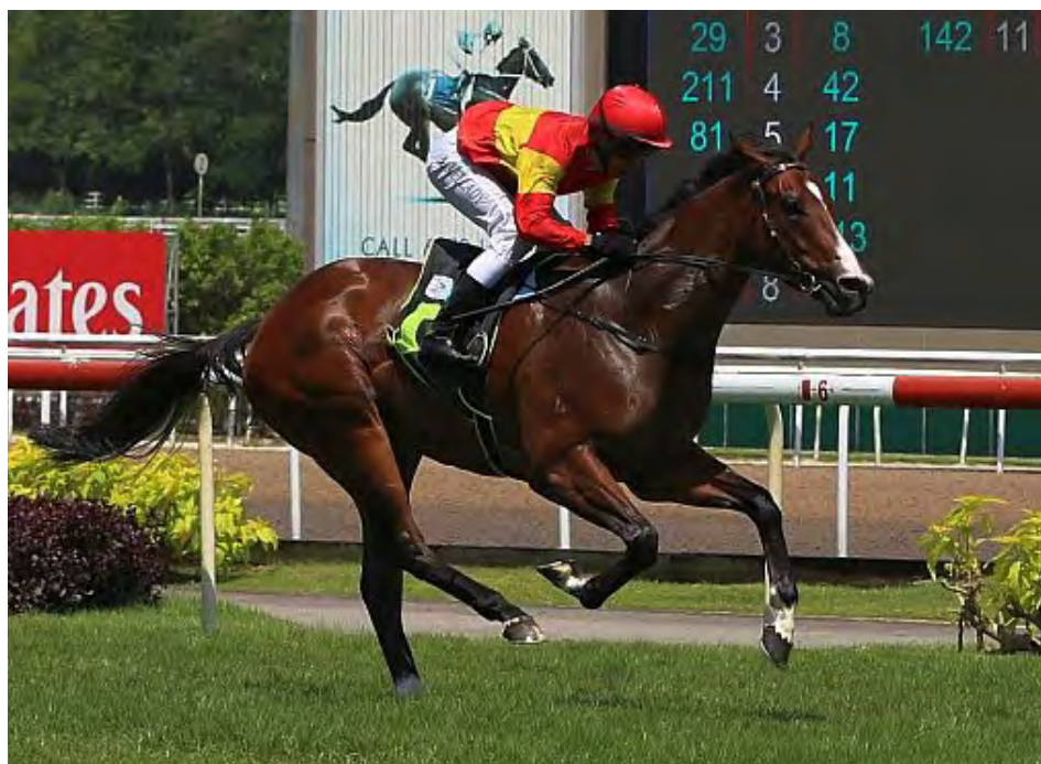
Be Bee returns to winning form at Kranji