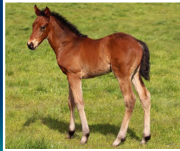
Colt ex. Surooh (Pivotal) Bred by Valachi Downs