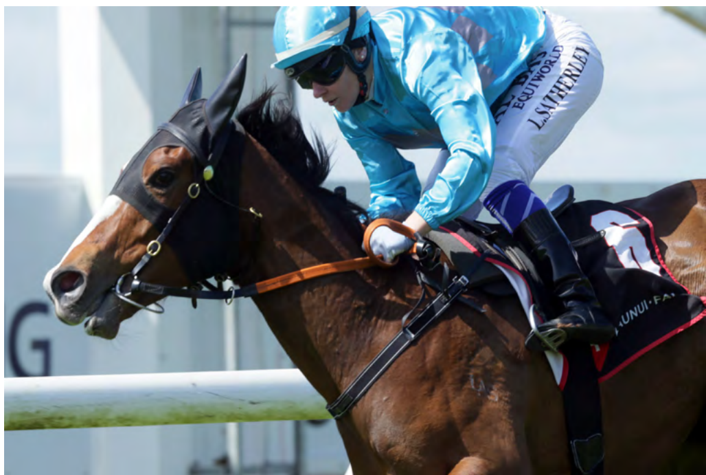
Beauty Diva ran out an easy winner of the two-year-old scamper at Pukekohe