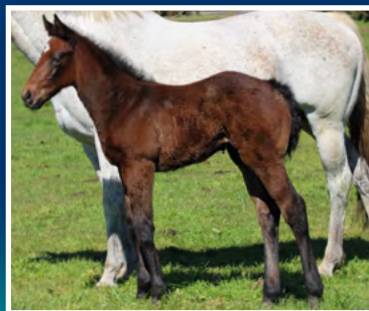
Filly ex. Bluegrass (Fasliyev) Bred by Rich Hill