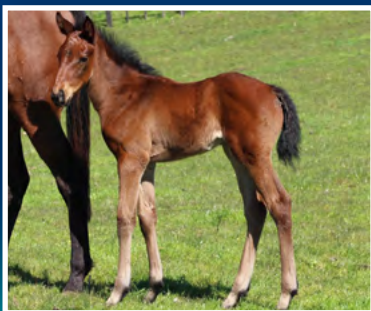
Filly ex. So Ard (High Chaparral) Bred by Hill Interior Linings