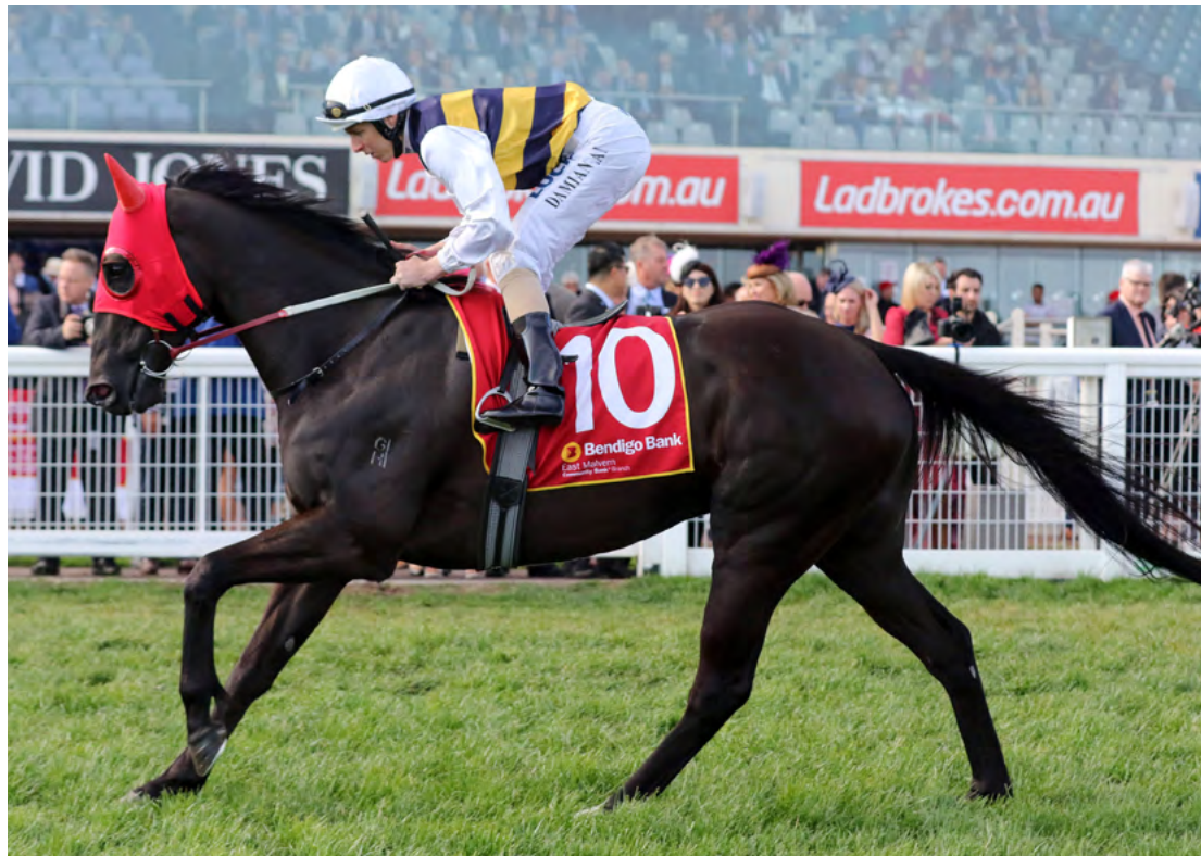
Night's Watch secured a berth in the $5 million Gr.1 Caulfield Cup with his win on Saturday