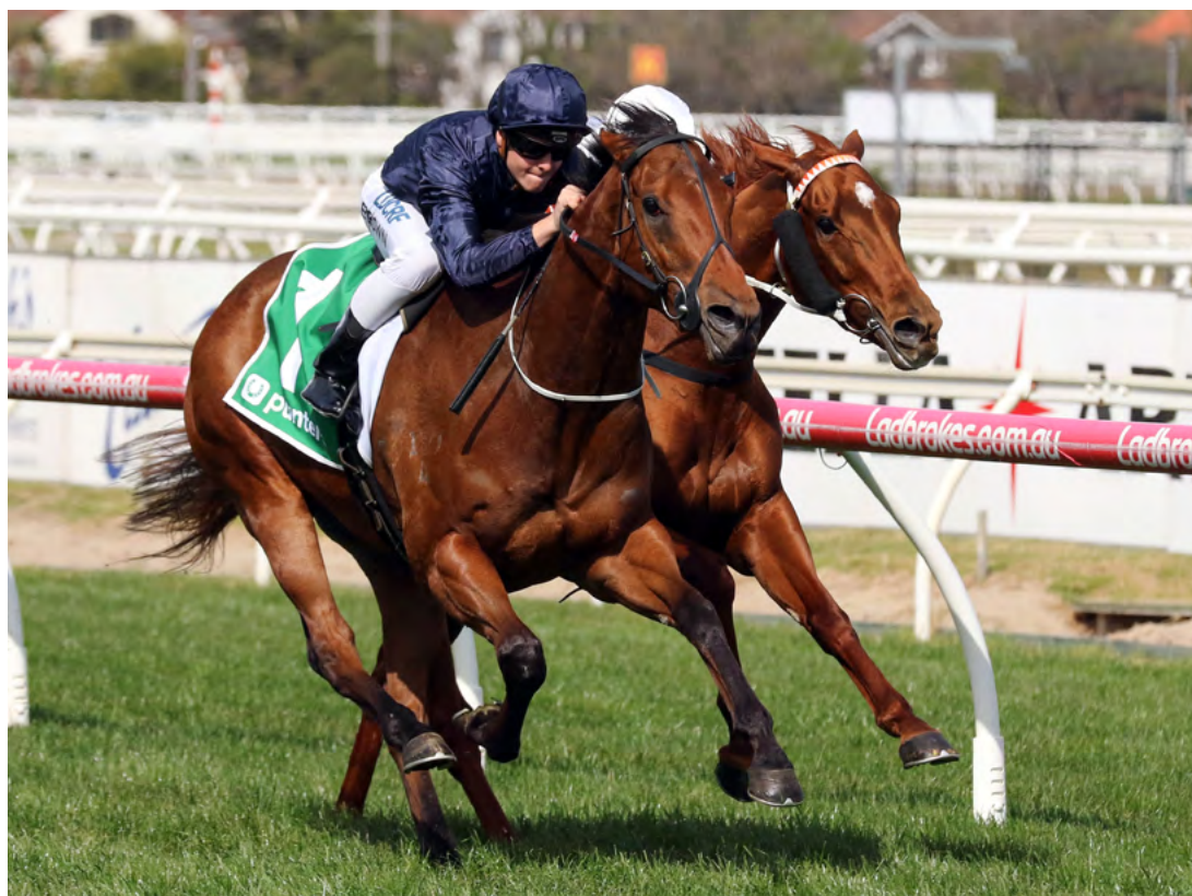
Tulip easily accounted for her rivals