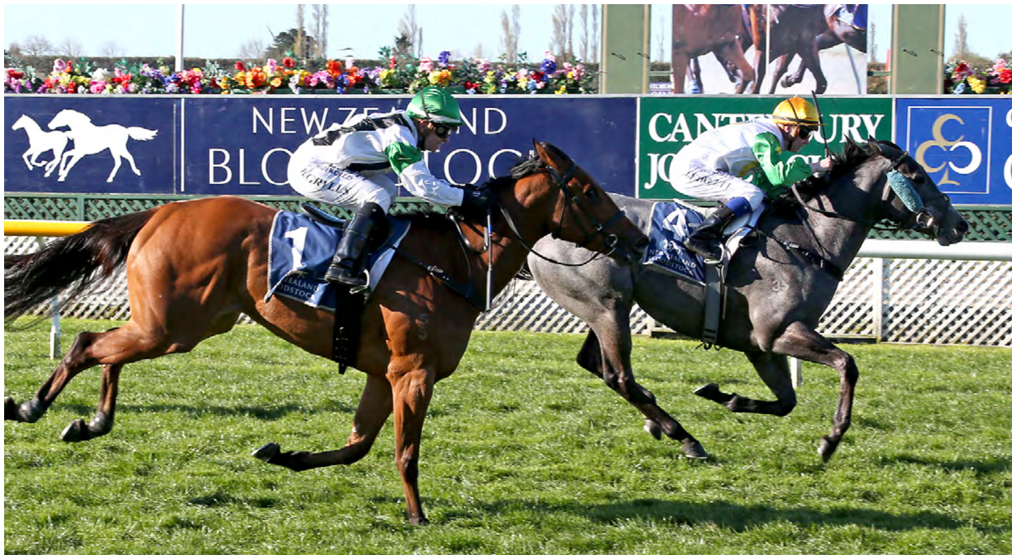
Emily Margaret has the better of Wekaforce as she hits the finish line at Riccarton