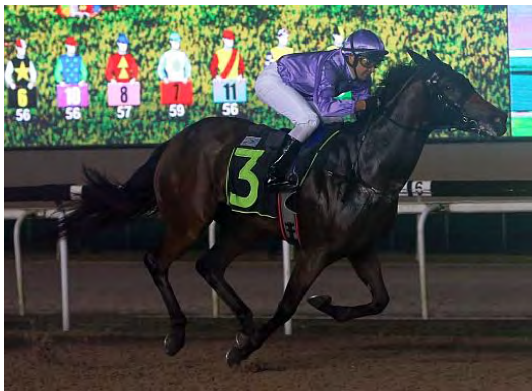
Cracking Tottie races away to her first win

"I'm sure now she's a mature mare she's got another string to her bow."