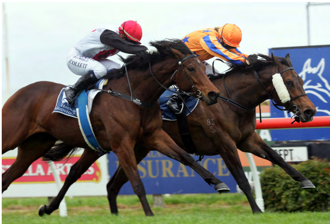
Avantage (inner) gets in the deciding stride to head Xpression at Hastings (Trish Dunell)

After securing the coveted one barrier draw Avantage was sent out a warm favourite by punters with the well fancied local filly Xpression (NZ) (Showcasing) expected to pose her biggest threat. That scenario played out exactly as predicted as the pair set down to a tooth and nail struggle over the final stages of the contest with Avantage putting her head in front