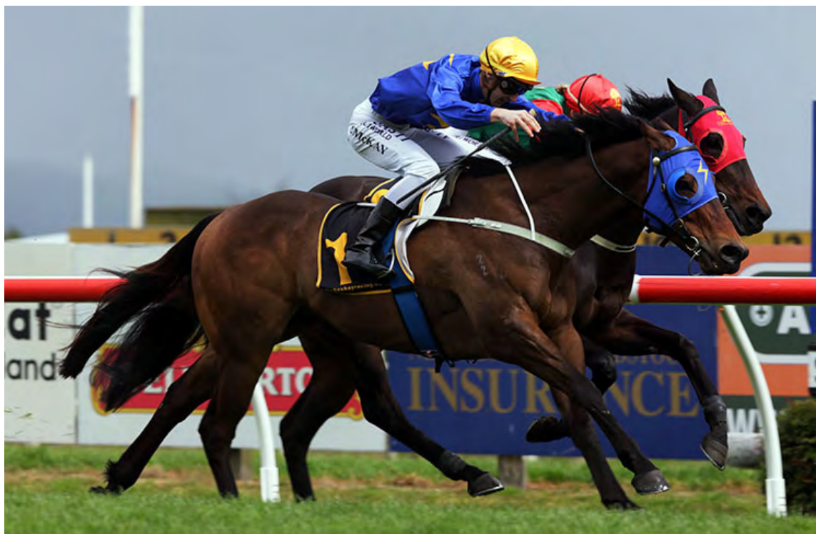
Amarula stretches hard to snatch victory at Hastings

the leader. When he's there he's got a good turn of foot.