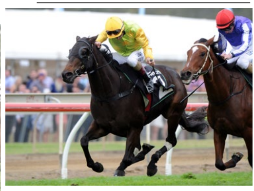
Amexed (NZ) (Pentire)