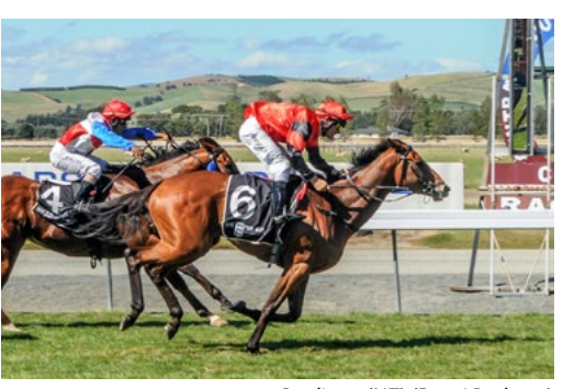
Replique (NZ) (Darci Brahma)