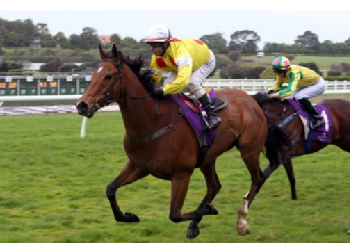
El Pescado (NZ) (El Hermano)