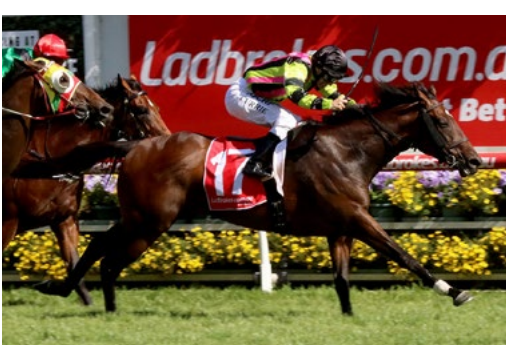
Suavito (NZ) (Thorn Park)

Stud and she will be served by resident stallion Savabeel in the coming weeks.