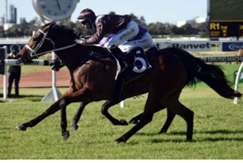
Awoke (NZ) (Rip Van Winkle)

He will also be over the moon if the rain forecast for Hawke's Bay arrives. Full story