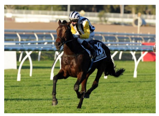
Provocative (NZ) (Zabeel)

"She only had the eight starts and she did