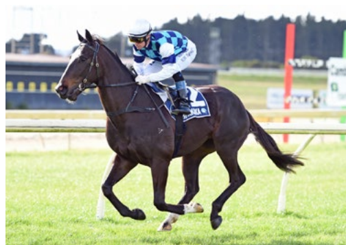
Dashper (NZ) (Redwood)