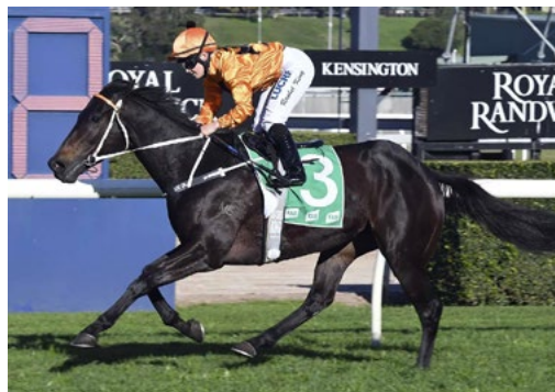
Sound Proposition (NZ) (Savabeel)