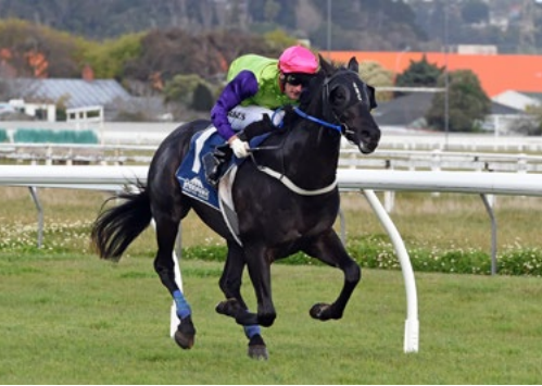
Waldorf (NZ) (Highly Recommended)