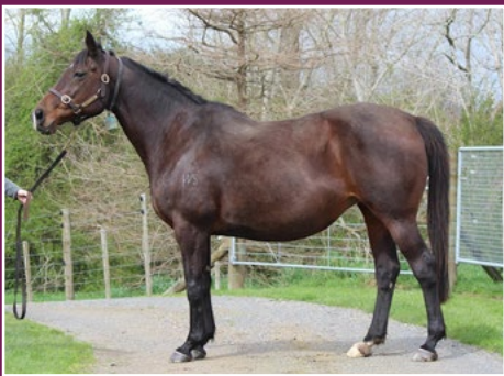
O'REILLY mare i/f to OCEAN PARK.

Featuring 43 Lots including yearlings, two-year-olds, racing stock and broodmares PLUS bid on signed Gr.1 Tarzino Trophy saddlecloths that are up for auction to raise funds for the Cancer Society.