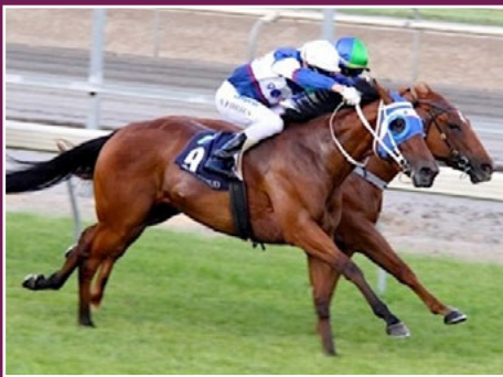
Recently retired black-type mare.