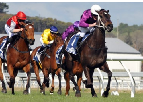
Dijon Bleu (NZ) (Burgundy)