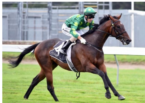
Hiflyer (NZ) (Tavistock)