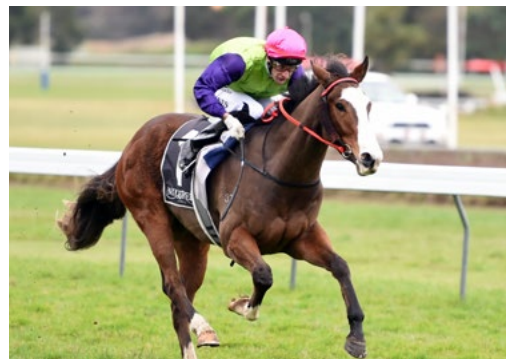
(Excelebration)