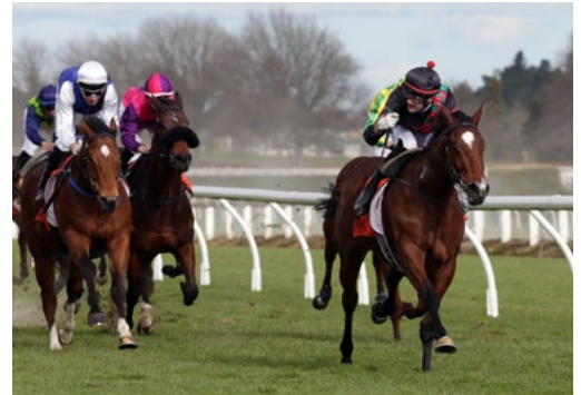
Volpe Veloce (Foxwedge)