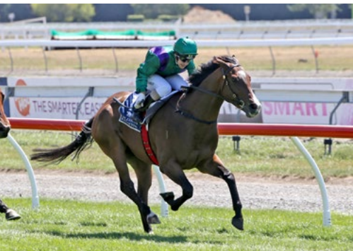
Don Carlo (NZ) (Per Incanto)