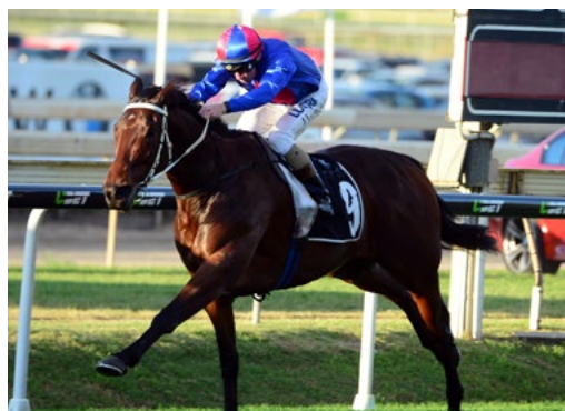
Chocante (NZ) (Shocking)