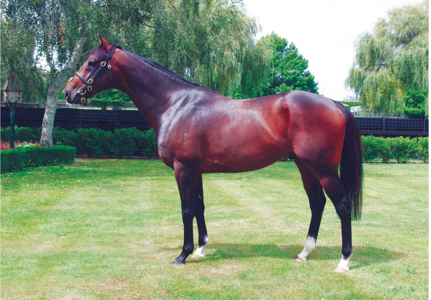
Cambridge Stud's Tavistock – sire of Tavistock Abbey

A pair of New Zealand bred three-year-olds turned heads at Bendigo on Thursday as they pressed their claims for higher honours as spring racing heats up across the Tasman.