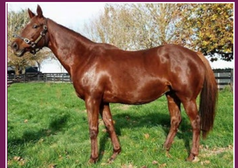
Unreserved mare in foal to ATLANTE.