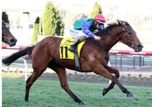
Bonneval (NZ) (Makfi)