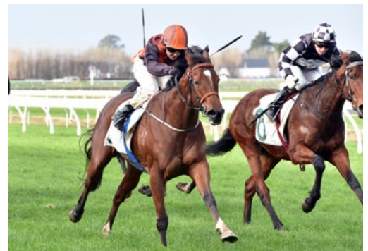
Justlikeyasister (NZ) (Gold Centre)

Volpe Veloce is the $6 third favourite on the TAB's fixed-odds market for the Windsor Park Plate behind joint $4.50 favourites Kawi (NZ) (Savabeel) and Gingernuts (NZ) (Iffraaj).