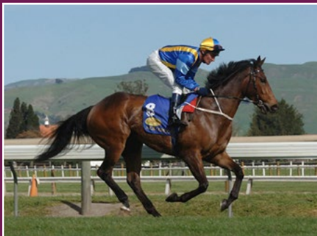
Gr.1 placed & Gr.3 winning mare.