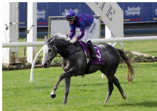
Megablast (NZ) (Shinko King)