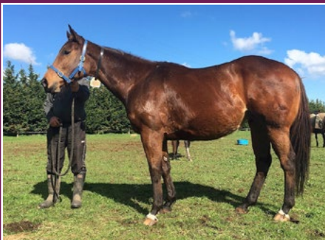
Young, well-bred mare i/f to IFFRAAJ.