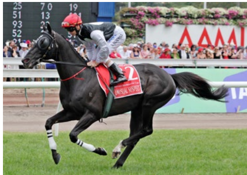
Unusual Suspect (Unusual Heat)