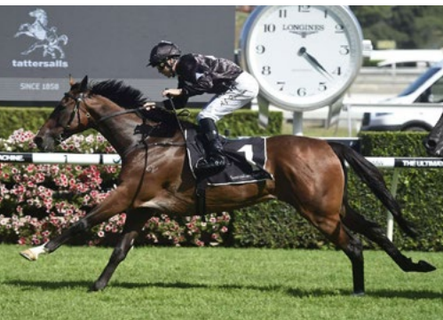
Ecuador (NZ) (High Chaparral)