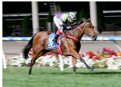
I Am A Star (NZ) (I Am Invincible)