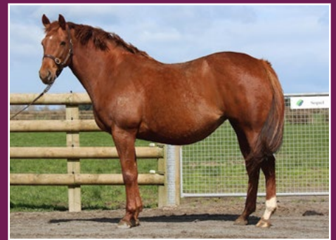
By THORN PARK, i/f to SACRED FALLS.