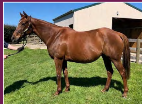
DAUGHTER OF AN OAKS WINNER IN FOAL TO VADAMOS.