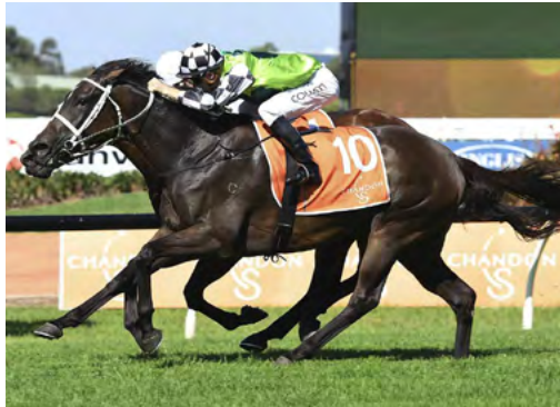
Unforgotten (Fastnet Rock)