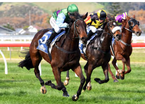
Ruomaza (NZ) (Azamour)

Keep Moving was sold by the Hawkins family's Wentwood Grange at the 2015 New Zealand Bloodstock Premier Yearling Sale and is by Darci Brahma out of their Group One winning mare Miss Raggedy Ann (NZ) (Faltaat).