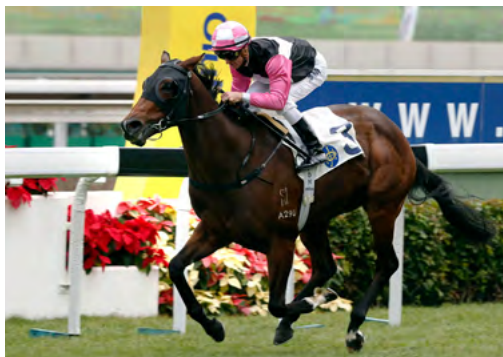
Win Beauty Win (NZ) (Makfi)