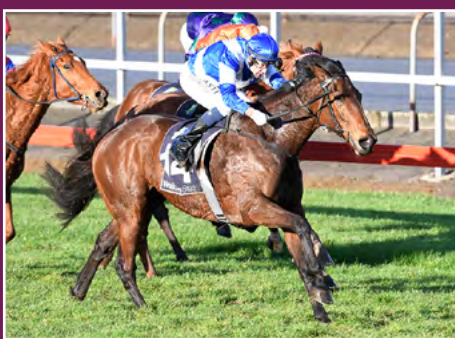
REDWOOD MARE. LAST START WINNER IN FULL WORK.