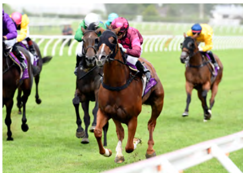
Major Tom (NZ) (Red Giant)