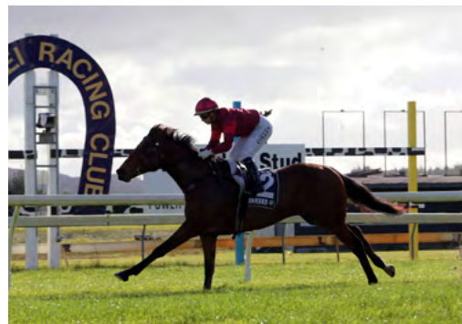
Kaharau (Ad Valorem)

Last year's Gr.3 New Zealand Cup (3200m) place-getter Kaharau (Ad Valorem) will bypass this year's two-mile feature in favour