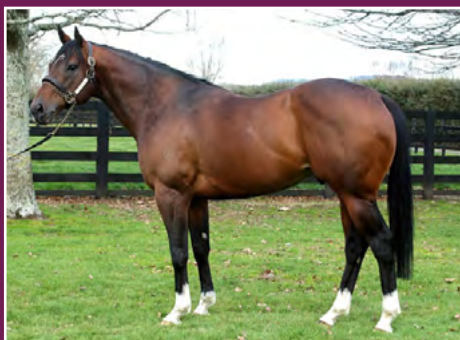
SHARE IN SHAMEXPRESS.

Youngsters, racing stock, broodmares, shares in Shamexpress, Super Easy and Swiss Ace plus a nomination to Time Test and Westbury Stud's Gr.1 Tarzino Trophy saddle cloth charity auction.