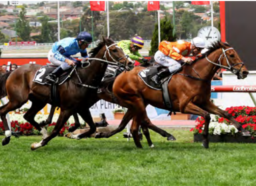
Who Shot Thebarman (NZ) (Yamanin Vital)