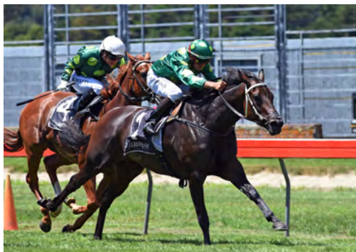
Gift Of Power (NZ) (Power)

Brutal was purchased by his trainers out of Mapperley Stud's 2017 New Zealand Bloodstock Premier Yearling Sale draft for $220,000.