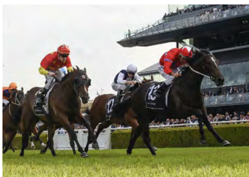
Seabrook (NZ) (Hinchinbrook)

Last season's Champion Two-Year-Old Avantage (Fastnet Rock) is likely to return to racing on Saturday week when she tackles the Gr.3 Hawke's Bay Breeders' Gold Trail