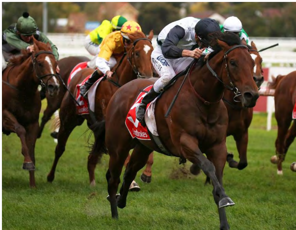
Promising three-year-old Ocean Knight looks a leading chance in tomorrow's Gr.2 Danehill Stakes (1200m) at Flemington

The Hawkes Racing-trained McKenzie Stakes winner Brutal (NZ) (O'Reilly) is not among Ocean Knight's Danehill rivals and instead headlines Saturday's Listed Antler Luggage Plate (1400m).