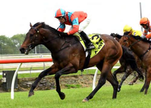
Demonetization (All Too Hard)