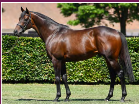
TIME TEST NOMINATION.