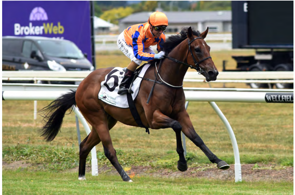
Juvenile Group One winner Sword Of Osman kicks off his three-year-old campaign at Ruakaka tomorrow