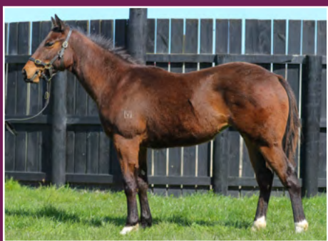
QUALITY YEARLING FILLY BY EXOSPHERE.