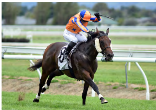
Avantage (Fastnet Rock)

"I'm hopeful that we can get another good horse by him. I've got a couple of very nice mares that he will cover this season and hopefully he will get a few outsiders as well." Rios stands at Upstage Bloodstock this season for a service fee of $2,500+GST.