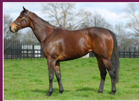
WELL-RELATED DARCI BRAHMA MARE. RACE OR BREED.