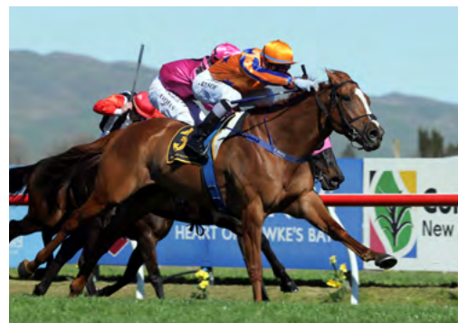
Te Akau Shark (NZ) (Rip Van Winkle)

"She goes well at Rosehill and settles in well at Rosehill, we'll take her up there next week some time and run her there second-up. It's a million dollar 1400m race and then we get three weeks to the Thousand Guineas down here (Melbourne)."