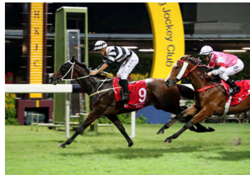
Circuit Glory (NZ) (Tavistock)

He was then freshened for his spring resumption at Ruakaka in the Bear Morgan @ Harcourts Bream Bay (2100m) earlier this month where he finished runner-up from his outside barrier. Full story here