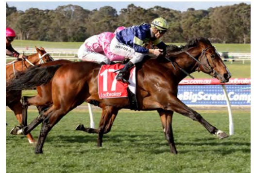
Declarationofheart (Declaration Of War)