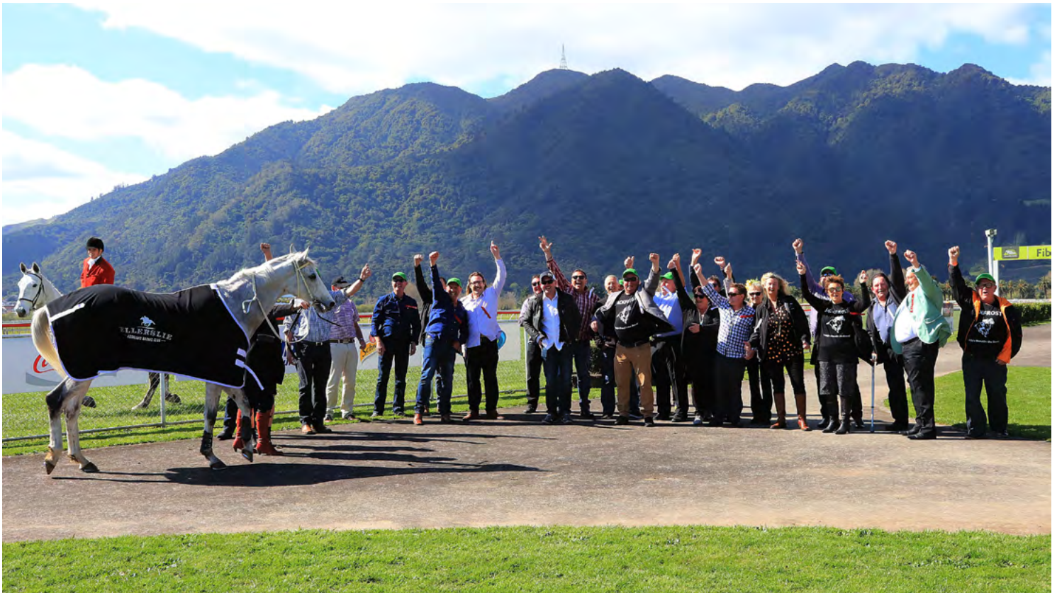
Jackfrost parades before his adoring owners at Te Aroha