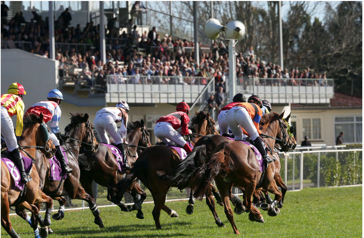
The field pass the packed grandstand on the first lap of the Irvines Great Northern Steeplechase