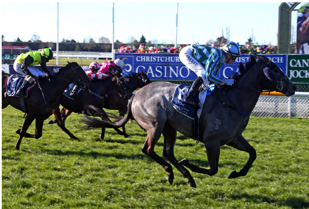
Stylish grey filly Emily Margaret breaks her maiden status at Riccarton