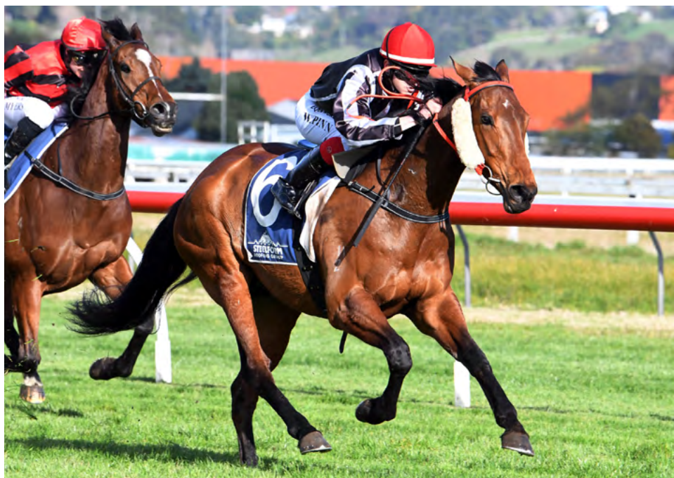
Strolling Vagabond records her eighth career victory with a comprehensive win at Wanganui