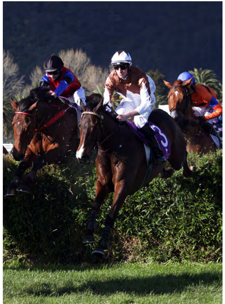
Chocolate Fish clears a fence on his way to victory

"I was happy that I was following Thenamesbond the whole way although I did get a little bit of panic when they swept around me at the 600m and didn't give me a lot of room.