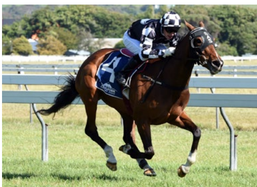
Madonna Mia (NZ) (Red Clubs)