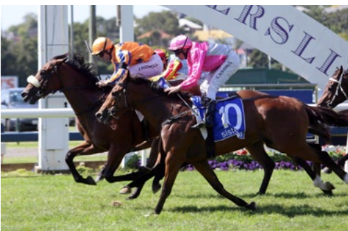
Heroic Valour (Fastnet Rock)