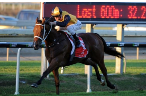
Mackintosh (NZ) (Pins)

She has won two of her three starts to date including the Gr.2 Blue Diamond Fillies Prelude (1100m), before finishing a disappointing fourteenth in the Gr.1 Blue Diamond Stakes (1200m).