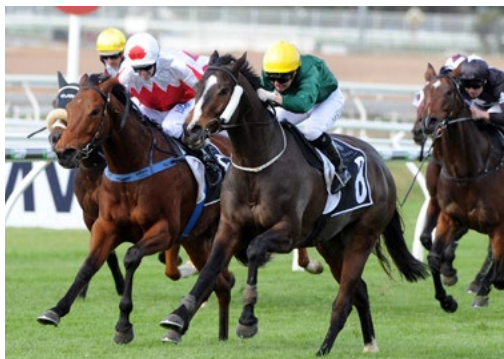
Benzini (Tale Of The Cat)