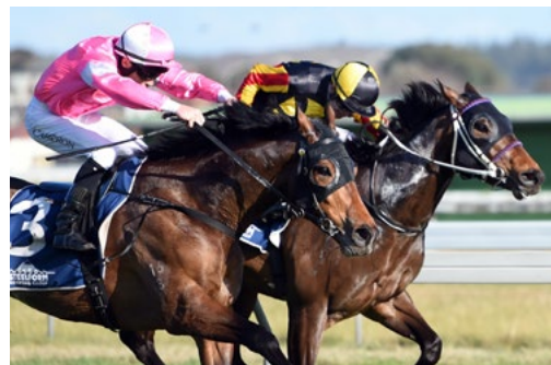
Highlad (High Chaparral)

million, the one He's Remarkable won and then lost in an inquiry, over a mile and two weeks later there's a weight-for-age race over 1800 metres worth another $A1 million." Full story here.