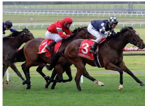
Awake In Grinzing (NZ) (Rip Van Winkle)

The stakes winner of nine races will be out to make the most of a chance at further black type when she runs in Saturday's Gr.3 Merial Ancare Metric Mile at Awapuni. Full story here.