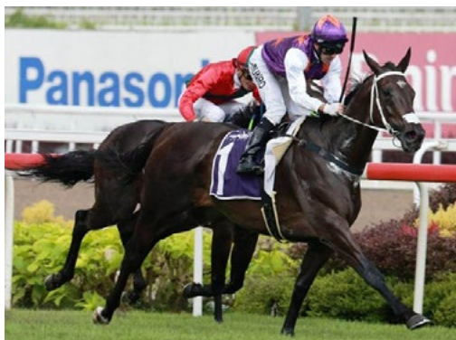
War Affair (NZ) (O'Reilly)

After a chequered run of aborted comebacks due to fitness and health issues – the latest episodes being Spalato