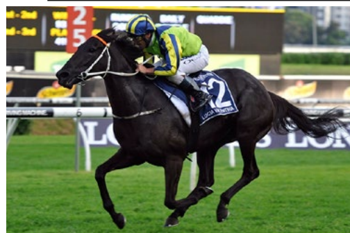
Lucia Valentina (NZ) (Savabeel)

"Being a son of High Chaparral, we'd hope that we can aim him at races like the Gloaming Stakes and Spring Champion Stakes in Sydney or the Victoria Derby at Flemington."