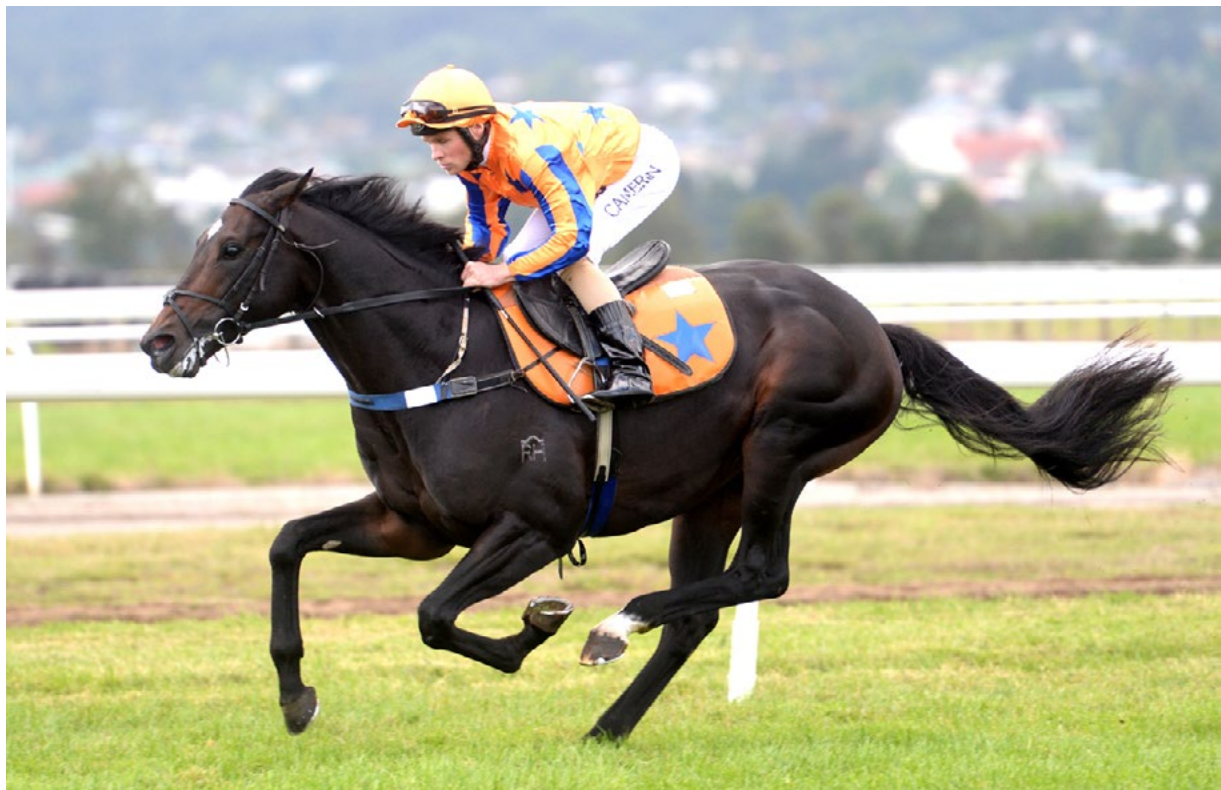
Last season's champion three-year-old Xtravagant will commence his new campaign at Flemington on Saturday

towards the Gr.1 Sir Rupert Clarke Stakes (1400m) at Caulfield on September 24 before tackling the Gr.1 Toorak Handicap (1600m) at the same