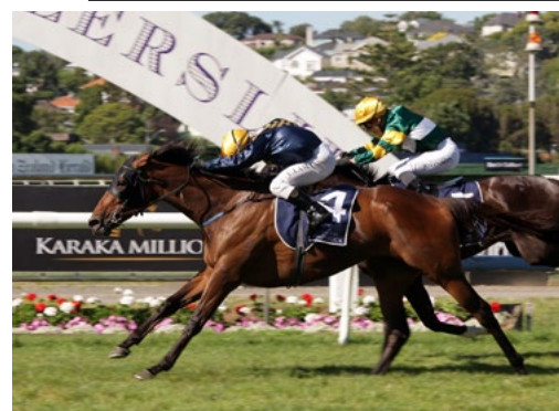
Rose Of Virginia (NZ) (Thorn Park)