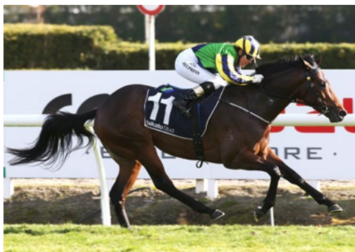
Saracino (NZ) (Per Incanto)

Birchley also has O'Reilly Cyrus (NZ) (O'Reilly), who has shown strong form in Brisbane when placing in her last two starts, in the race. The $100,000 Waikato Stud graduate has drawn the outside gate and will have Jason Collett riding.