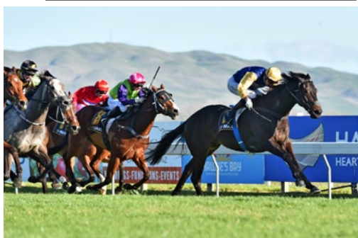
Kawi (NZ) (Savabeel)

"But look, it's been a year since we've been talking about that and a lot of water has gone under the bridge since. I'm more concerned about how Spalato will run first-up."