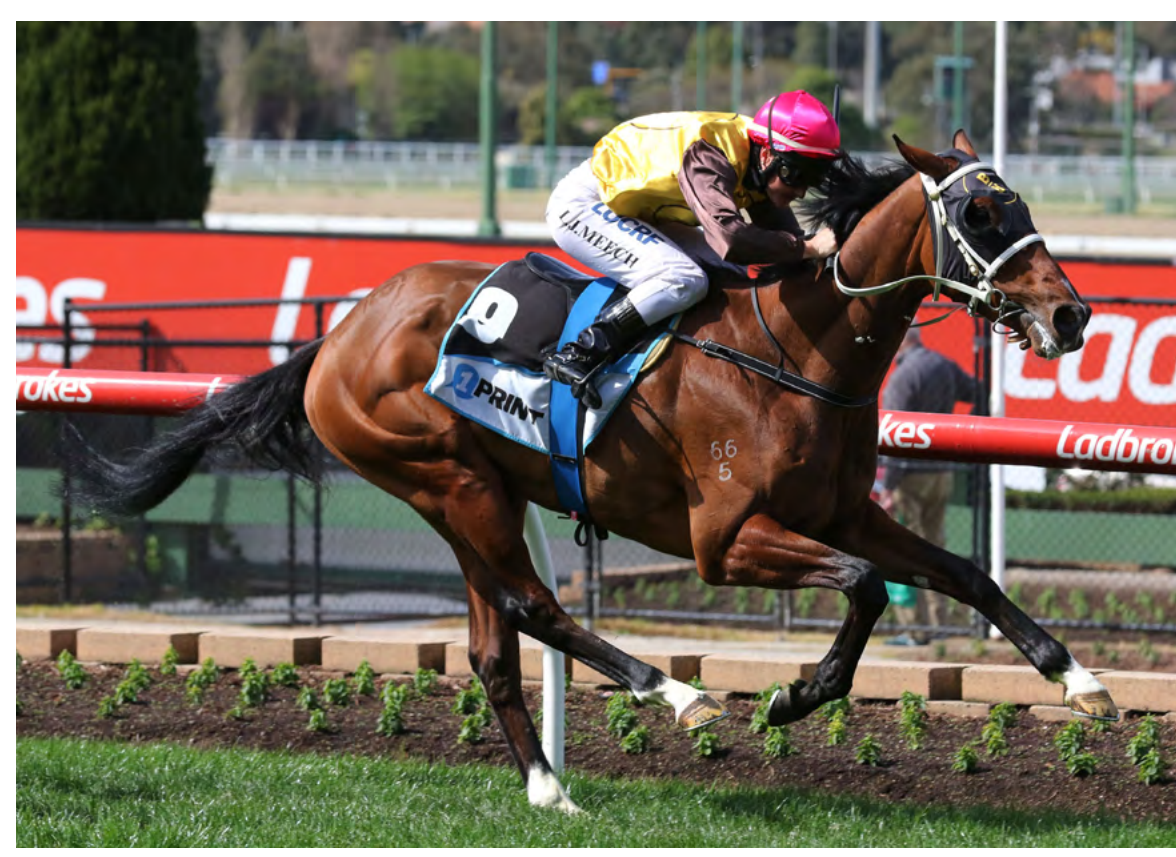
Tavirun pressed his claims for a start in the upcoming 3yo Classic features with a win at Moonee Valley