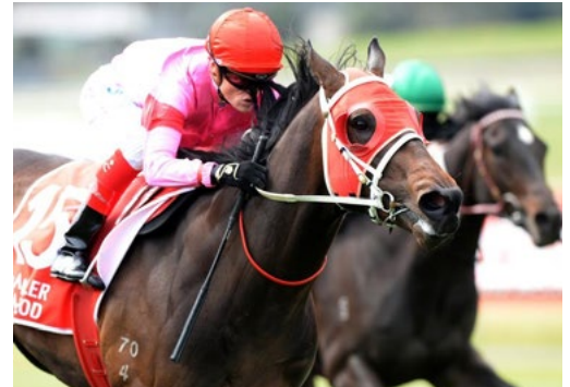
Wassergeist (Fastnet Rock)

"Now that he's got that win on the board