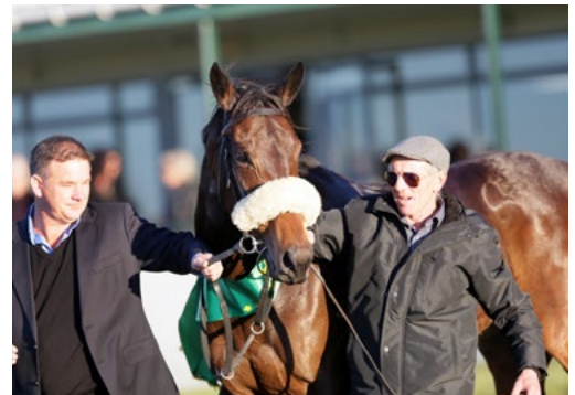
Let Her Rip (NZ) (Rip Van Winkle)

Melbourne Cup hopeful Chocante (NZ) (Shocking) has impressed his connections with his third placing to glamour mare Winx (Street Cry) and bold front-runner Red Excitement (Excites) in the Gr.2 Chelmsford Stakes (1600m) at Randwick on Saturday.