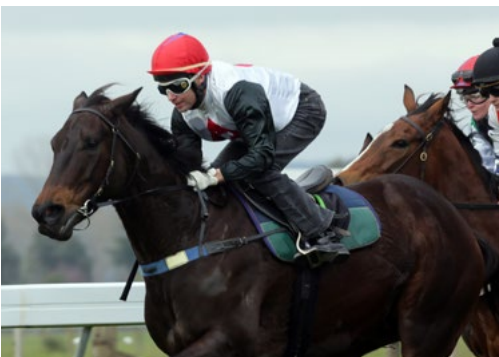
Perfect Fit (NZ) (Elusive City)