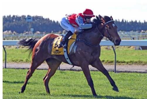
Blanco Belle (NZ) (Cape Blanco)

Blanco Belle (NZ) (Cape Blanco) will face