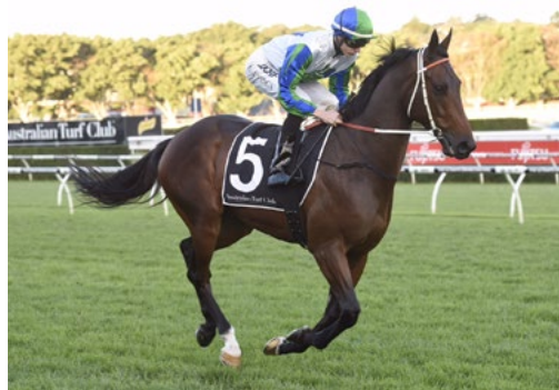
Bullrush (NZ) (O'Reilly)