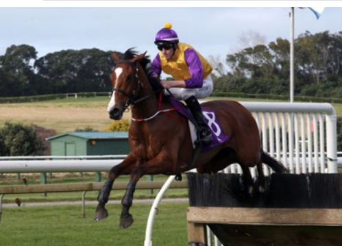
Monarch Chimes (NZ) (Shinko King)