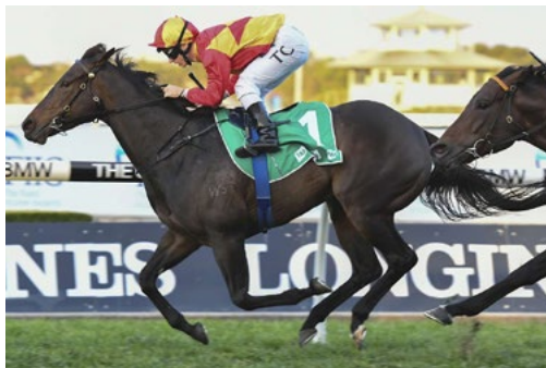
Bonny O'Reilly (NZ) (O'Reilly)