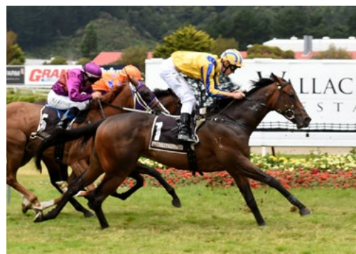
Vincent (NZ) (Burgundy)