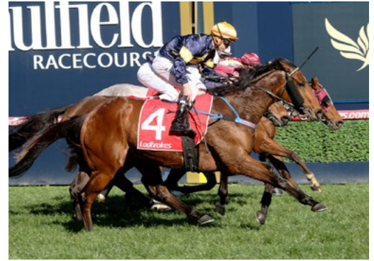
Rhythm To Spare (NZ) (Pins)