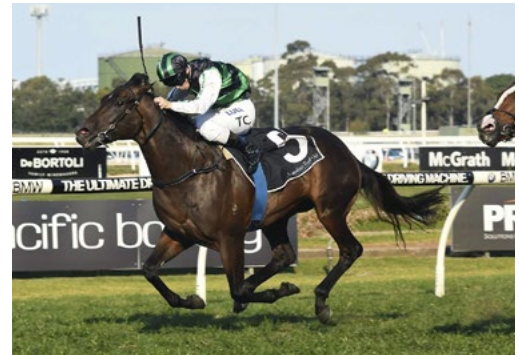
Addictive Nature (NZ) (Savabeel)