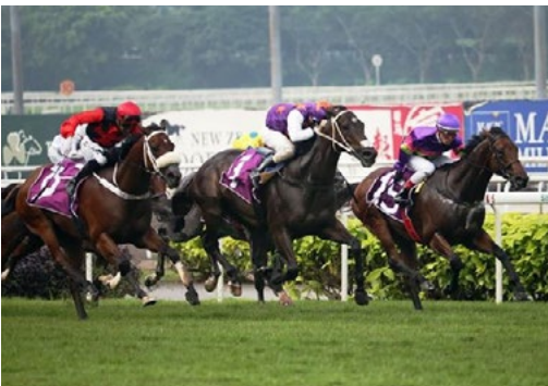
War Affair (NZ) (O'Reilly)