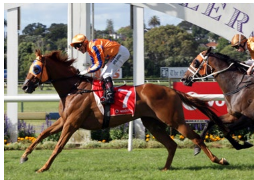
Gingernuts (NZ) (Iffraaj)

In her first appearance for five months, Sofia Rosa struck trouble in the running before she got home well for seventh in the Gr.1 Tazirino Trophy and less than four lengths off the winner Close Up (NZ) (Shinko King). Full story here