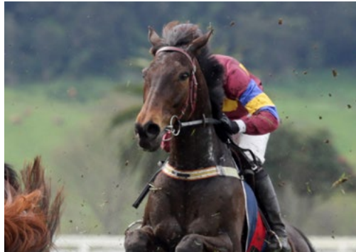
Stormin Norman (NZ) (Istidaad)