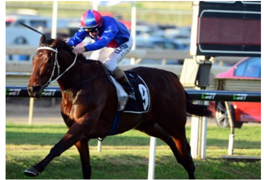
Chocante (NZ) (Shocking)