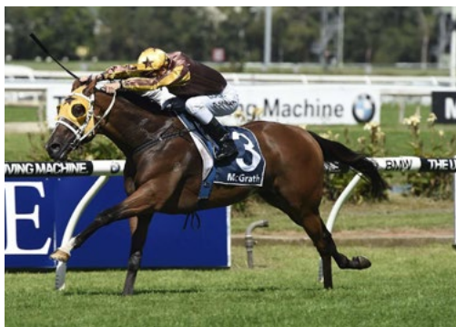
Tavago (NZ) (Tavistock)

The stakes-winning mare will carry 55kg but will have to overcome a wide barrier draw (12) to continue her winning streak.