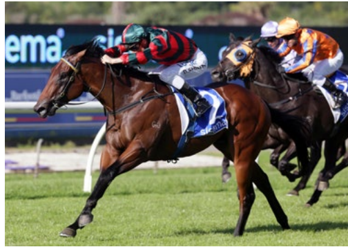
Summer Passage (Snitzel)

"My father and grandfather were jumps jockeys and I just followed them into it. I've won a few big races around the world, but the one I remember most and get the most satisfaction from is the Great Northern Steeple as an 18-year-old," he said. Full story here