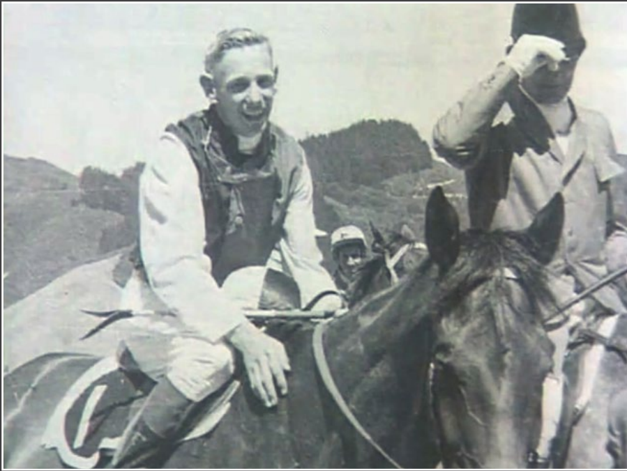
CLICK TO PLAY