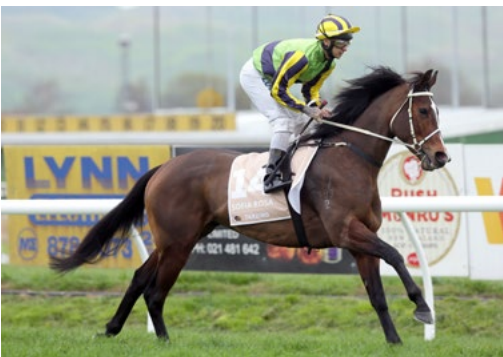
Sofia Rosa (NZ) (Makfi)