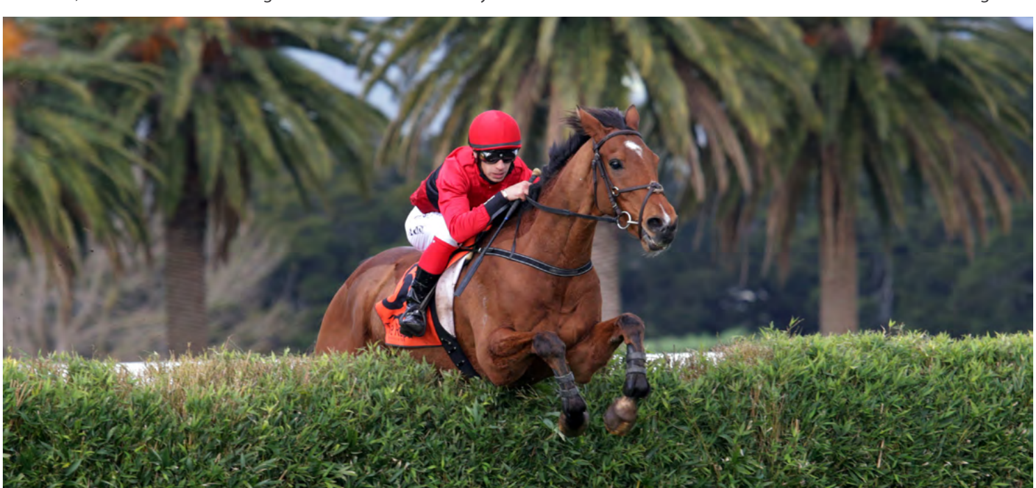
Perry Mason will start one of the favourites in Sunday's Irvines Great Northern Steeplechase at Te Aroha