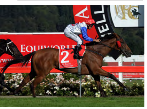
Savvy Coup (NZ) (Savabeel)

"We'll probably head to the Red Badge 1400m with him on Livamol Classic day. We'll see how things go before then, whether we have a jump out in-between I am not sure."