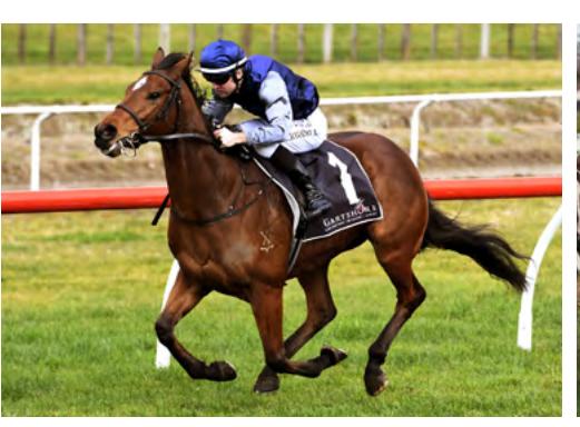
English Gambler (Casino Prince)

English Gambler dropped back in distance for his last-start runner-up performance in the $101,000 Platinum Homes Taranaki Challenge (1400m) at New Plymouth and Brennan thinks he will appreciate the step back up to a mile. Full story here