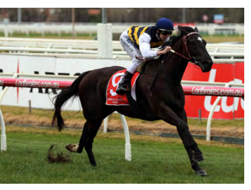
Night's Watch (NZ) (Redwood)