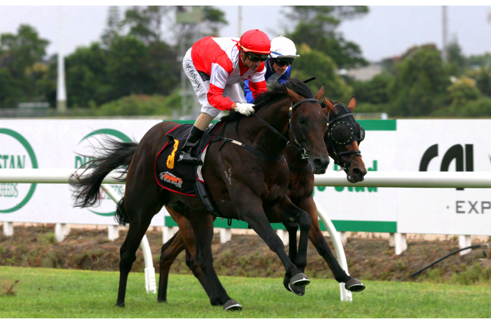
Multiple Group One winner Mongolian Khan is a graduate of the popular New Zealand Bloodstock Ready To Run Sale of Two-Year-Olds that will be held at Karaka in November again this year.

ew Zealand Bloodstock's Ready to Run Sale of Two-Year-Olds has cemented itself as the leading sale of its kind in Australasia with an incomparable 17 Group One wins and 117 stakes wins claimed by graduates of the Sale in the last five seasons.