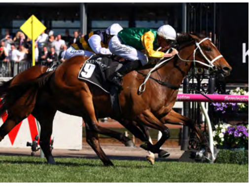
Shillelagh (NZ) (Savabeel)

Night's Watch will have to overcome a quality field, which includes dual New Zealand Horse of the Year Bonneval (NZ) (Makfi) who won last year's running of the race.