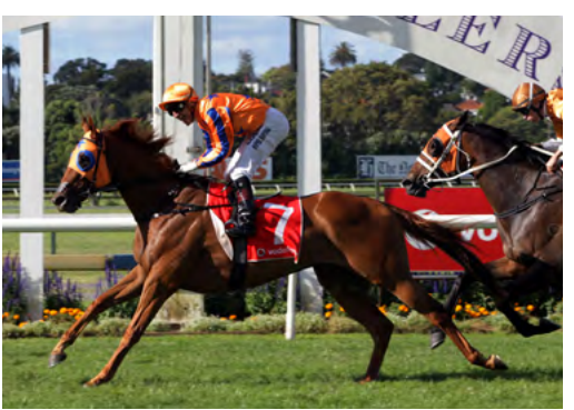
Gingernuts (NZ) (Iffraaj)

"We just have to think about what we are going to do, but we're definitely staying up there between runs. I really think the 2040m race is her race and I've said that all the way through, and if she wins that we're going to the Cox Plate."