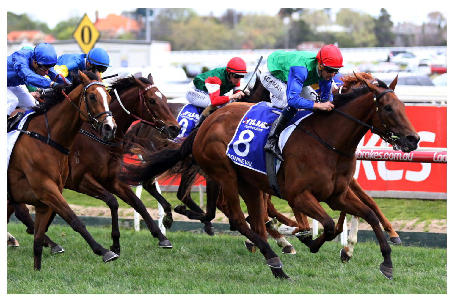
Dual New Zealand Horse of the Year Bonneval is ready to kick her spring campaign off at Moonee Valley this weekend

ual New Zealand Horse of the Year Bonneval (NZ) (Makfi) has arrived safely in Melbourne and is set to kick-off her spring campaign in the Gr.2 Dato Tan Chin Nam Stakes (1600m) at Moonee Valley on Saturday.