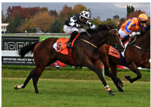
Mihaul (NZ) (Iffraaj)

(Perfectly Ready) from Hong Kong, with the now eight-year-old set to retire to Bambry's property. Full story here