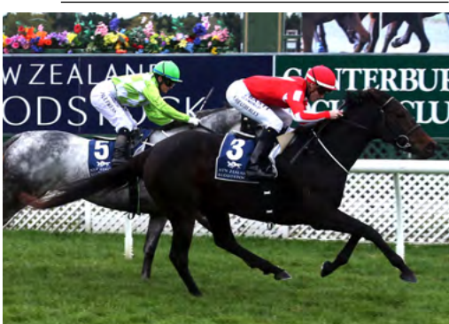
Elfee (NZ) (Iffraai)

"If he happens to win this then he is in the Caulfield Cup and we can just poke along with him."