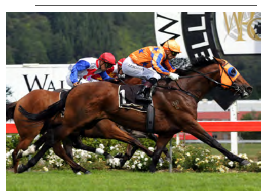
Age Of Fire (Fastnet Rock)

He will now travel across the Tasman to join stablemates Bonneval (NZ) (Makfi) and Rubira (Lope de Vega) as he prepares for his Melbourne spring carnival assignments, which will likely kick-off in the Gr.1 Maykbe Diva Stakes (1600m) on September 15. Full story here