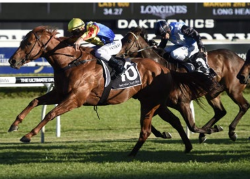
Spieth (NZ) (Thorn Park)

Legless Veuve has scored at her last two first-up runs with her fresh record including a win over Hey Doc (Duporth) in the Gr.3 Manfred Stakes (1200m) at Caulfield in February. Full story here