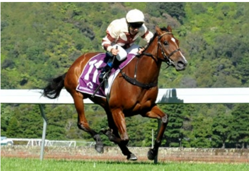
Aide Memoire (NZ) (Remind)

her runner-up finish earlier this month when resuming under 63.5kg in a Rating 85 contest over 1000m at Tauherenikau. Full story here