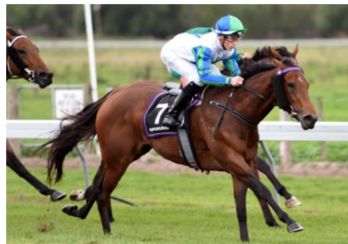
Flamingo (NZ) (Pins)

Flamingo (NZ) (Pins) will be kept to her own grade in the immediate future before sterner tests are put to the talented daughter of Pins.