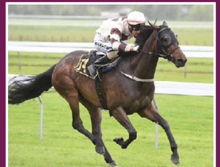
WINNING MARE BY THORN PARK. RACE OR BREED.

Featuring 41 Lots including 11 yearlings, six two-year-olds, one unraced horse, five raced horses, 16 broodmares, and one charity auction nomination. A foal at foot by Rock 'N' Pop, and covering sires Burgundy, Jakkalberry, and Shamexpress.