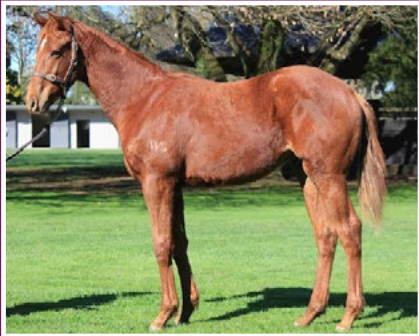
PER INCANTO COLT. HALF TO SEIZE THE MOMENT.