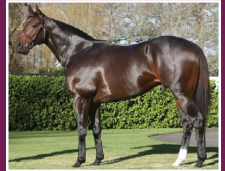
CHARITY AUCTION - NOMINATION TO BURGUNDY.