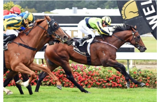
Saracino (NZ) (Per Incanto)

first-up. Gai thinks that the filly will stretch out in trip later on, but this is a nice starting point for her."