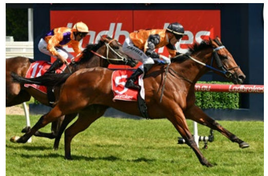
Legless Veuve (NZ)