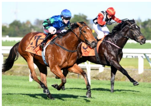
Bella Gioia (NZ) (Swiss Ace)

Swissta was spelled after two further unplaced outings and he will resume at Ruakaka tomorrow in the Polwarth Design 1200. Full story here