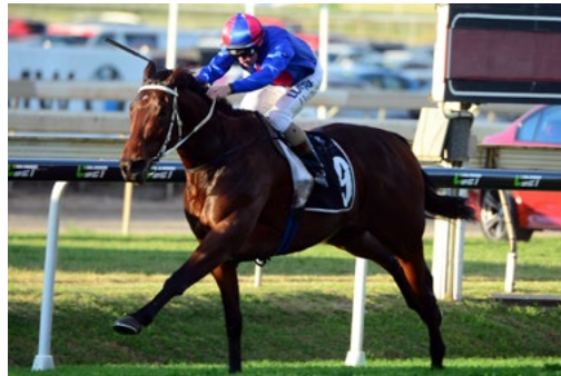
Chocante (NZ) (Shocking)