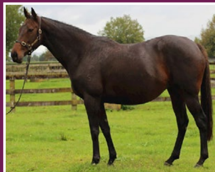
IN FOAL TO SHAMEXPRESS.