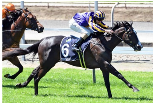
Joyfully Ours (NZ) (Highly Recommended)