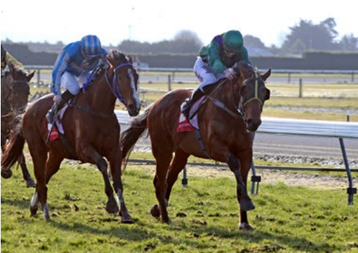
Astroturf (Encosta De Lago)