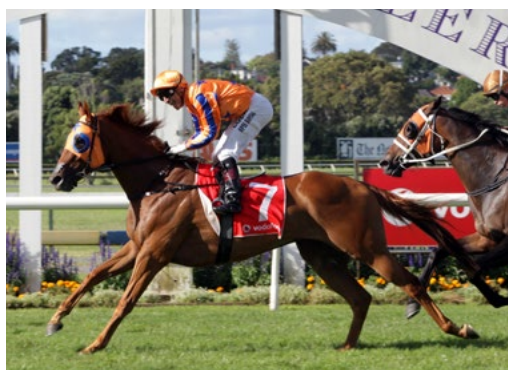
Gingernuts (NZ) (Iffraaj)