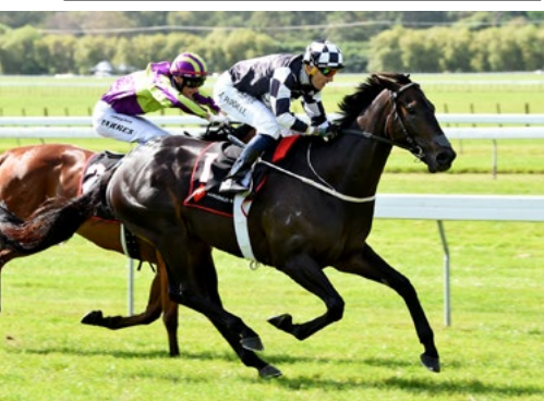
Kawi (NZ) (Savabeel)

Volpe Veloce has won eight of her nine career starts and commenced her four-year-old season in impressive fashion with a dominant victory at Te Rapa.