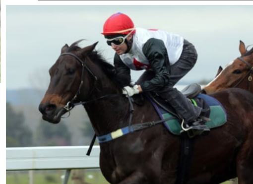
Perfect Fit (NZ) (Elusive City)

"He will go back to run in the mile and then, all going well, he could go to Melbourne but that will be decided after the Windsor Park." Full story here