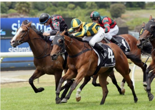
Swissta (NZ) (Swiss Ace)