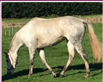
STAKES PLACED MARE READY TO SERVE EARLY.