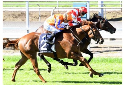
Griffin (NZ) (Iffraaj)