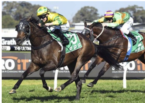
Dee I Cee (NZ) (Istidaad)

However, he had placed on a number of occasions including a narrow second in the