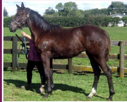
WELL-RELATED FILLY BY SHOWCASING.