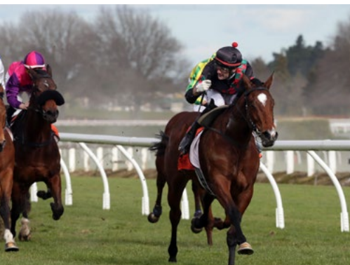
Volpe Veloce (Foxwedge)