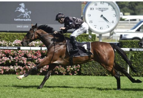
Ecuador (NZ) (High Chaparral)

her runner-up finish earlier this month when resuming under 63.5kg in a Rating 85 contest over 1000m at Tauherenikau. Full story here