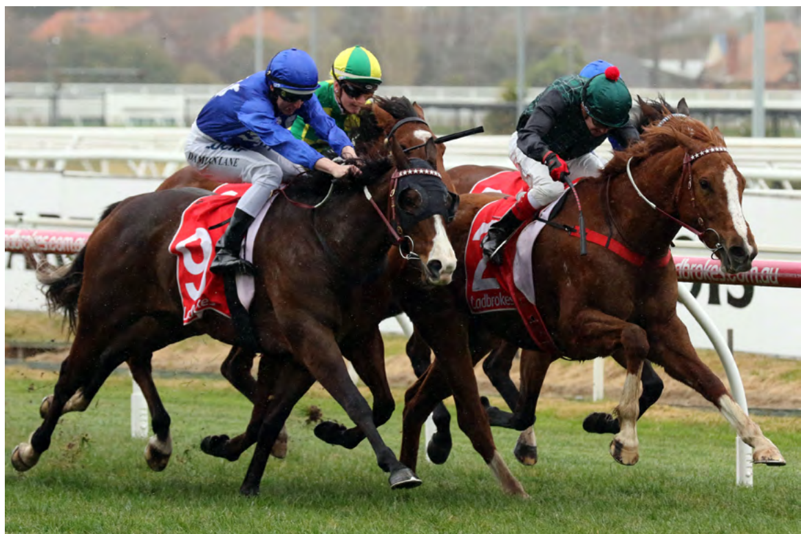
Stablemates Mrs Gardenia (inner) and Bellaria couldn't be split