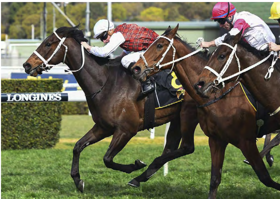
Night's Watch shows his love of Caulfield with a dominant win