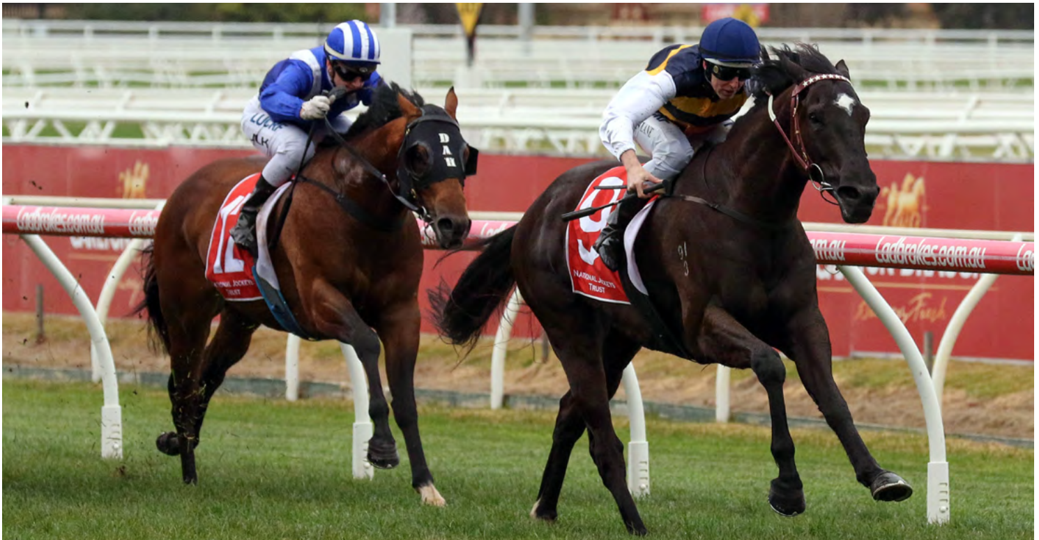
Night's Watch shows his love of Caulfield with a dominant win