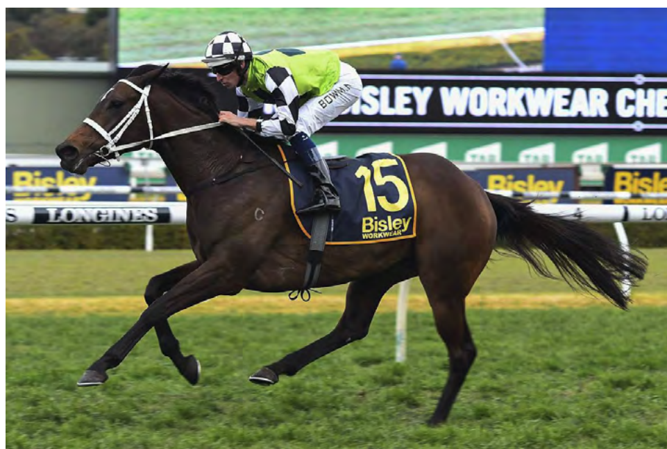
Unforgotten swooped from back in the field