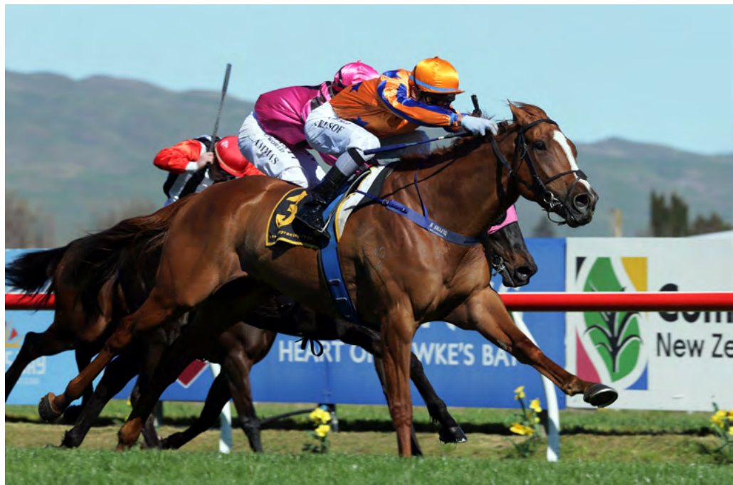
Te Akau Shark powers home at Hastings