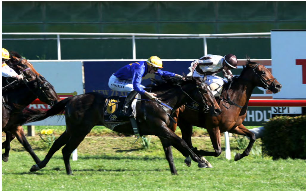
Cyber Attack (inner) holds out Cavallo Veloce to score at Hastings

"I will see how he pulls up as he has had a few runs in this