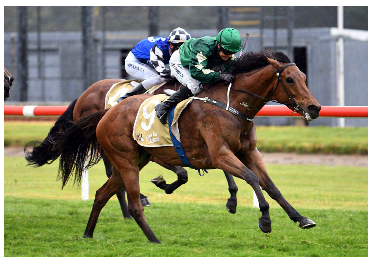
Dark Princess scoots clear to register her first stakes success

rogressive mare Dark Princess (NZ) (Cape Blanco) continued her rise up the ranks with her first victory at stakes level when successful in Saturday's Gr.3 Gee & Hickton Thompson Handicap (1600m) at Trentham.