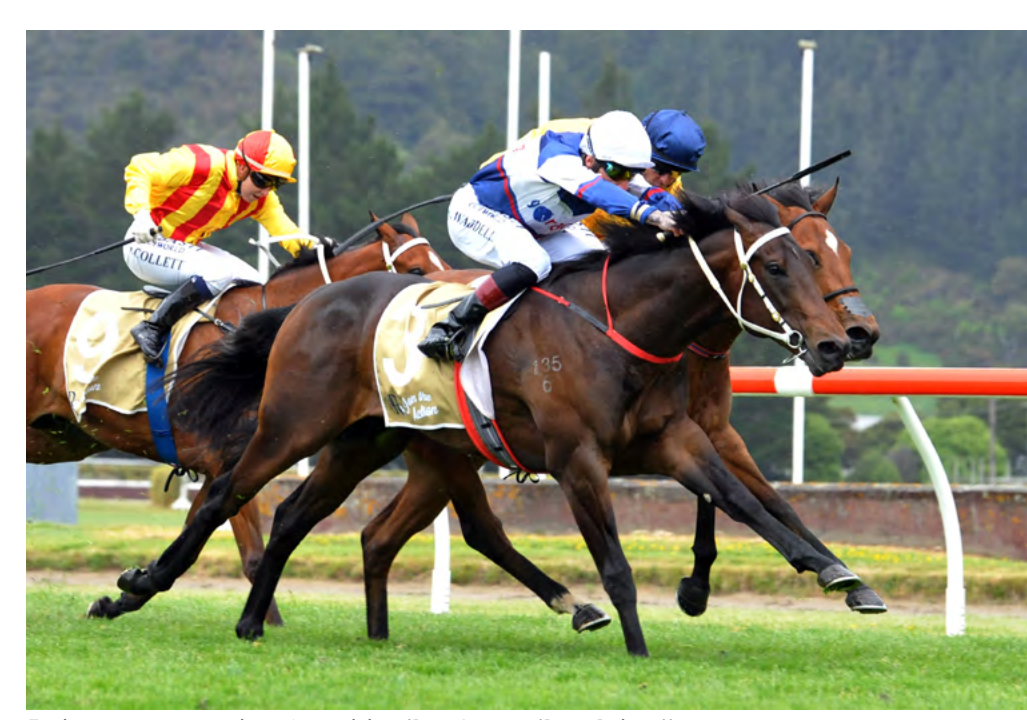
Exuberant scores a stakes win on debut