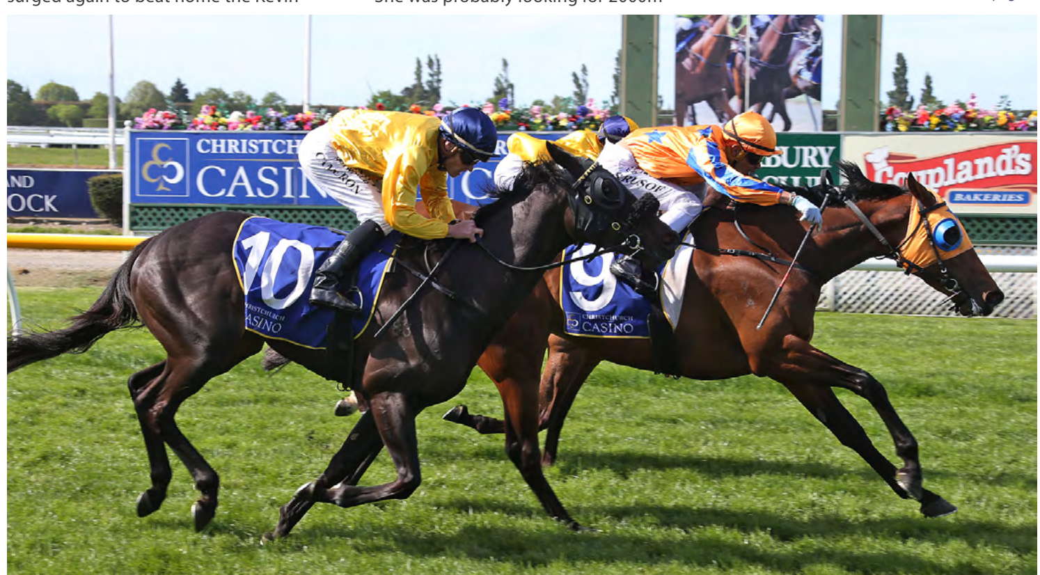
Swing Note lands victory in a desperate finish at Riccarton