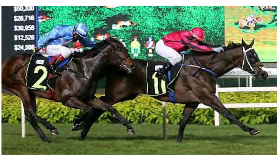
Black Quail holds off Loving You to claim Race 8 on Friday

With that second win in 13 starts, along with his six