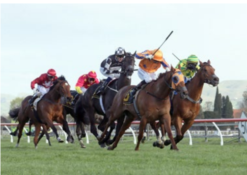
Gingernuts (NZ) (Iffraaj)