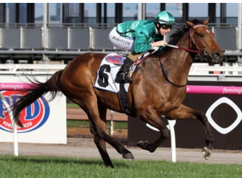
Humidor (NZ) (Teofilo)