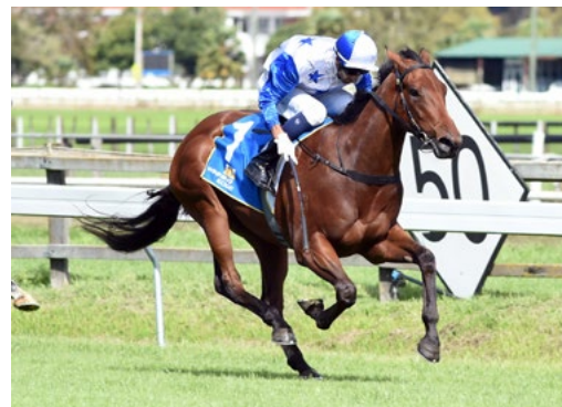
Bostonian (NZ) (Jimmy Choux)

Spain, who rides down to 50kg, will also be aboard Pepper Mill (NZ) (Patapan) in the open 1400m sprint.