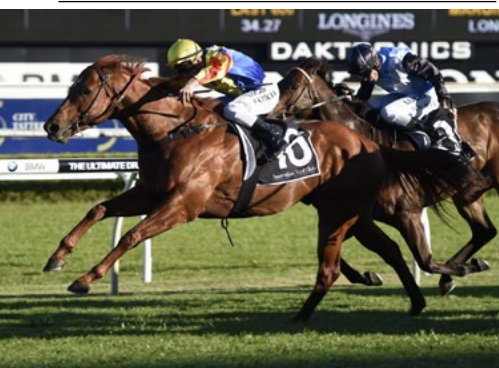
Spieth (NZ) (Thorn Park)