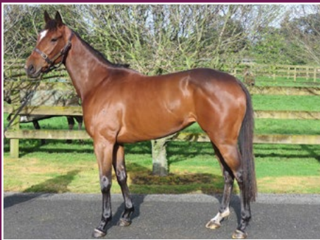
UNRESERVED, WELL-BRED FILLY BY SMART MISSILE TO RACE OR BREED.