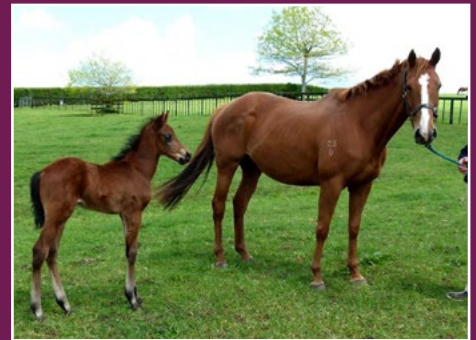
THORN PARK MARE WITH QUALITY NADEEM COLT AT FOOT.