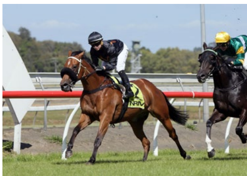
Consensus (NZ) (Postponed)