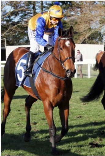
Bobo So Good (Zoffany)