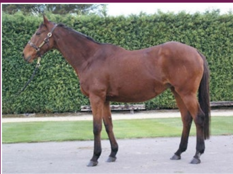
DUAL STAKES WINNER DUE TO FOAL TO GR.1 SIRE PENTIRE.