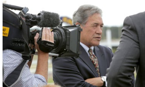
Minister For Racing - Winston Peters

"We'll then give her one more run before the Zabeel," McKee said.