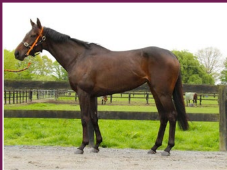
WINNING SAVABEEL MARE TO RACE OR BREED FROM.