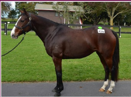
DAUGHTER OF A GR.1 WINNER PLUS QUALITY SHOCKING FILLY AT FOOT.

Featuring 19 Lots including yearlings, racing stock and broodmares.