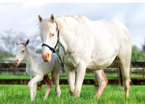
Mongolian Khan ex The Opera House filly

"He went a super race and we were really happy with him. It was a month between runs and the other horse (Wait A Sec) got an unbelievable run, but we had no excuses."