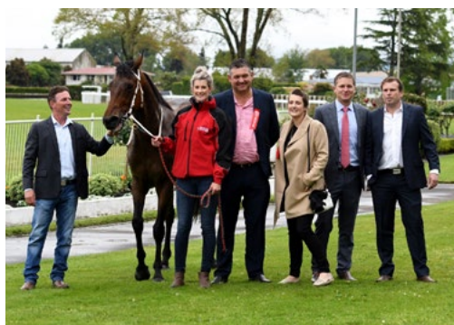
Sumstreetsumwhere (NZ) (Highly Recommended)