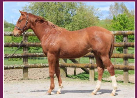
UNRESERVED & WELL-BRED PINS YEARLING COLT, X-RAYS AVAILABLE.