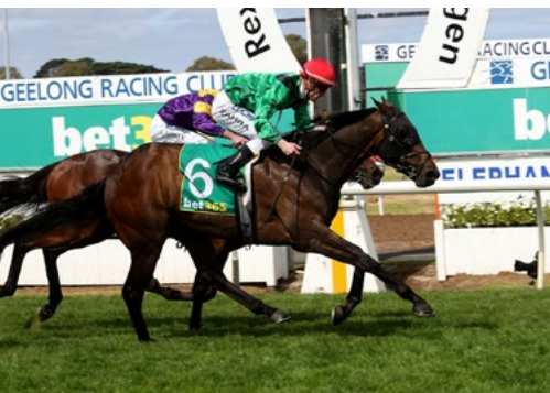
Weather With You (Teofilo)

Cambridge 3YO returns classic Derby trial Weather With You (Teofilo) pressed his Gr.1 VRC Derby (2500m) claims with victory in his fourth Australian appearance.