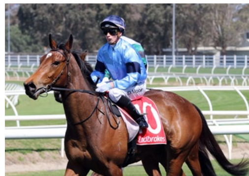
Pageantry (I Am Invincible)

Pageantry (I Am Invincible) remained in the field for the gavelhouse.com New Zealand Bloodstock-sponsored feature on November 18 after second withdrawals on Wednesday.