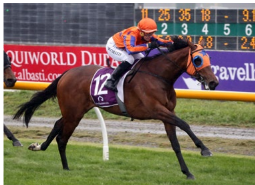
Swing Note (Encosta De Lago)

Spieth, who was placed in last year's Gr.1 Darley Classic (1200m) at Flemington has drawn barrier five in a field of 11.