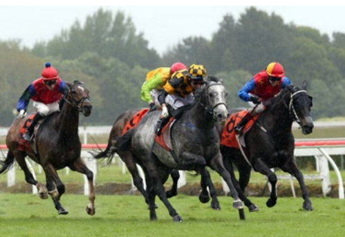
Von Tunzelman (NZ) (Zabeel)

"He came over pretty backward, he had a long, hairy coat. He's come good the last few weeks."