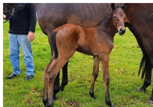
Tavistock ex Zazzino filly