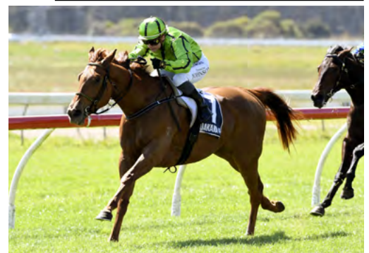
Magic Condor (Magic Albert)

"The Oaks will fall away a little bit and she'll tell us in a week how she is feeling heading into it. I can't fault her, she's probably just a touch weak at this stage."