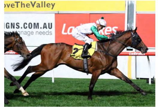
Jon Snow (NZ) (Iffraaj)