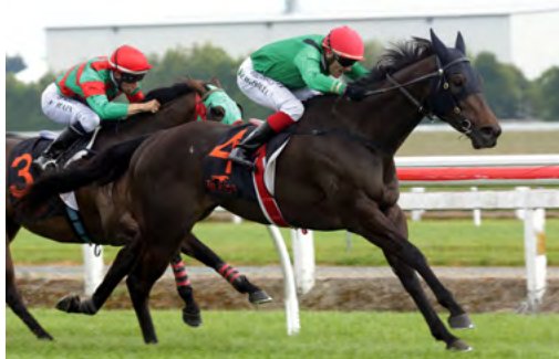
Rhinestone Cowboy (Teoflo)

Bosson, Sword Of Osman dictated the speed throughout before repelling a strong challenge in the run home by Qiji Express (NZ) (Shamexpress), who failed by just a nose to topple the winner. Race favourite Madison County (NZ) (Pins), the stablemate of the runner-up, made ground late to finish third without threatening the first two home. Full story here