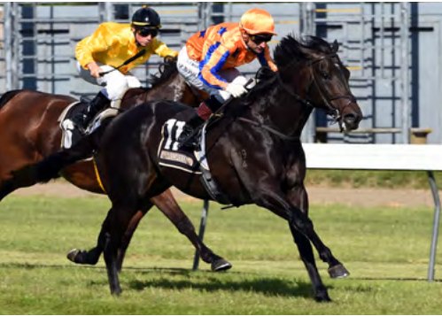
Embellish (NZ) (Savabeel)