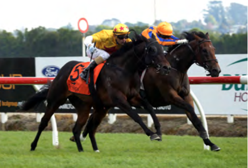
Sword Of Osman (NZ) (Savabeel)