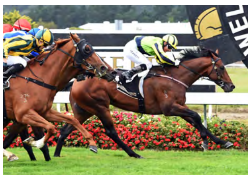
Saracino (NZ) (Per Incanto)

"It would be nice to have the race another couple of months away, but it's only education, I'm not worried about fitness and I am pretty sure he is up to them."