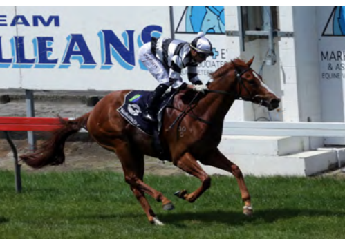
Dawn Patrol (NZ) (Dawn Approach)