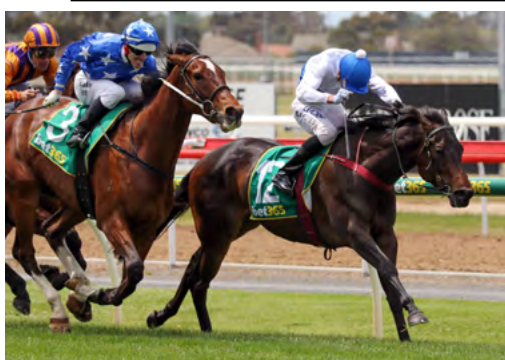
Our Sea Goddess (NZ) (Darci Brahma)

Set to resume on the last day of the Hawkes Bay spring carnival, Rhinestone Cowboy put on a display of buck-jumping and the like that saw him scratched at the barrier. Full story here