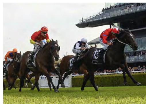
Seabrook (NZ) (Hinchinbrook)