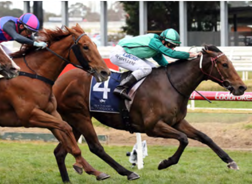
Humidor (NZ) (Teofilo)