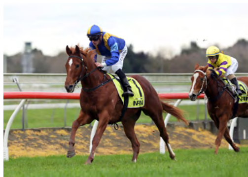
Botti (NZ) (Jakkalberry)

"She has run fifth in an Everest last year, so if she's at her best she can definitely mix it with them. She's got an awkward barrier in ten but if they go quick she might get into a good position."