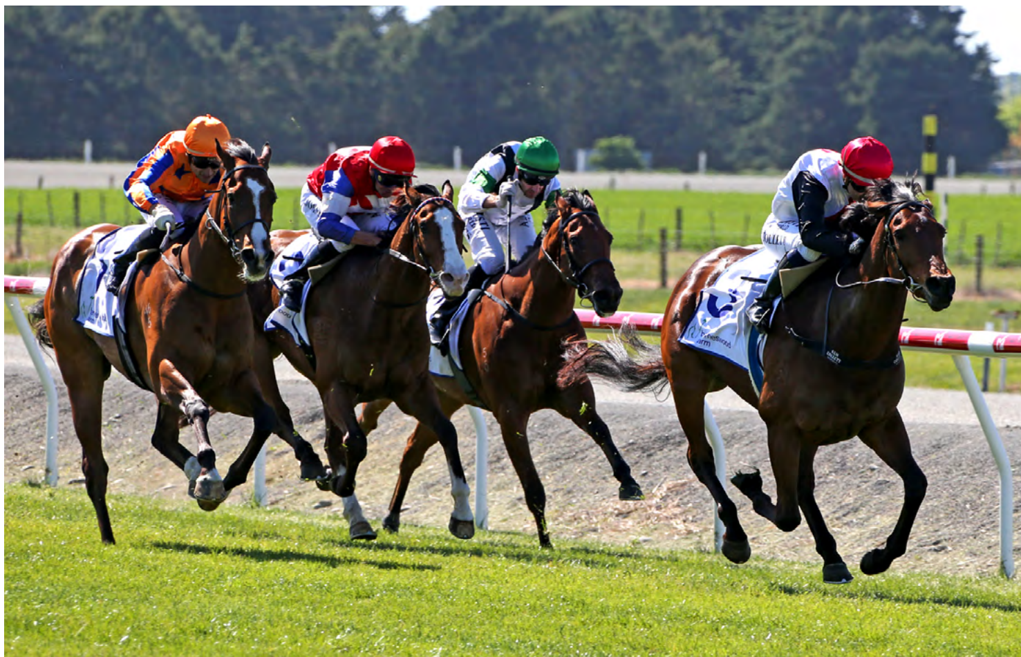
Xpression is well clear of her rivals as she scores at Ashburton