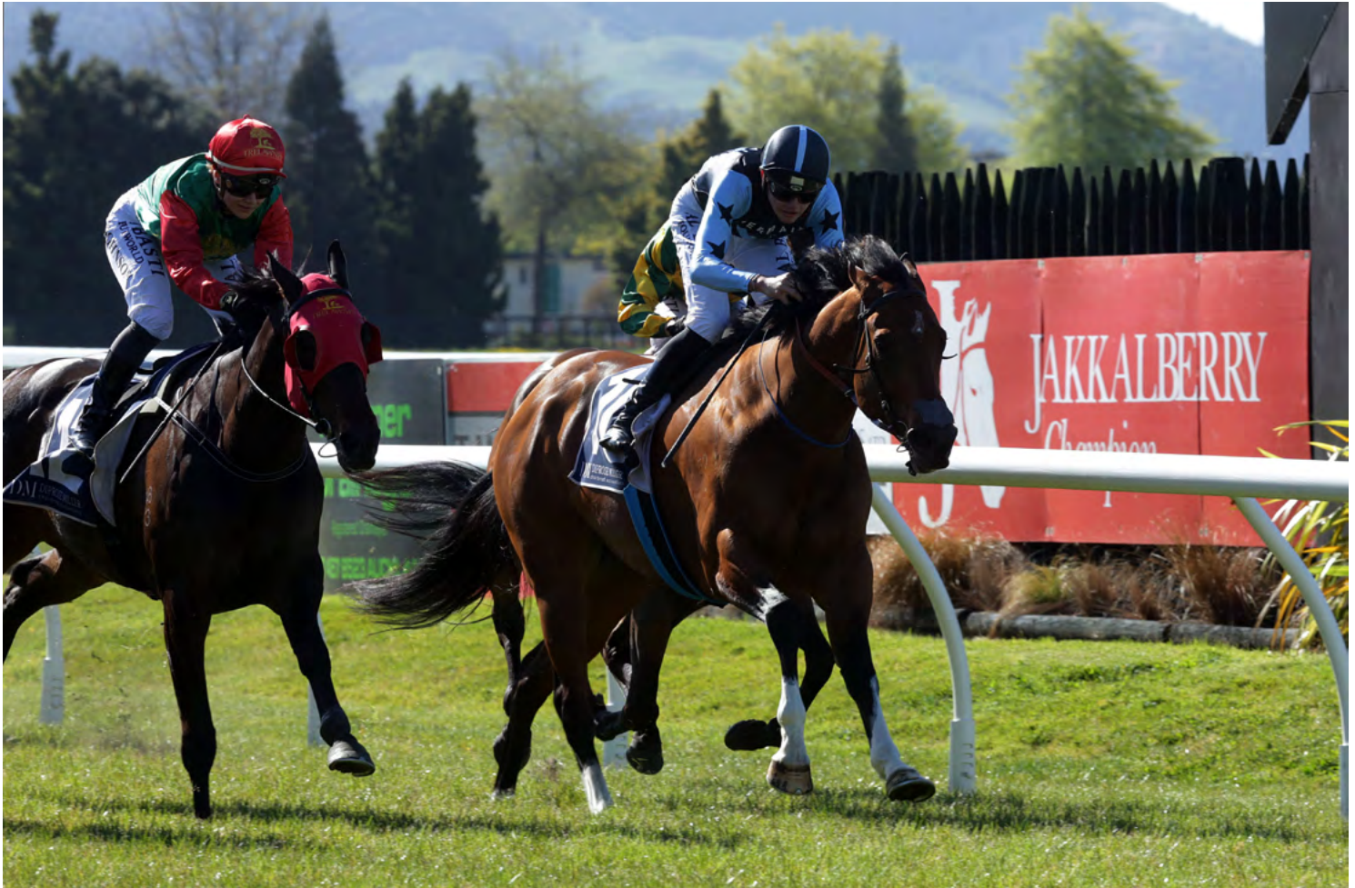
Volks Lightning defeats Indecision (red hood) at Rotorua

A desperate finish to the Gr.3 Sweynesse Stakes (1215m) at Rotorua was decided by the photo-finish camera in favour of underrated mare Volks Lightning (NZ) (Volksraad).