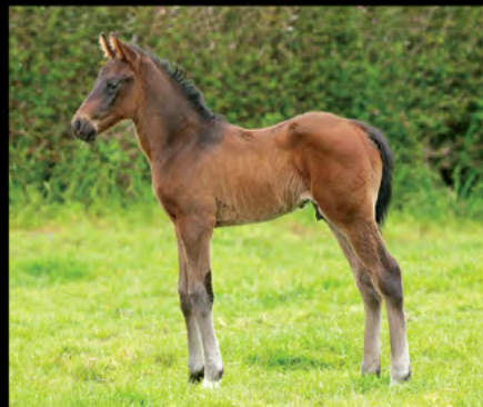
Colt ex Majikat. Bred by Yulong Investments NZ

BRIGHTHILL FARM ESTD 1996 QUALITY STALLIONS