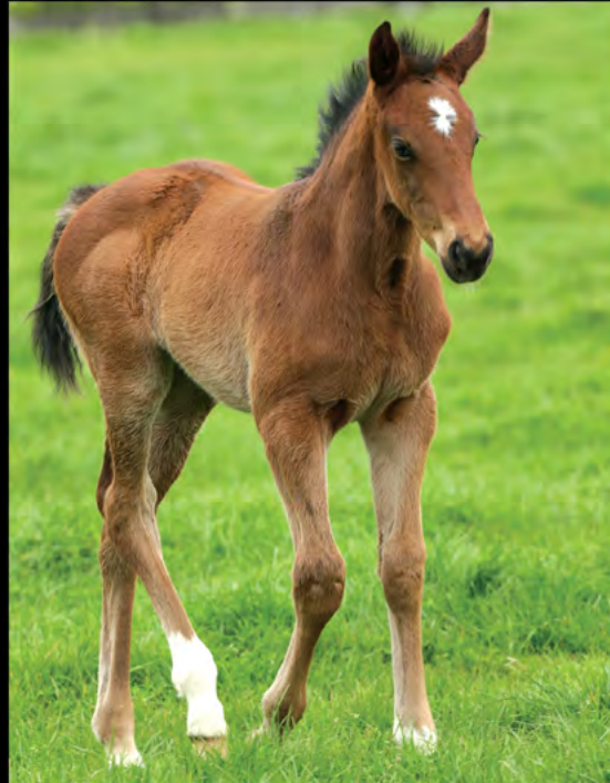
Colt ex Empress Elect. Bred by Llanhennock Trust