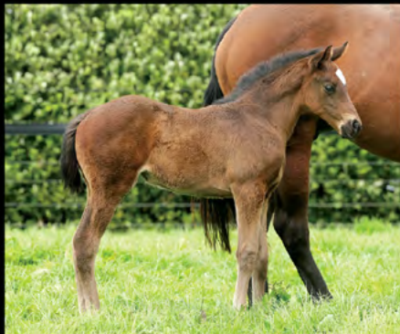
Filly ex Moodhilla. Bred by Yulong Investments NZ