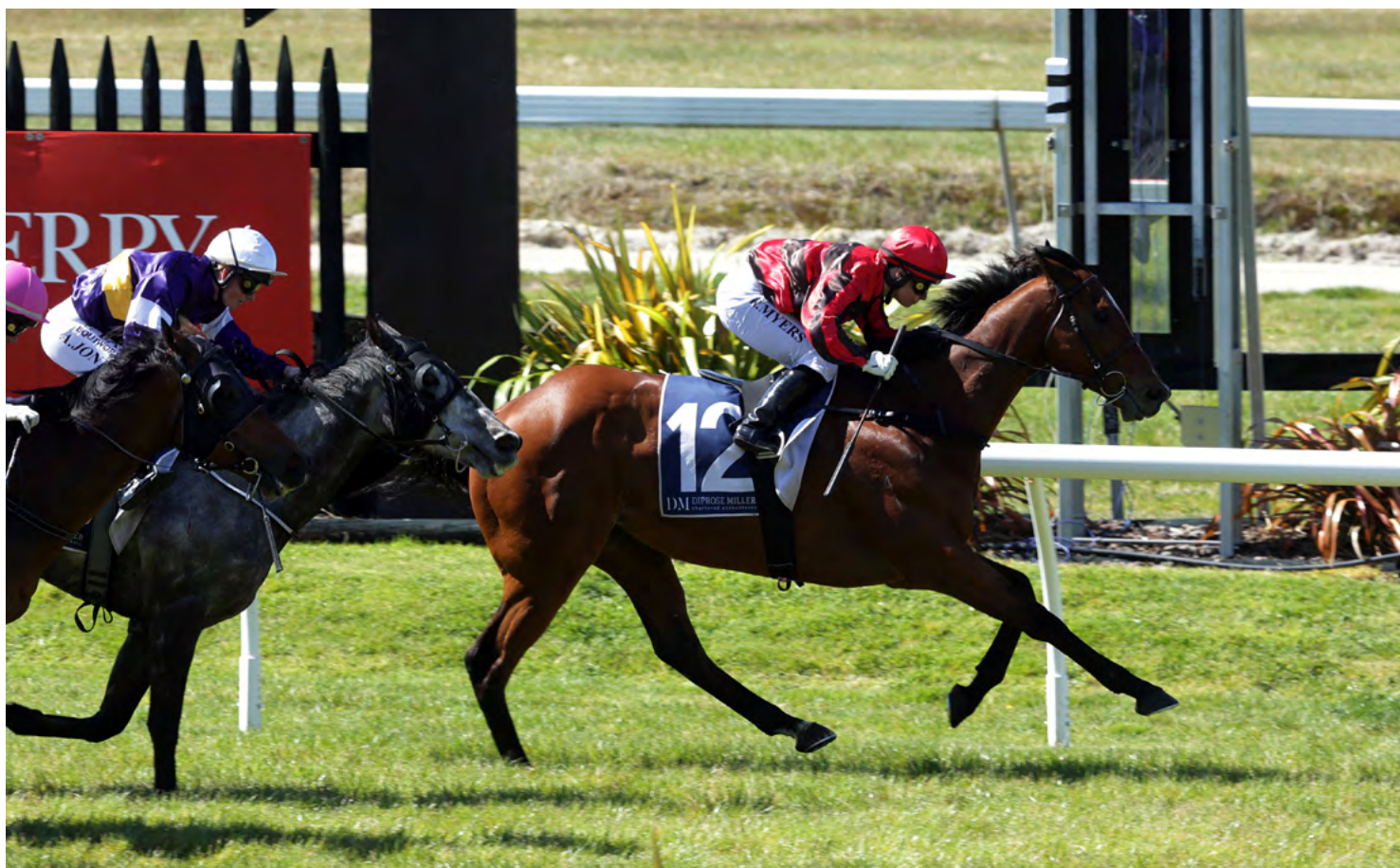
Peso scores his biggest career victory as he strikes in the Listed Jakkalberry Classic at Rotorua