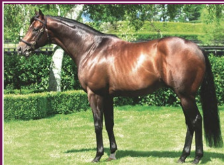
UNRESERVED POWER NOMINATION