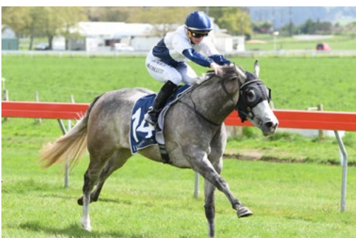
Kapoor (NZ) (Reliable Man)

The win was Premiere's fifth from 14 Hong Kong starts and made it two from two this campaign.