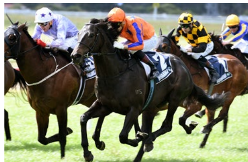
Embellish (NZ) (Savabeel)

The condition, a separation of the hoof wall, came to light after Dolcetto's last gallop. Full story here