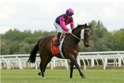
Royal Fashion (Snitzel)