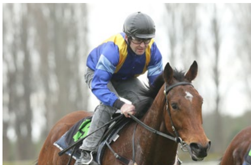
Vin De Dance (NZ) (Roc De Cambes)

"He relaxed nicely outside the leader," he said. "I think he'll go on to bigger and better things later on."