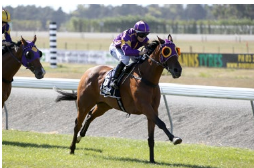
Boots 'N' All (NZ) (Perfectly Ready)

A subsequent training regime that has included hill work at Ann Browne's Cambridge property and schooling has contributed to the Redwood gelding's improved attitude.