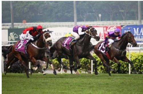
War Affair (NZ) (O'Reilly)

"The tracks here haven't helped and there's a lot better races over there for fillies and mares."