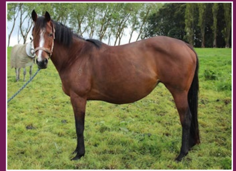
ZABEEL MARE IN FOAL TO EL HERMANO