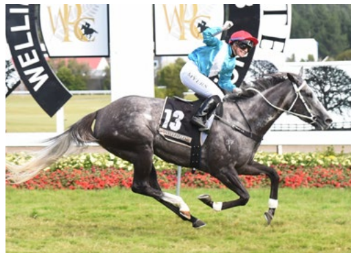
Thee Auld Floozie (NZ) (Mastercraftsman)