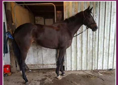
WELL-RELATED PENTIRE MARE

NEXT NZ AUCTION DATES • Listings close 7pm Monday 23 October • Catalogue published online 5pm Tuesday 24 October • Bidding from 5pm Tuesday to close of auction on Monday 30 October at 7pm •