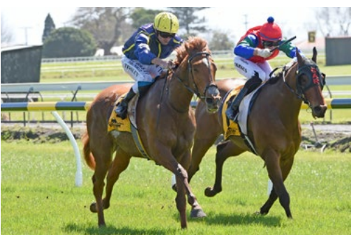
Euphoria (NZ) (Rip Van Winkle)