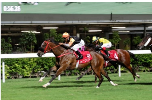
Premiere (NZ) (Dylan Thomas)