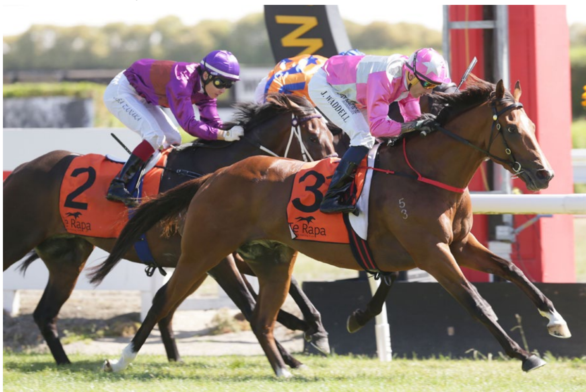
Wyndspelle looks a leading chance in tomorrow's Gr. 1 Toorak Handicap at Caulfield