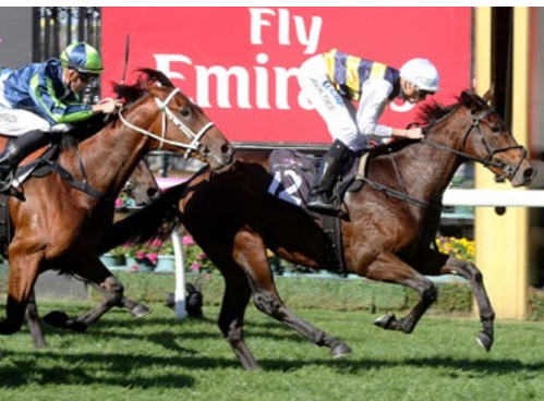
Aloisia (NZ) (Azamour)