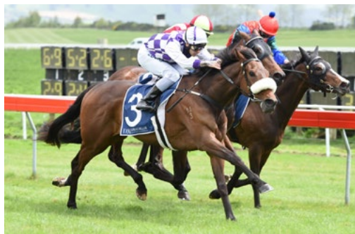
Woodloveto (NZ) (Redwood)