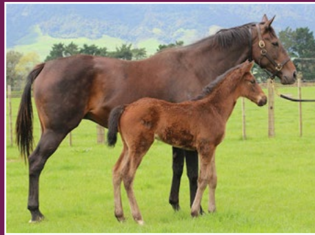
3 IN 1 LOT - MARE IN FOAL TO OCEAN PARK WITH SACRED FALLS COLT