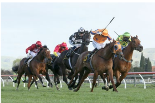
Gingernuts (NZ) (Iffraaj)