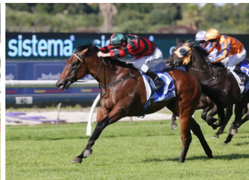
Summer Passage (Snitzel)