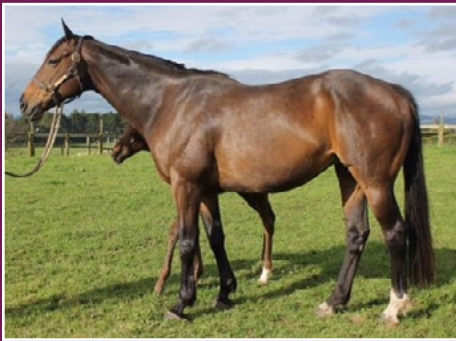
WELL-RELATED VOLKSRAAD MARE WITH RELIABLE MAN COLT AT FOOT