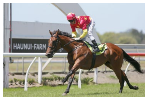
Aim Smart (Smart Missile)