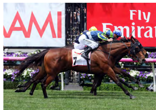
Luvaluva (NZ) (Mastercraftsman)

"Drawing barrier 12 in the Thousand Guineas is not ideal but one thing I will say is she will be strong late and will eat up the 1600m.