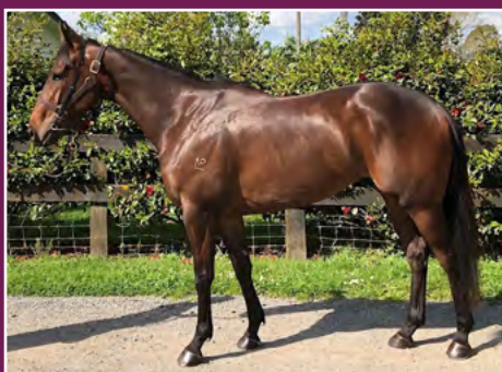
TRIAL WINNING SON OF JAKKALBERRY.

Bidding closes from 7pm Monday 15 October!