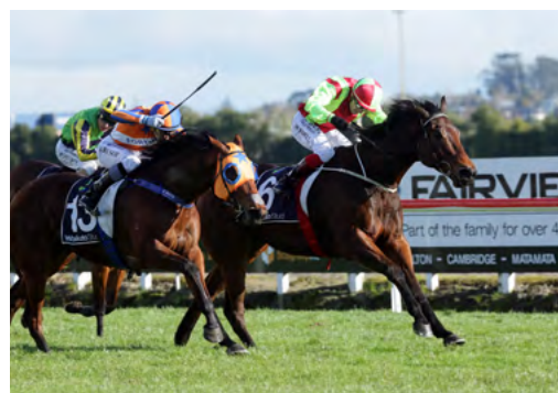
Our Abbadean (NZ) (Lookin At Lucky)

A dual Group Three winner, Julius has won seven of his 12 starts and been placed in the other five.