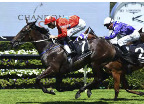
Seabrook (NZ) (Hinchinbrook)