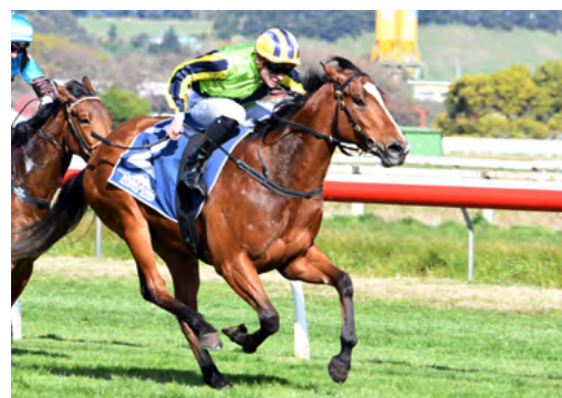
Peaceful (NZ) (Savabeel)

The colt is a $25,000 graduate of the New Zealand Bloodstock Select Yearling Sale.