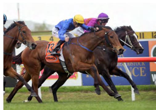
Langkawi (NZ) (Helmet)

Langkawi (NZ) (Helmet), an impressive 1400m winner at Hastings last Saturday will be kept for targets in the summer and