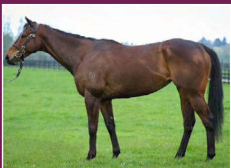
REDWOOD MARE OUT OF A GR.1 WINNER. RACE OR BREED.