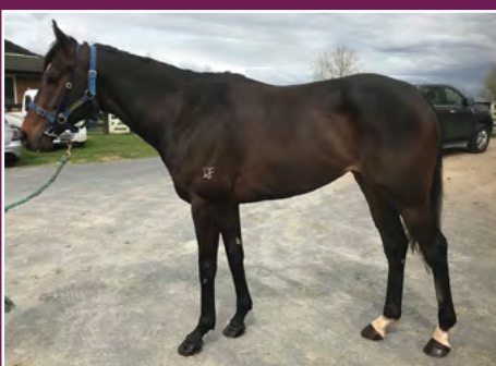
TRIAL PLACED SON BY DENMAN OUT OF A GALILEO MARE.