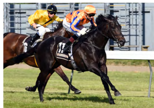
Embellish (NZ) (Savabeel)

"We rode him upside down last time. We pushed him forward a little bit and it was a fast run race."