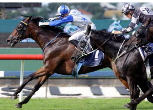
Sir Charles Road (Myboycharlie)

Both horses are now enjoying some quiet time before again being tested in feature events. Full story here