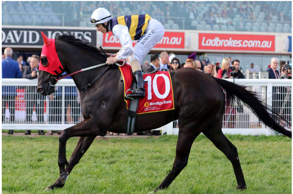
Impressive last start winner Night's Watch tackles the Gr.1 Caulfield Stakes tomorrow

"He should get a good run from the barrier (3) and, if he runs through the line strongly, he will definitely be