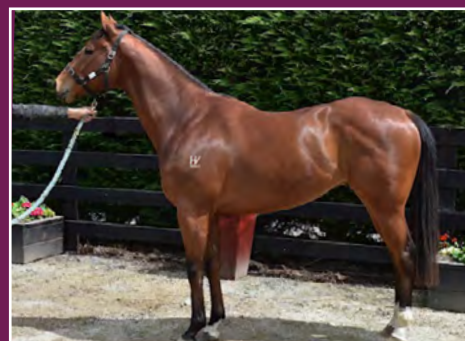
SON OF TAVISTOCK OUT OF A STAKES PRODUCING MARE.