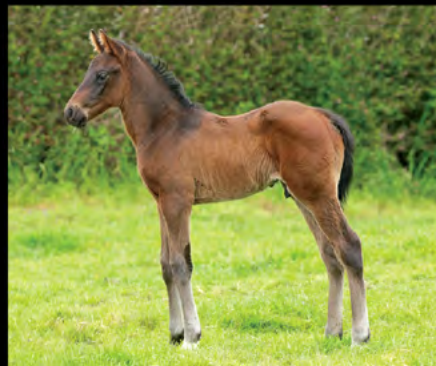
Colt ex Majikat. Bred by Yulong Investments NZ

BRIGHTHILL FARM ESTD 1996 QUALITY STALLIONS