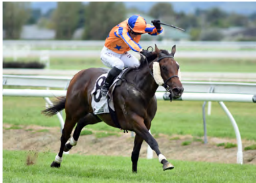
Avantage (Fastnet Rock)