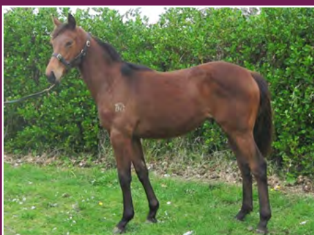
ZACINTO FILLY OUT OF A FOUR-TIME WINNER.