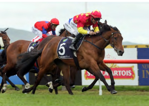
Madison County (NZ) (Pins)