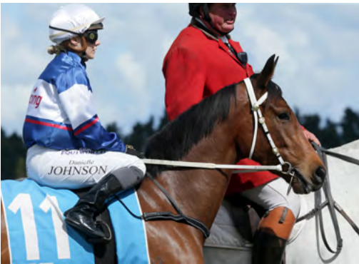
Rip Em Up (NZ) (Rip Van Winkle)