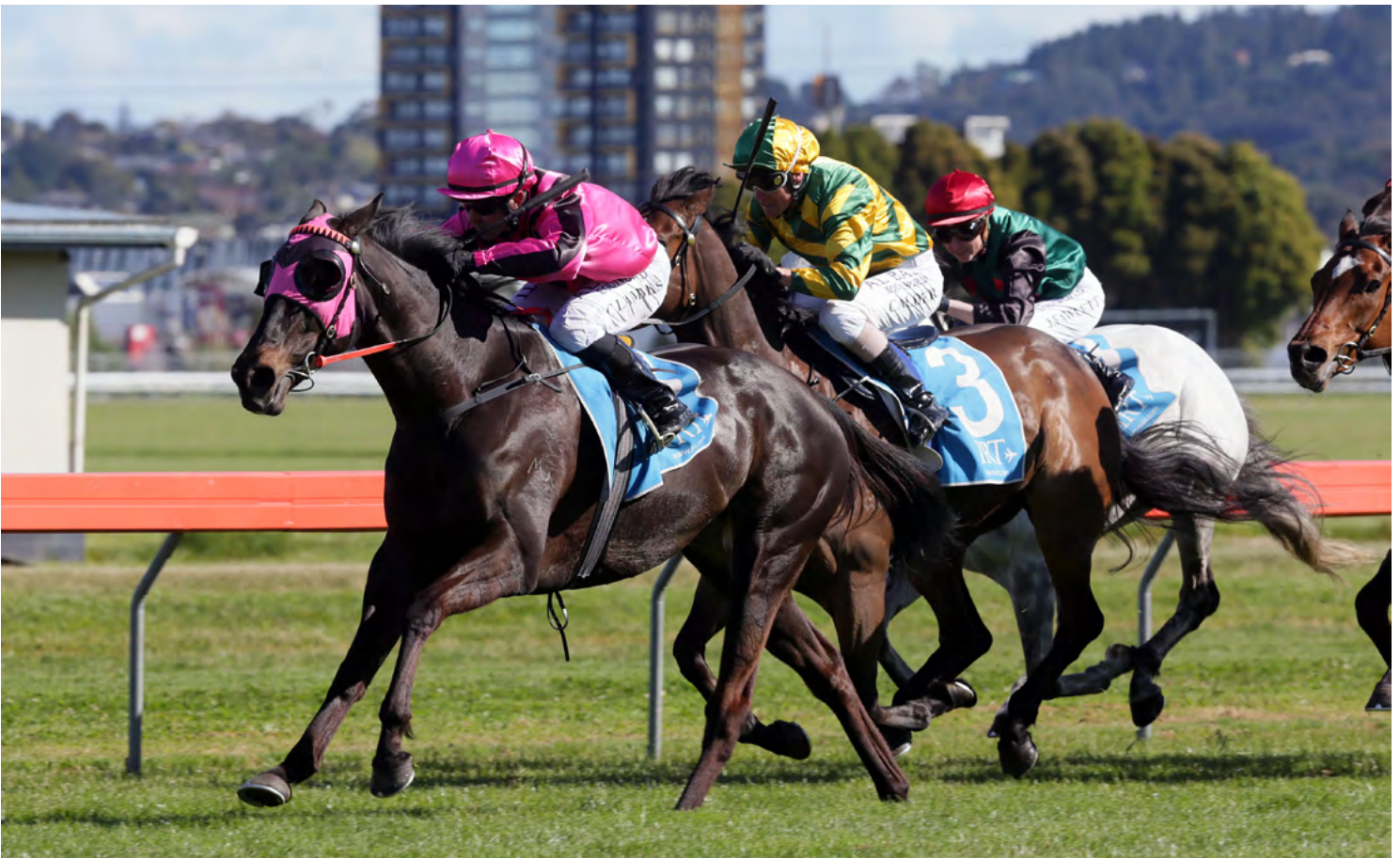
Livin' On A Prayer will continue her build-up to Riccarton with a run at Hawera on Saturday