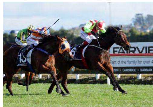
Julius (NZ) (Swiss Ace)