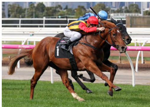
Vassilator (NZ) (Zacinto)