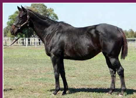
FOUR-TIME WINNER WITH A FOAL AT FOOT BY SMART MISSILE.