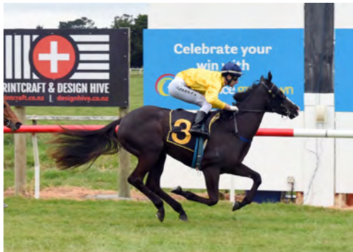
The Tailors Niece (NZ) (Showcasing)