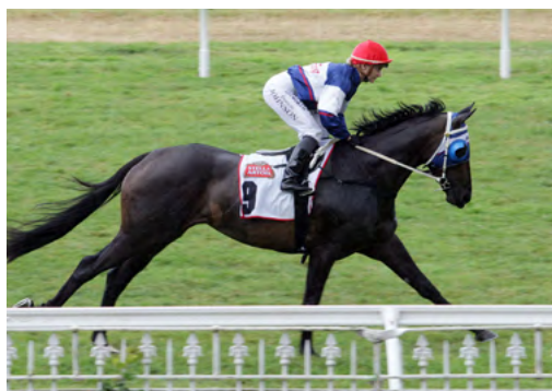
Mark Two (NZ)