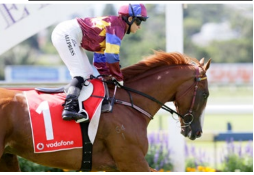
Pentathlon (NZ) (Pentire)

"It's a shame to see them go as they're both smart young horses, but the money was too good to turn down. They'll do well in Hong Kong, they're the right type of horses for up there." <u>Full story here</u>