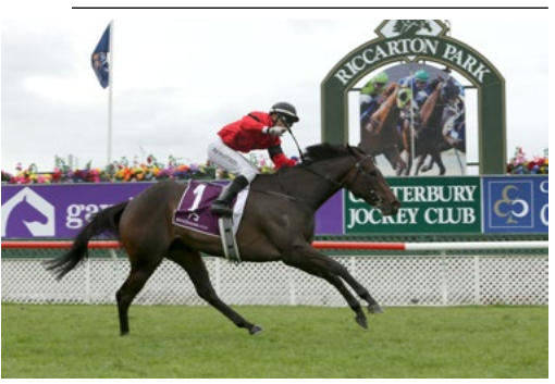
La Diosa (NZ) (So You Think)