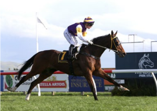
Nymph Monte (NZ) (Tavistock)

"I don't know what her best distance is, but you don't over-analyse things with Winx," he said.