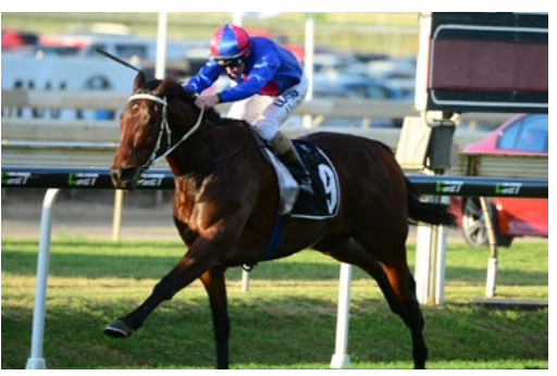
Chocante (NZ) (Shocking)