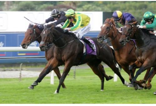
Seventh Up (NZ) (Shinko King)

The Precious One also holds a nomination for the Gr.1 Al Basti Equiworld 2000 Guineas on the first day of the NZ Cup Carnival next month.