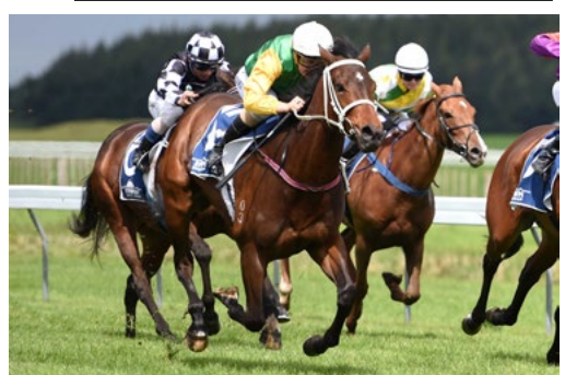
Sweepstake (NZ) (Per Incanto)

but won't be available for the mount in the Caulfield Guineas. <u>Full story here</u>