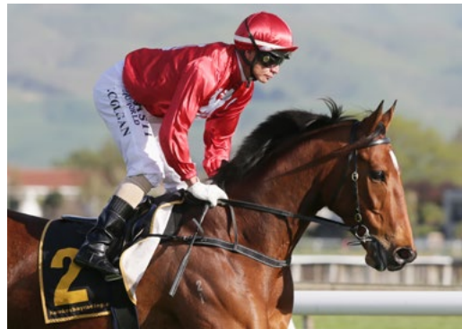
Volkstok'n'barrell (NZ) (Tavistock)