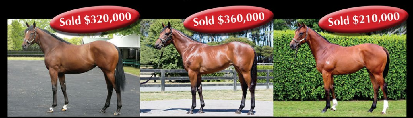
Bay Colt ShamExpress - Miss Swiss