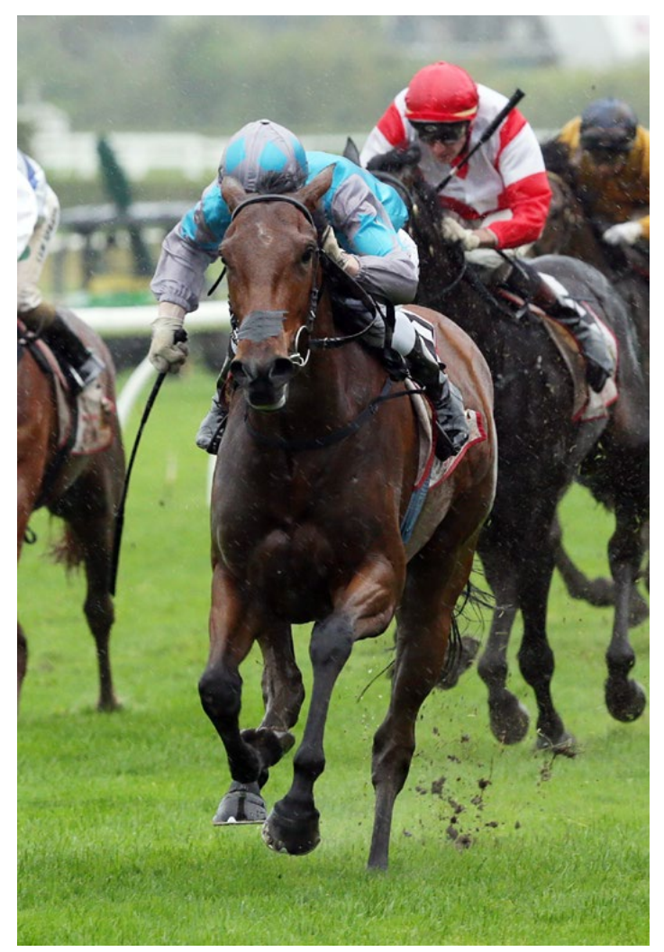
Promising three-year-old filly Hello M'Lady is one of the favoured runners in today's Gr. 3 Lucia Valentina Wellington Stakes at Otaki