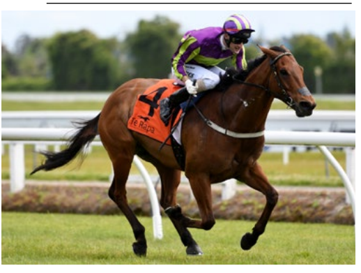
Start Wondering (NZ) (Eighth Wonder)

"Cylinder Beach is working well and he is fit enough to run well at the 1400 metres in the Recognition Stakes," she said.