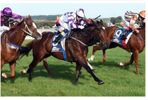
Interstellar (NZ) (Shamoline Warrior)

"I'm looking forward to getting on some nice horses here rather than slow ones," he said. "I didn't have much luck in Hong Kong, especially in the second half. Full story here.