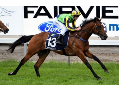
Maraini (NZ) (Exceed And Excel)