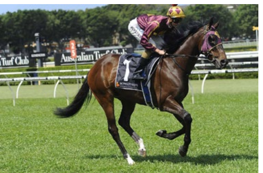
Cylinder Beach (NZ) (Showcasing)

A half-brother by Exceed And Excel to Group winner Hasselhoof (NZ) (Tavistock), he won a Matamata maiden on debut and then finished runner-up to the promising Rising Shot (NZ) (Red Giant) at Te Rapa.