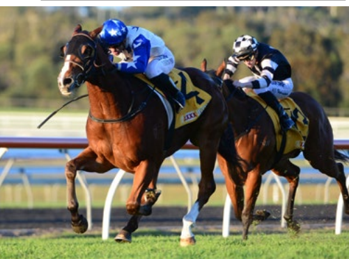
Crack Me Up (NZ) (Mossman)

Somethingvain's career-best performance came on her home track 12 months ago when she finished runner-up in the Gr.2 NRM Auckland Thoroughbred Breeders' Stakes (1400m) and at Pukekohe on Saturday she will be bidding to go one better. Full story here