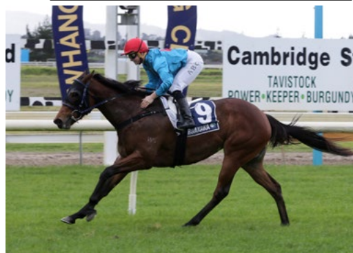
Florence Jean (NZ) (Pins)