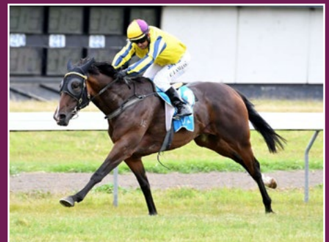
RACE OR BREED - DUAL WINNER & A HALF TO GR.1 WINNER.