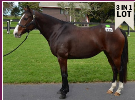
DAUGHTER OF A GR.1 WINNER IN FOAL TO PENTIRE WITH SHOCKING FILLY.