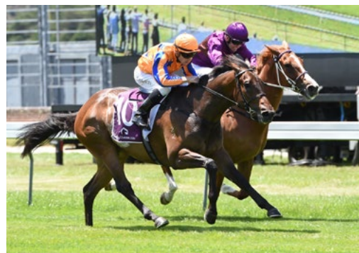
Royal Success (NZ) (Savabeel)