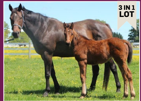
HALF TO A GR.1 WINNER IN FOAL TO PROISIR WITH OCEAN PARK FILLY.