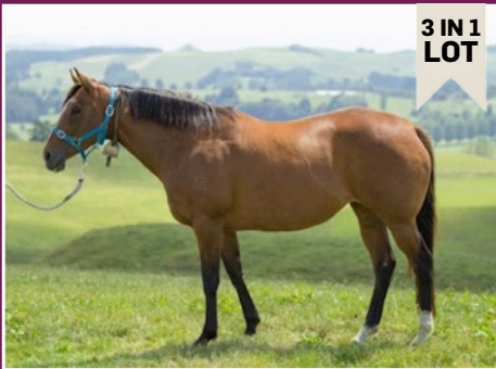
WELL-RELATED MARE IN FOAL TO PREFERMENT PLUS BURGUNDY FOAL.

Featuring 25 Lots including yearlings, racing stock and broodmares.