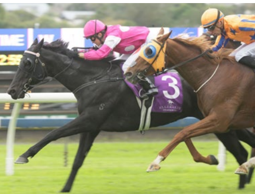
Somethingvain (NZ) (Falkirk)