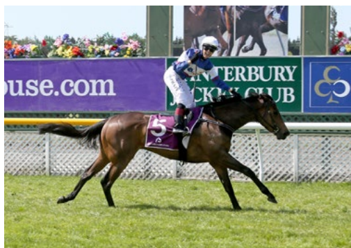
Hasahalo (NZ) (Savabeel)