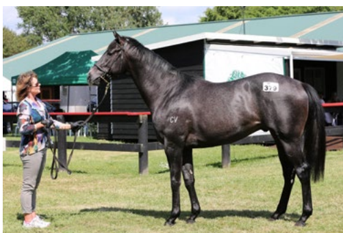
Lot 379 Reliable Man ex Stella Doro colt