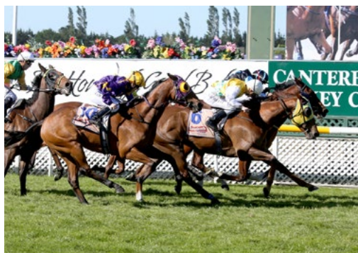
Shadows Cast (NZ) (Per Incanto) & Son Of Maher (Al Maher)

"She'll have a race somewhere over Christmas and then work toward the Karaka Mile."