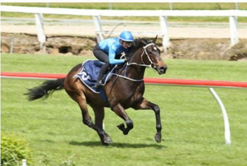
Lot 80 Smart Missile ex Cyclone Stacey gelding