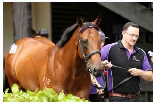
Lot 106 Hinchinbrook ex El Ashb colt