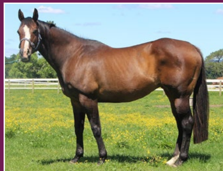
EMPTY STAKES WINNER & MULTIPLE STAKES PERFORMER. UNRESERVED.