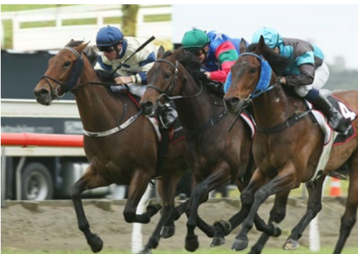
Prince Of Passion (NZ) (Castledale)