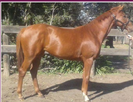
HIGHLY RECOMMENDED FILLY.