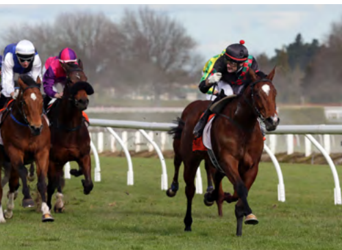
Volpe Veloce (Foxwedge)