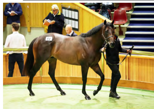
Lot 77 Charm Spirit-Key To Success

"He's going to make a great sire. He's one of the most beautiful animals you will ever see and he is one of the best horses Te Akau has trained."