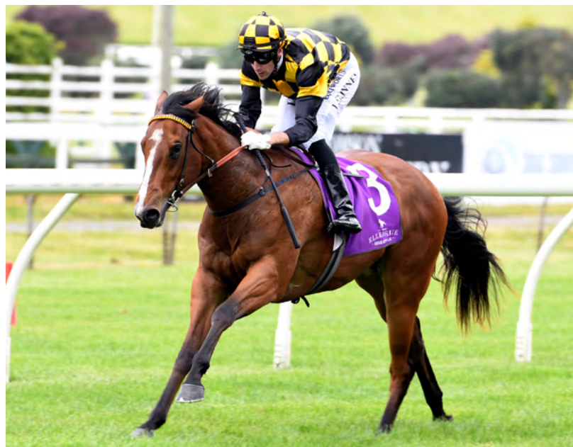
Exciting two-year-old filly Bavella will be looking for her first stakes success at Pukekohe tomorrow