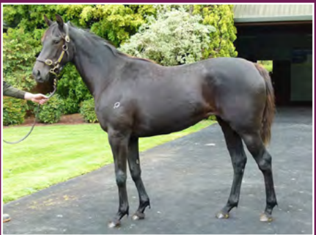
RELIABLE MAN FILLY OUT OF A GROUP TWO PERFORMER.