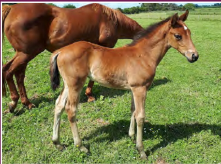
UNRESERVED MARE WITH ROCK 'N' POP COLT AT FOOT.

Catalogue online now - bidding closes from 7pm Monday!