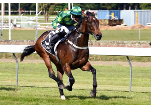
Hiflyer (NZ) (Tavistock)

"It is great to have a choice of where to go (with him this autumn) and we think he is a horse good enough to go over to Australia and be competitive."