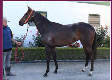
UNRESERVED BURGUNDY FILLY FROM A HALF TO JUSTA TAD.