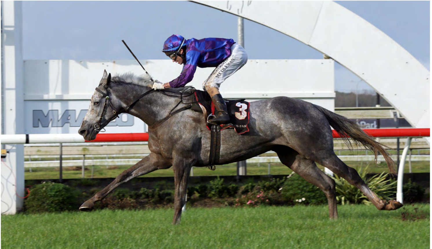
Megablast will tackle Saturday's Gr.3 Ssangyong Counties Cup at Pukekohe