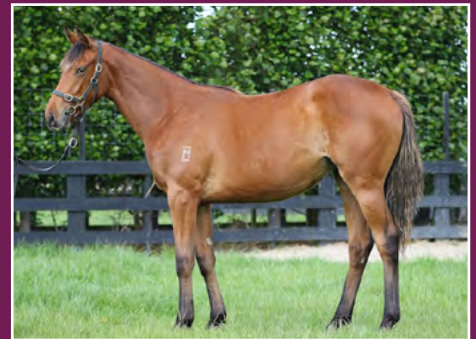
WELL-RELATED YEARLING FILLY BY RIP VAN WINKLE.