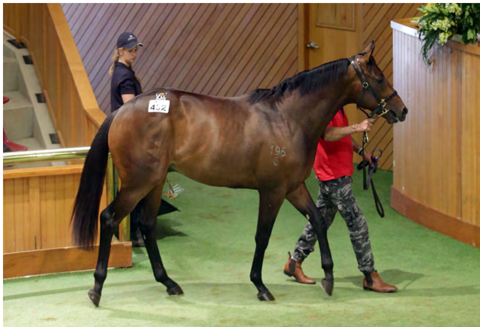
Lot 432, the Savabeel colt from the Dormello Stud draft topped this week's New Zealand Bloodstock Ready To Run Sale of two-year-olds

He is hoping the Savabeel colt can join his stallion roster in the coming years but is looking forward to his racing career in the meantime.