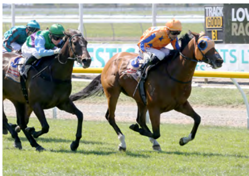
Remington (NZ)