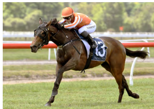
Jip Jip Rock (High Chaparral)

confidence up before we get too carried away."