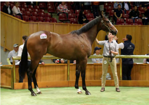
Lot 407 Toronado-Circus Polka