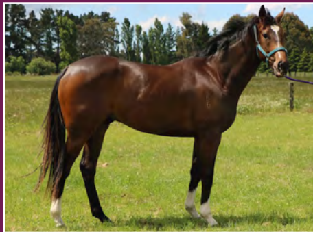
UNTRIED ZACINTO 2YO. BROKEN IN & READY TO GO.