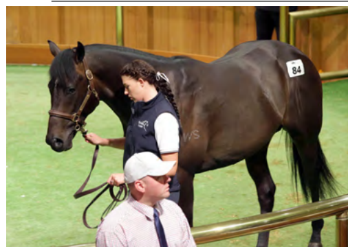
Lot 84 Savabeel-Lady Chaparral colt