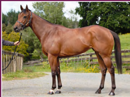
TALENTED, LIGHTLY TRIED POSTPONED MARE.