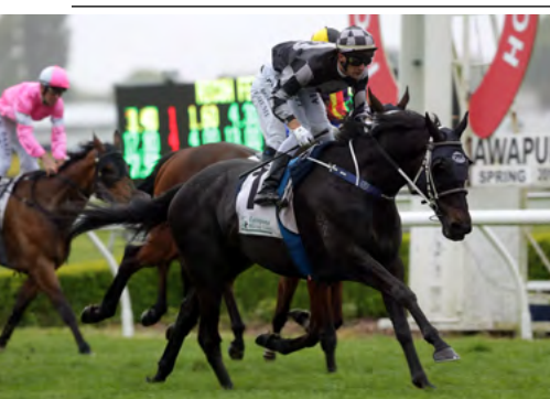
Five To Midnight (NZ) (Domesday)