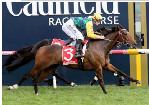
Lucky For All (NZ) (Tavistock)