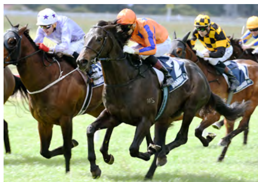
Embellish (NZ) (Savabeel)