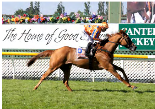
Te Akau Shark (NZ) (Rip Van Winkle)

Ellis purchased triple Group One winner Gingernuts (NZ) (Iffraaj) at the sale in 2015 for $42,500 and went to $230,000 to secure current stable star Te Akau Shark (NZ) (Rip Van Winkle) a year later.