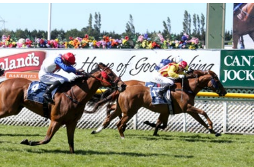
Carnival (NZ) (Showcasing)

"I've won a few Winter Cups, but this would be the best race I've won down here," he said. Full story here