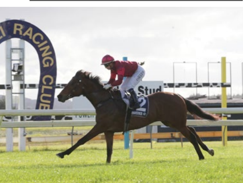
Kaharau (Ad Valorem)