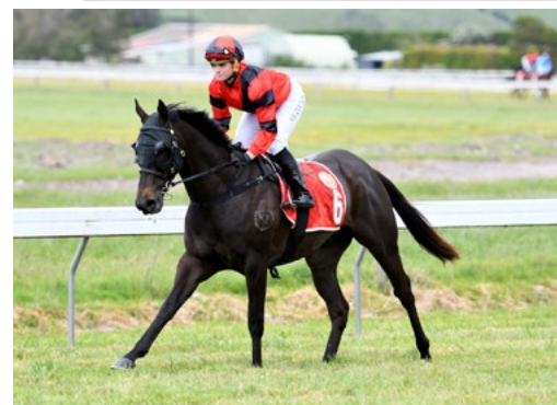
Creative Genius (Master Of Design)