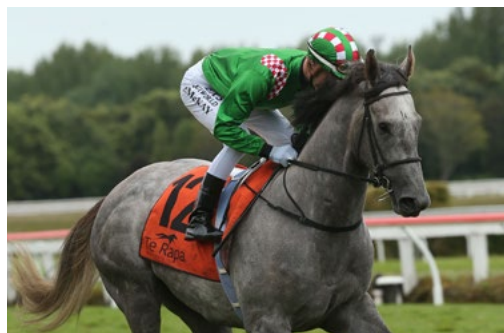
As You Will (NZ) (Mastercraftsman)

dual Group One winner MacO'Reilly (NZ) (O'Reilly), turned her form around to win the Te Aroha Stallion Placement Scheme 1400m after an inglorious first-up effort.