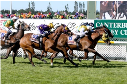
Son Of Maher (Al Maher) & Shadows Cast (NZ) (Per Incanto)