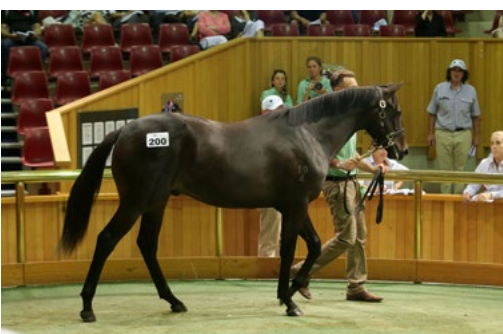
Embellish (NZ) (Savabeel)

Motivation (NZ) (Mastercraftsman) completed a running double for the stable when he won the following event, the Continuous Stainless Steel 1400m. He made a winning debut off the back of a trial success at Te Awamutu last month.