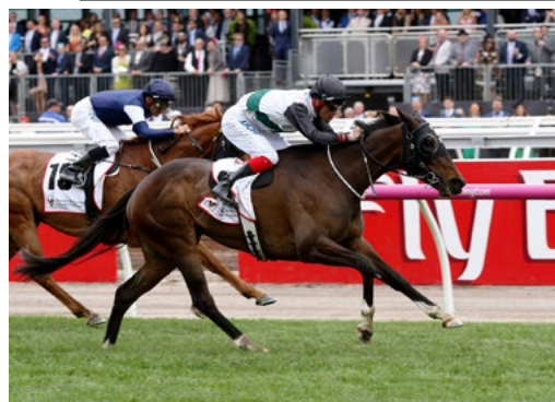
Fanatic (NZ) (Shocking)

"It was a very good performance. He won a hurdle race (over 2800m) earlier this year so I've always thought he will stay two miles."