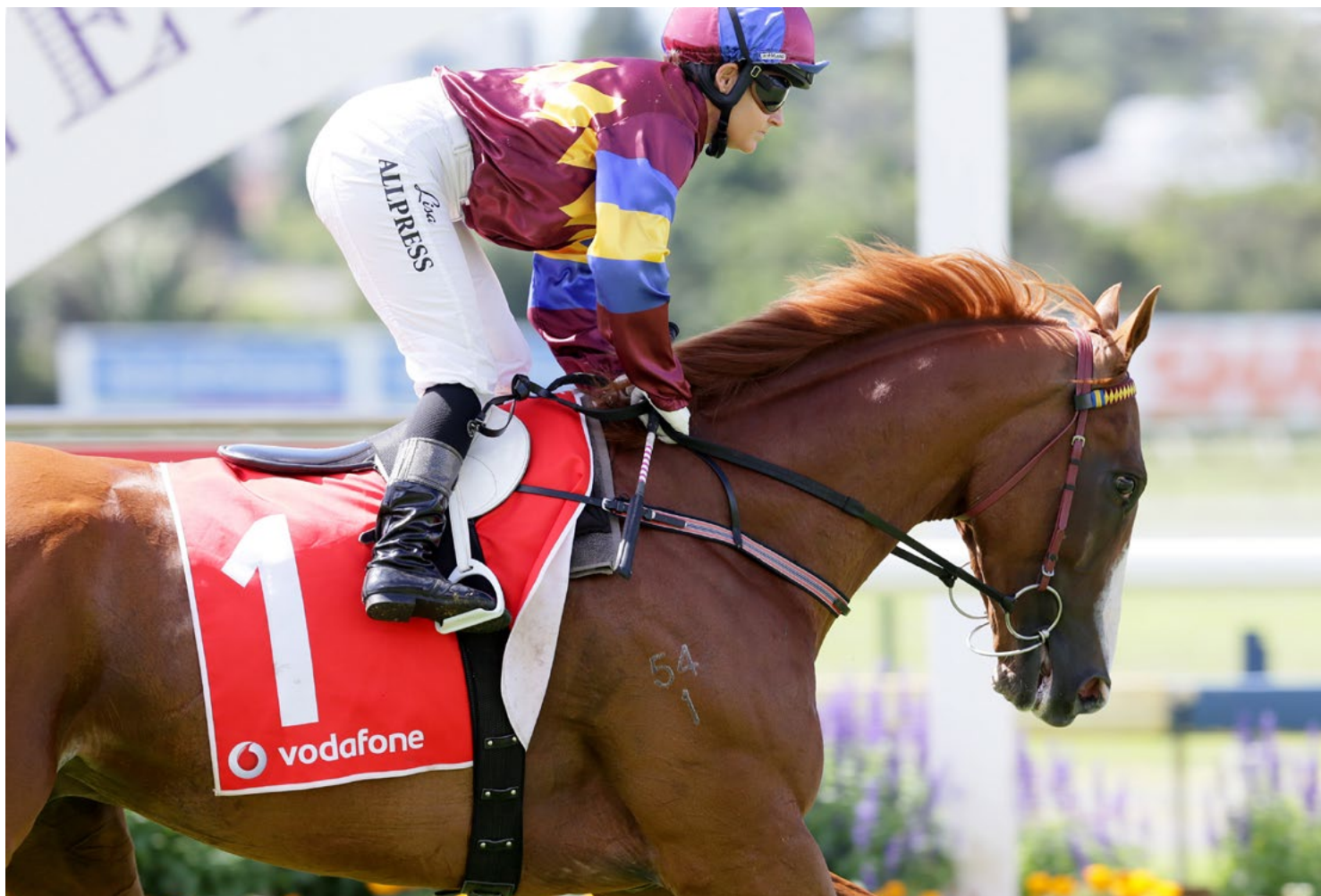
Pentathlon boasts some quality Australian form to back his claims in tomorrow's Gr. 3 Christchurch Casino New Zealand Cup