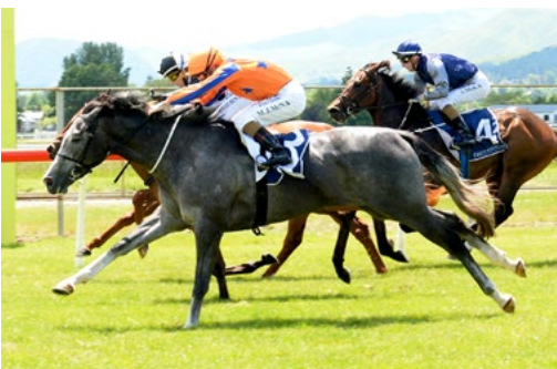
Gris Dame (NZ) (Reliable Man)