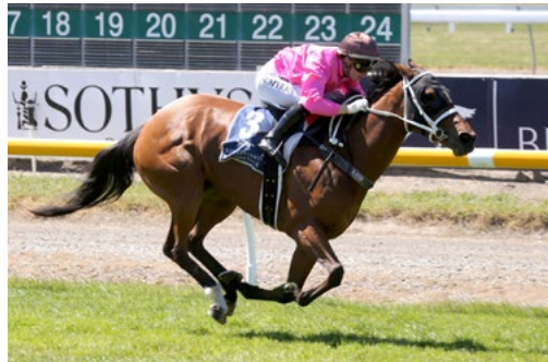
Heni (NZ) (Towkay)