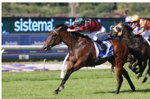
Summer Passage (Snitzel)

"We're very happy with where we've got her. She's bigger and stronger and ready to kick off in the open 1200m on December 9 at Ellerslie, which will get her ready for the major sprint races." Full story here