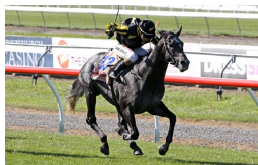
Battle Time (NZ) (Battle Paint)