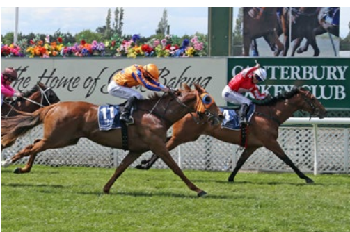
First Serve (NZ) (Swiss Ace)

Reilly Lincoln was a month between runs when she finished fifth in the Listed Pegasus Stakes on Saturday, a race she derived benefit from. Full story here.