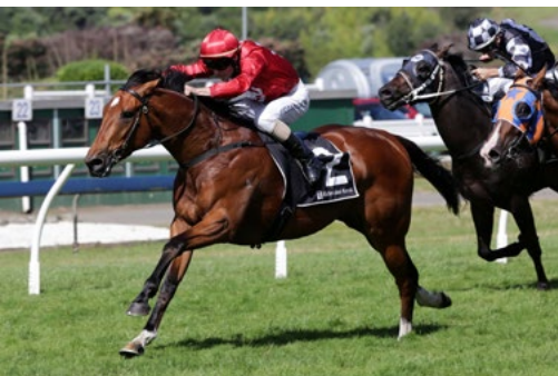
Volkstok'n'barrell (NZ) (Tavistock)