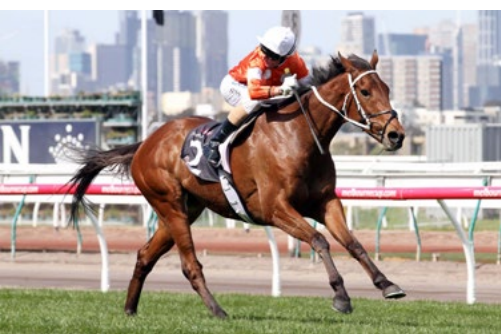
Who Shot Thebarman (NZ) (Yamanin Vital)

"But unless it's really heavy, we'll be running because we need to get the racing under his belt." Full story here.