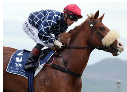
Mystery Show (NZ) (Sakhee's Secret)

Tucanchoo is at $6.50 alongside Lidari (Acclamation) with Cool Chap (High Chaparral) the $4.80 favourite, Alaskan Rose (NZ) (Encosta de Lago) is at $8.50 while Puccini (NZ) (Encosta de Lago), who finished second in the 2015 edition of this race, is at $18.