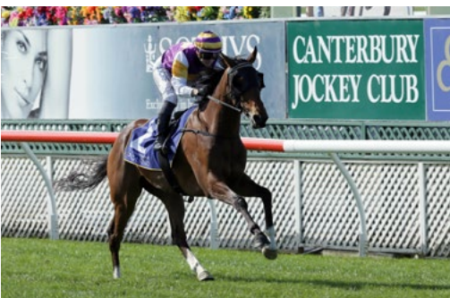
Nymph Monte (NZ) (Tavistock)