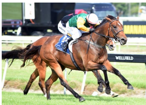
Shillelagh (NZ) (Savabeel)

"His attitude is the same. His work is the same. His times are the same. Everything is the same. He looks the same as when he went into his last race and nothing has worried him since."