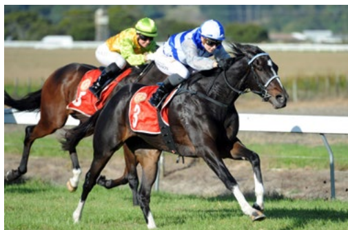
Quintessentially (NZ) (High Chaparral)