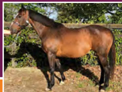
GR.1 PRODUCING ZABEEL MARE IN FOAL TO CONTRIBUTOR.