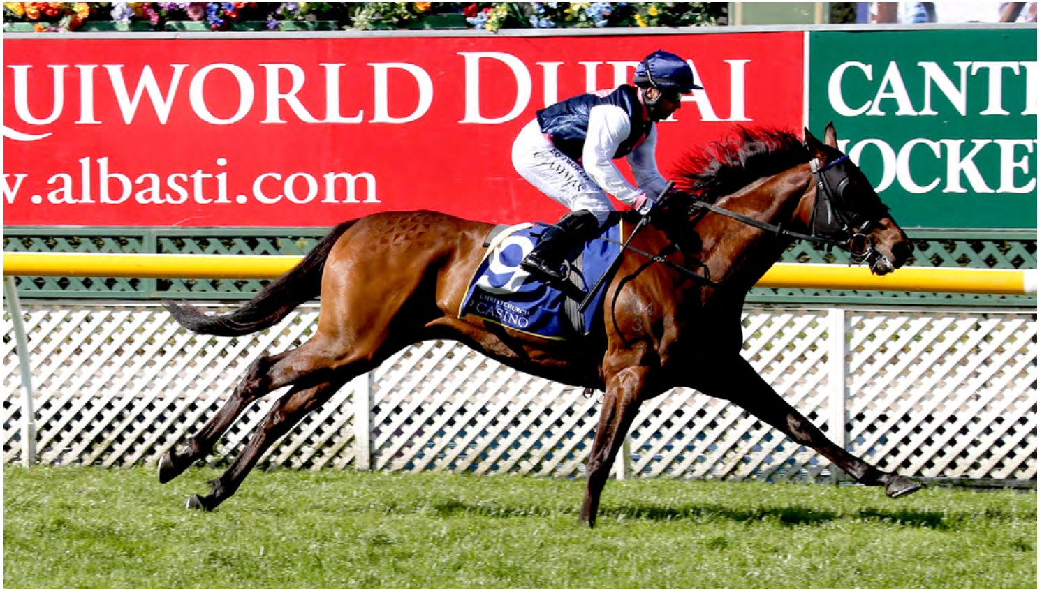
Dee And Gee is out on her own as she scores an upset victory at Riccarton