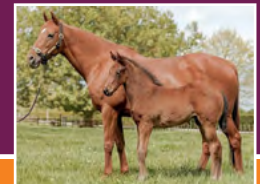
WINNER BY FAST 'N' FAMOUS & FOAL AT FOOT BY RIOS. UNRESERVED.

BIDDING CLOSSES FROM 7PM MONDAY 12 NOVEMBER - REGISTER ONLINE NOW TO BID.