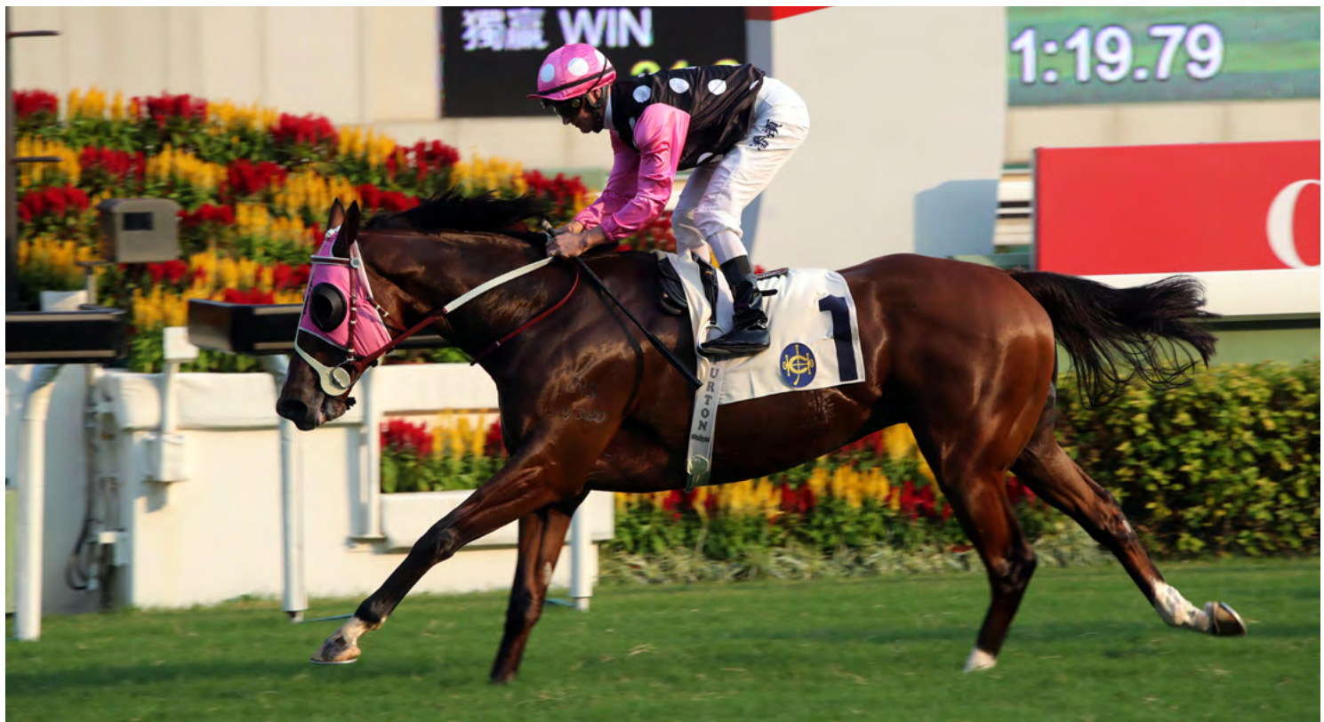
Beauty Generation has been recognized as the world's leading specialist turf miler