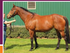
TEN-TIME WINNER, CURRENTLY EMPTY. UNRESERVED.