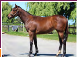
UNRESERVED FILLY BY SHAMEXPRESS.