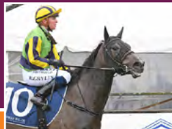
PEARL SERIES NOMINATED FILLY BY DALGHAR.