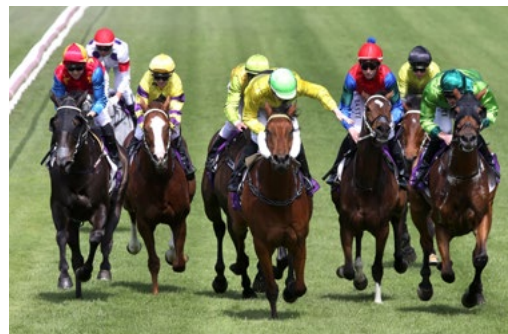
Watch This Space (NZ) (Elusive City)

Another creditable performance was her run for fifth in the Gr.2 Sir Tristram Fillies' Classic (2000m), five lengths off the subsequent multiple Group One winner Bonneval (NZ) (Makfi).