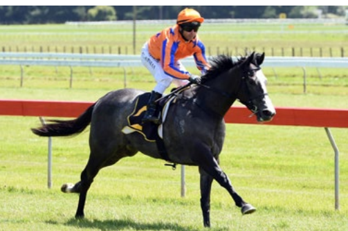
Pinot Grey (NZ) (Burgundy)