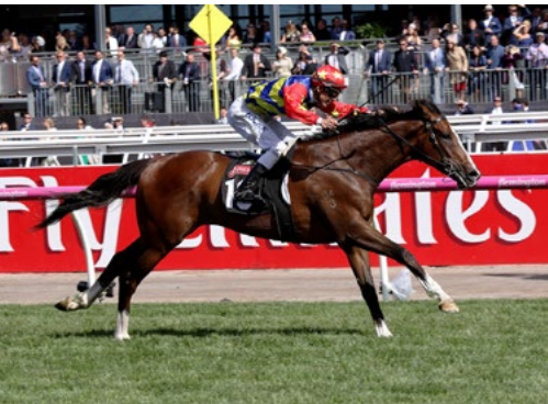
Odeon (NZ) (Zacinto)

Bowman had been booked for Gingernuts, but he was suspended for 11 meetings on Melbourne Cup day for his ride on the third-placed Hybrid (Royal Academy) in the Listed Lexus Plate (1400m). Full story here