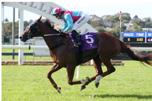
Fully Funded (NZ) (Fully Fledged)