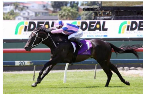
Rocanto (NZ) (Per Incanto)

Chance To Dance was a first-up winner of the Listed Karaka Classic (1600m) at Pukekohe, but he had the camp scratching their heads after he beat only one runner home in the Gr.1 Livamol Classic (2040m) at Hawke's Bay. Full story here