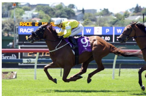
El Fernando (NZ) (El Hermano)