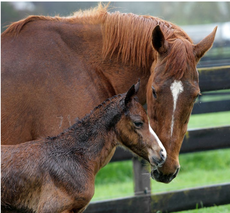
Prolific broodmare Parfore's (pictured) progeny have scored another victory down the famous Flemington straight with Ball Of Muscle triumphant at Listed level on Oaks Day

Although he went almost two-and-a-half years without a win, Ball Of Muscle's career record is now nine wins from 31 starts, with 14 minor placings, helping him amass A$898,825 in stakes.