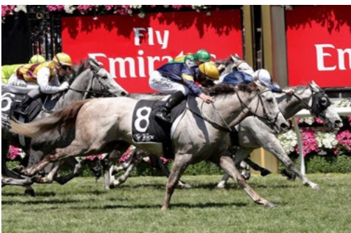
Tribal Wisdom (Makfi)