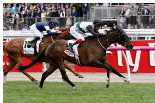
Fanatic (NZ) (Shocking)