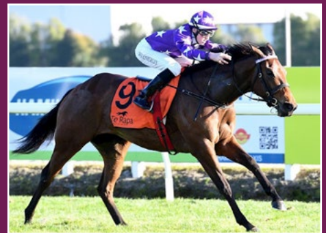
RACE OR BREED - DUAL WINNER.