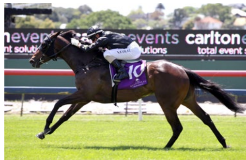
Grand Soleil (NZ) (Savabeel)

Grand Soleil looked well above average last season when she finished third in the Gr.2 Royal Stakes (2000m) and runner-up