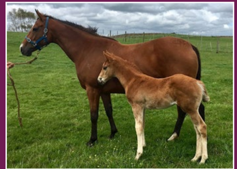
3 IN 1 LOT. PINS MARE IN FOAL TO SHOWCASING & PROISIR COLT.