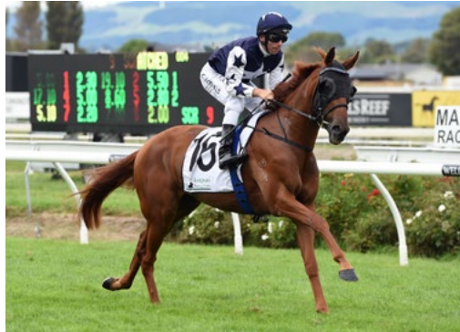
Scott Base (NZ) (Dalghar)

when successful in last year's New Zealand 2000 Guineas (1600m).