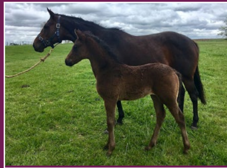
3 IN 1 LOT. IFFRAAJ MARE IN FOAL TO SUPER EASY & FERLAX COLT.