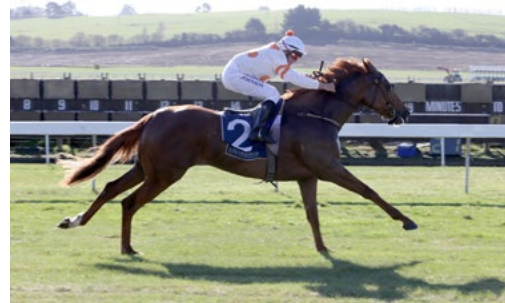
Astor (NZ) (Iffraaj)

Cambridge Stud Zabeel Classic (2000m) at Ellerslie on Boxing Day. Full story here