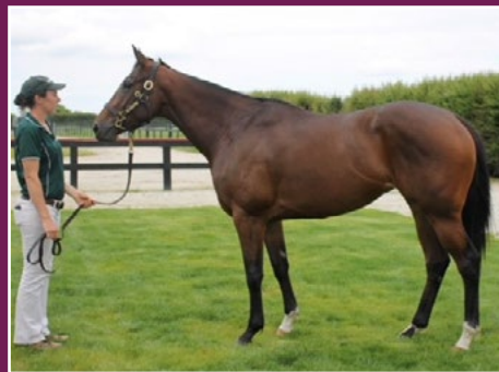
LIGHTLY TRIED SUPER EASY FILLY.