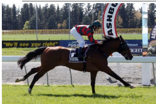
Cha Siu Bao (Smart Missile)