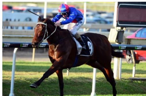
Chocante (NZ) (Shocking)

Chocante will open his summer campaign in the Rydges Captain Cook Stakes (1600m) at Trentham on December 9 ahead of the