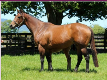
2 IN 1 LOT. EMPTY MORE THAN READY MARE & SACRED FALLS FOAL.

Featuring 22 Lots including yearlings, racing stock and broodmares.