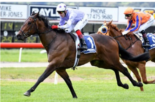
Ever Loyal (Sebring)