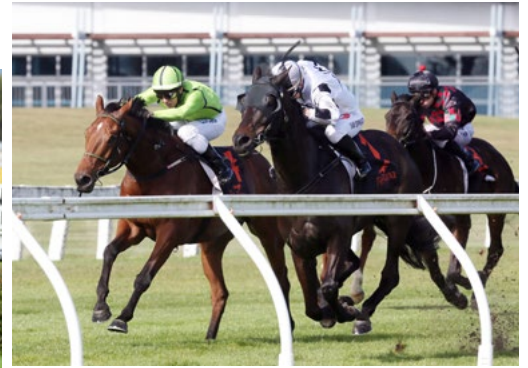
Bee Tee Junior (NZ) (Nom Du Jeu)