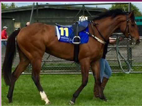
RACE OR BREED - TAVISTOCK MARE.