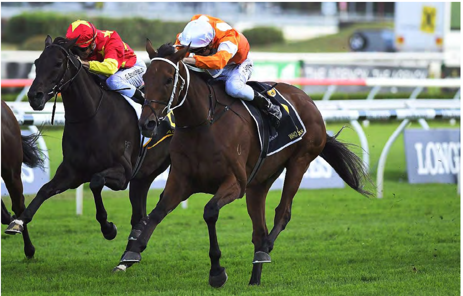
Evergreen galloper Who Shot The Barman winning the 2018 Gr.1 Sydney Cup

Evergreen kiwi stayer Who Shot Thebarman (NZ) (Yamanin Vital) will attempt to make it fourth time lucky when he lines-up in the A$7m Gr.1 Lexus Melbourne Cup 3200m at Flemington on Tuesday.