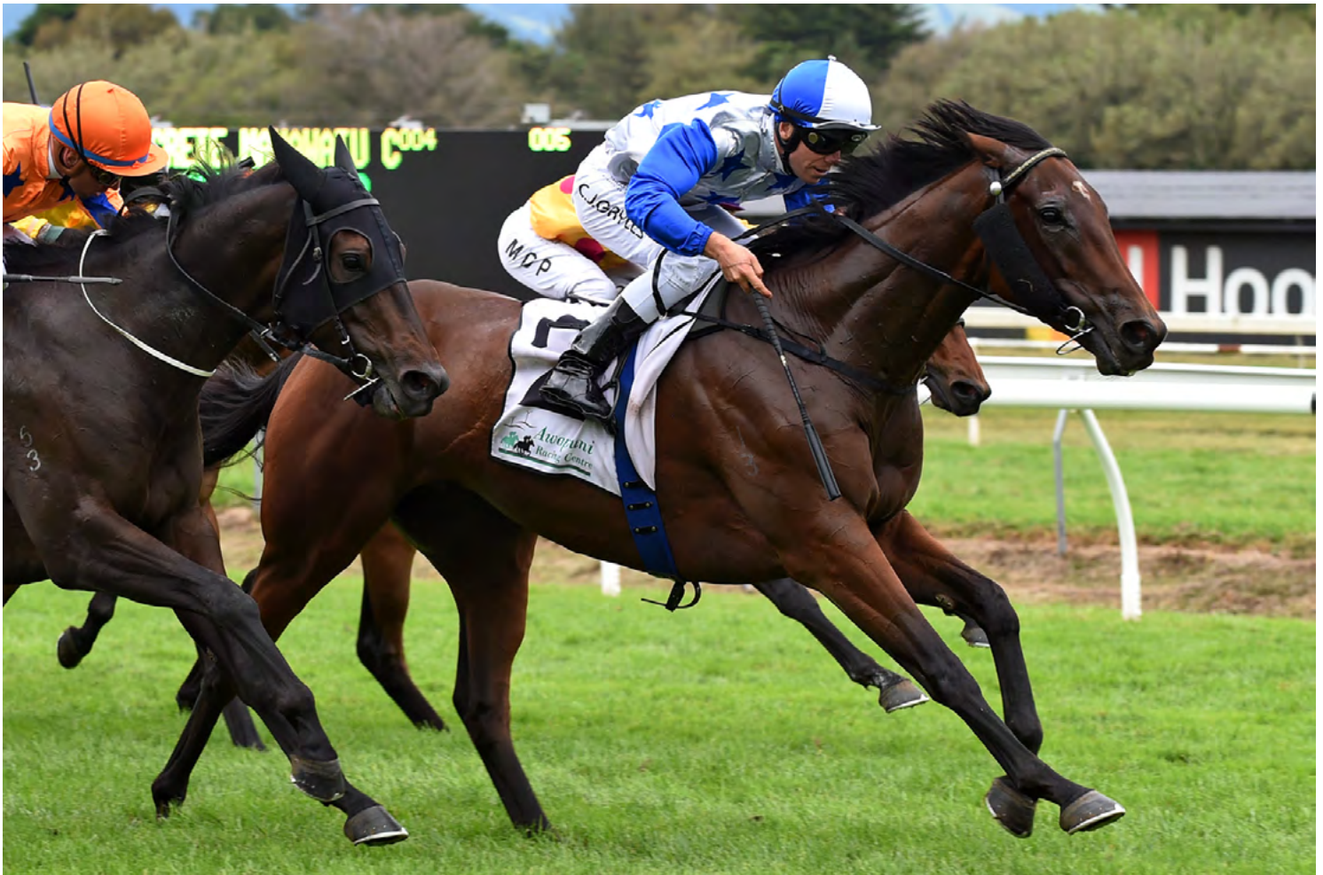
Sir Charles Road is ready to tackle Tuesday's A$7m Gr.1 Lexus Melbourne Cup