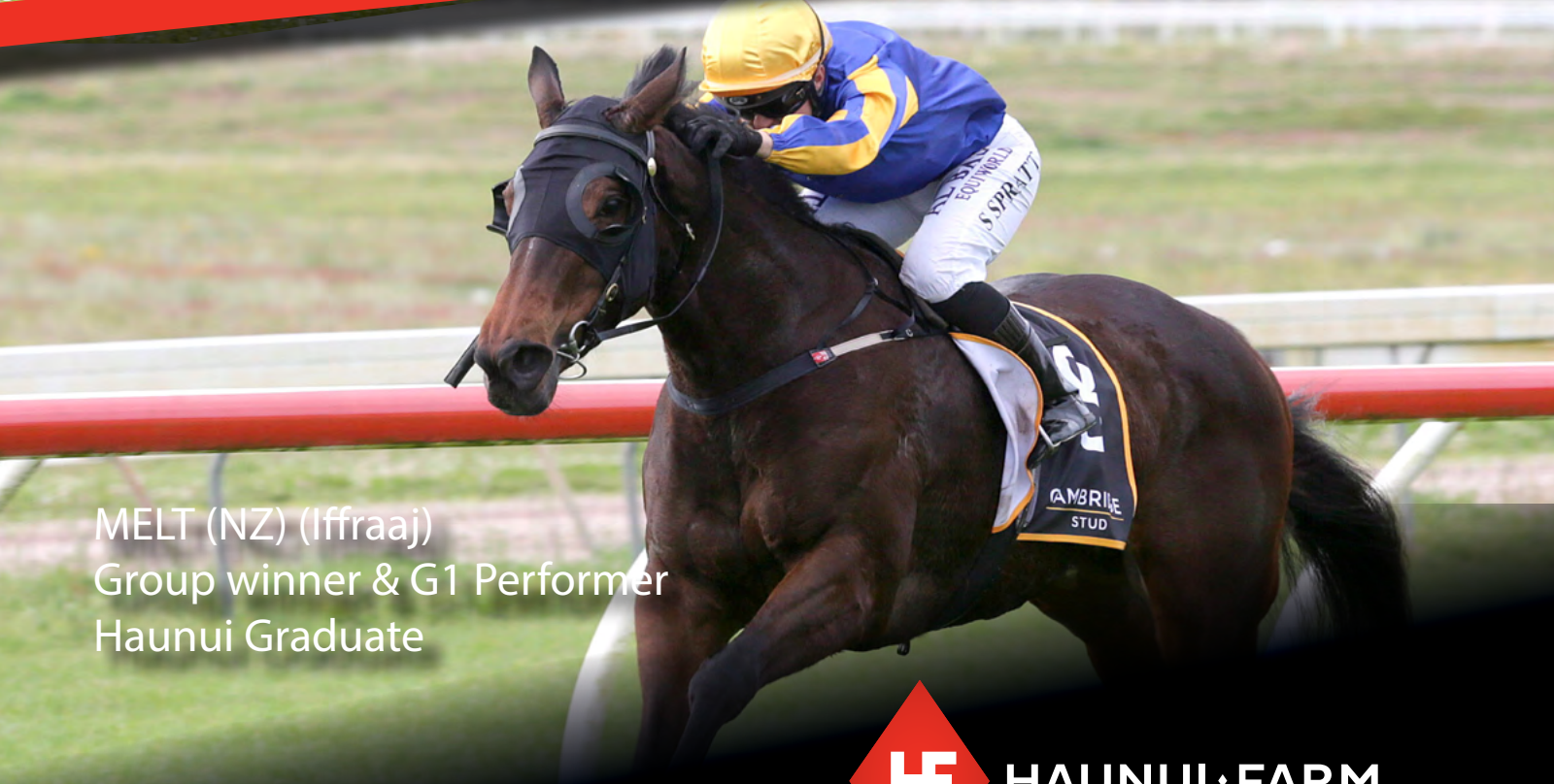
MELT (NZ) (Iffraaj) Group winner & G1 Performer Haunui Graduate