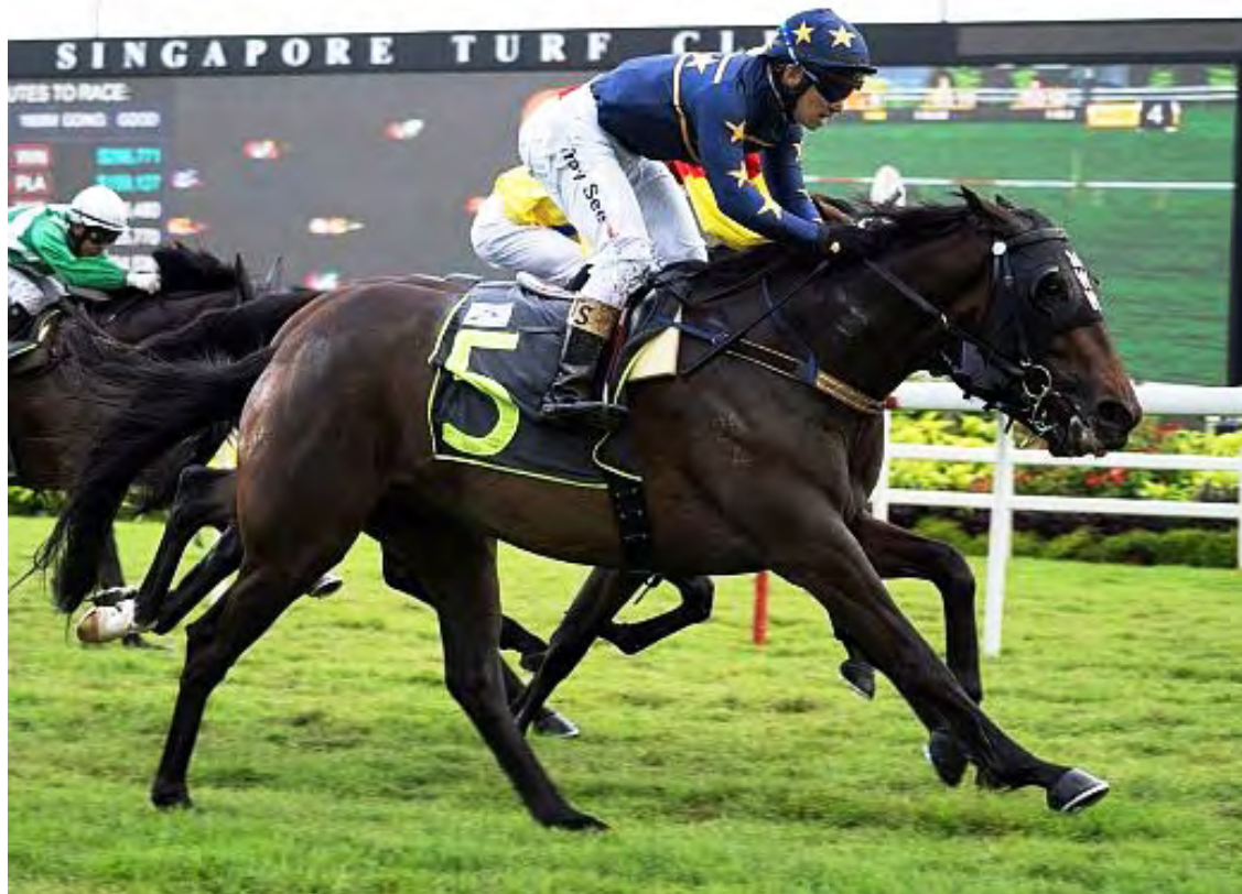
Lim's Rhythm breaks his maiden status at Kranji