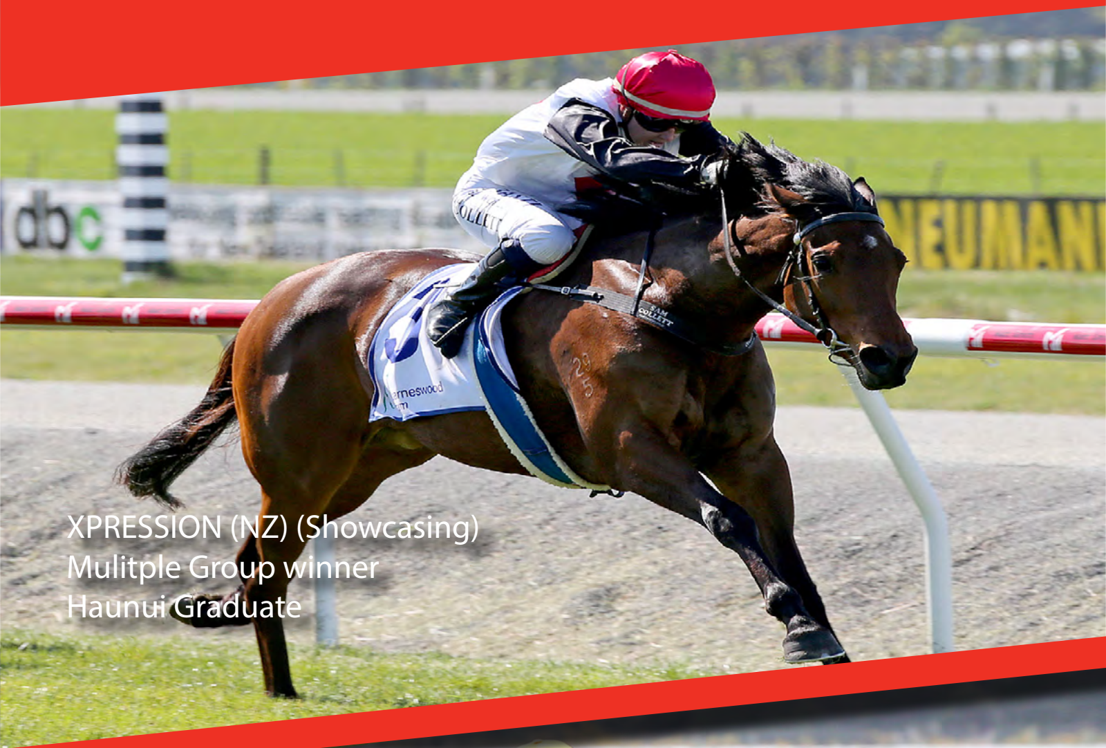
XPRESSION (NZ) (Showcasing) Multiple Group winner Haunui Graduate