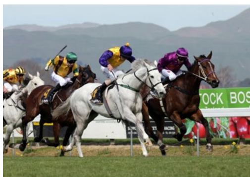
Blizzard (NZ) (Any Suggestion)