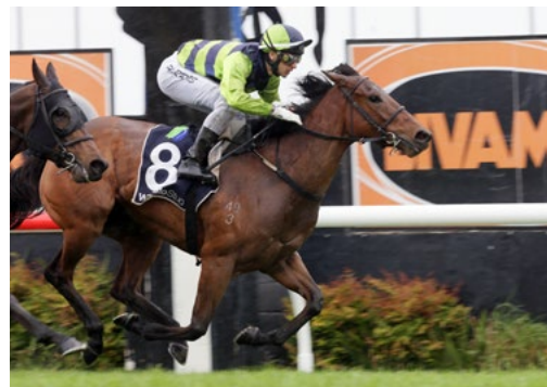
Yearn (NZ) (Savabeel)