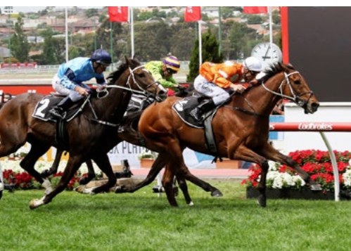
Who Shot Thebarman (NZ) (Yamanin Vital)