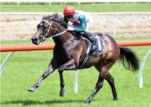
Power Dream (NZ) (Power)

The Cambridge conditioner is confident his charge is in the right shape to finally notch an elusive stakes victory and cap off an enjoyable week. Full story here