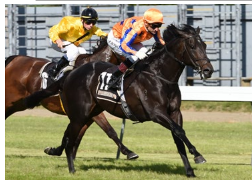
Embellish (NZ) (Savabeel)