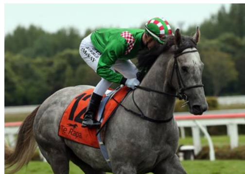
As You Will (NZ) (Mastercraftsman)