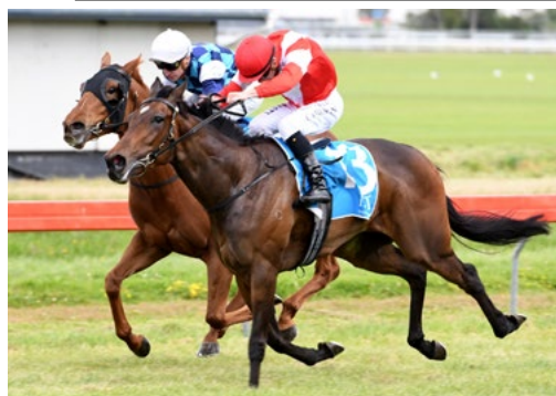
Mongolian Beauty (Fastnet Rock)