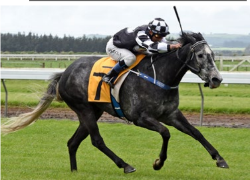
Whispering (NZ) (Darci Brahma)

Power Dream followed up her debut third behind the subsequent winners Embellish (NZ) (Savabeel) and Ever Loyal (Sebring) at Ruakaka with her maiden success at Tauranga earlier this month.