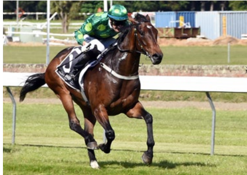
Hiflyer (NZ) (Tavistock)