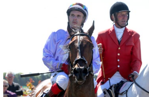
Ever Loyal (Sebring)