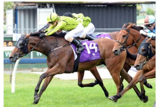
Snow Secret (NZ) (Sakhee's Secret)