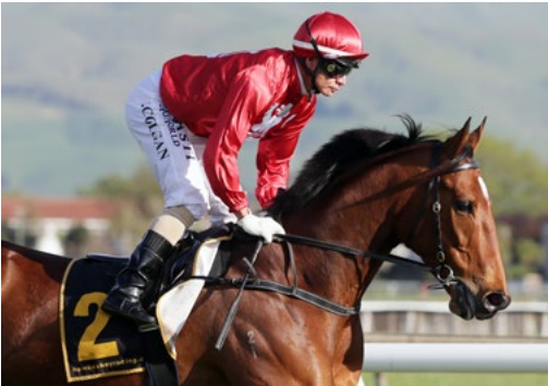
Volkstok'n'barrell (NZ) (Tavistock)