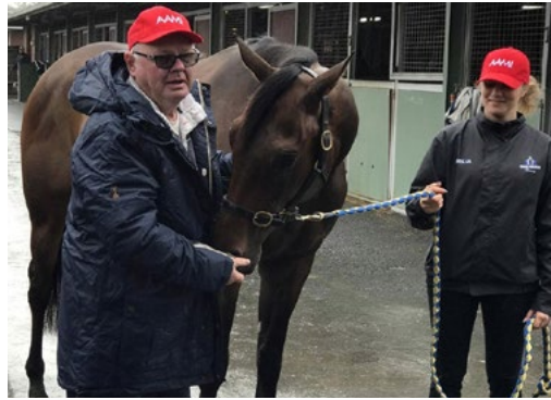
Weather With You (Teofilo)

Weather With You (Teofilo) could deliver on a long-range plan when he bids to give prominent New Zealand trainer