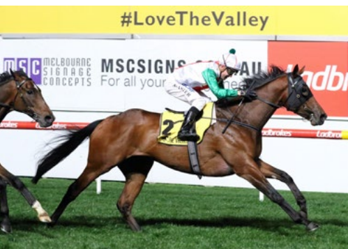
Jon Snow (NZ) (Iffraaj)