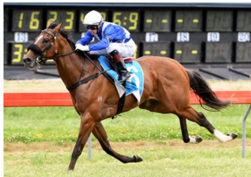
Hezthwonforus (NZ) (Sufficient)