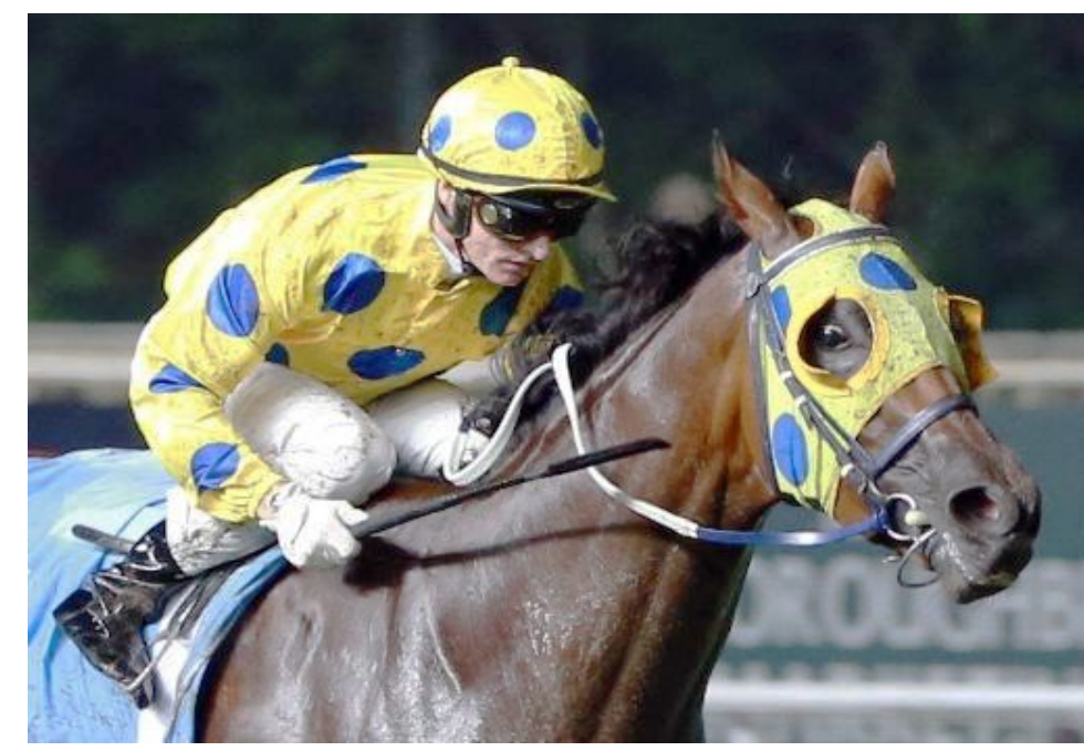
Mr Clint scored a brilliant win in the Singapore Guineas

"We will then bring him back for the longer races later in the year."