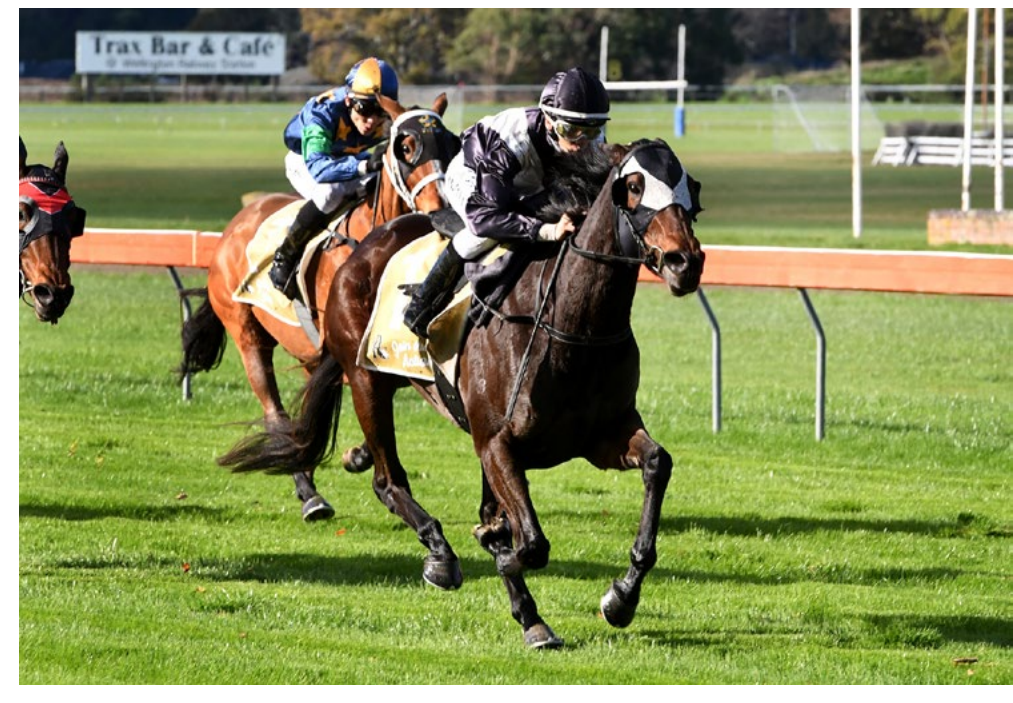
Rosewood has earned a stakes recall with her Trentham victory