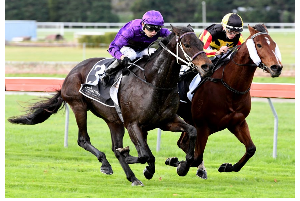
Platinum Command (outer) gets the better of Art Deco