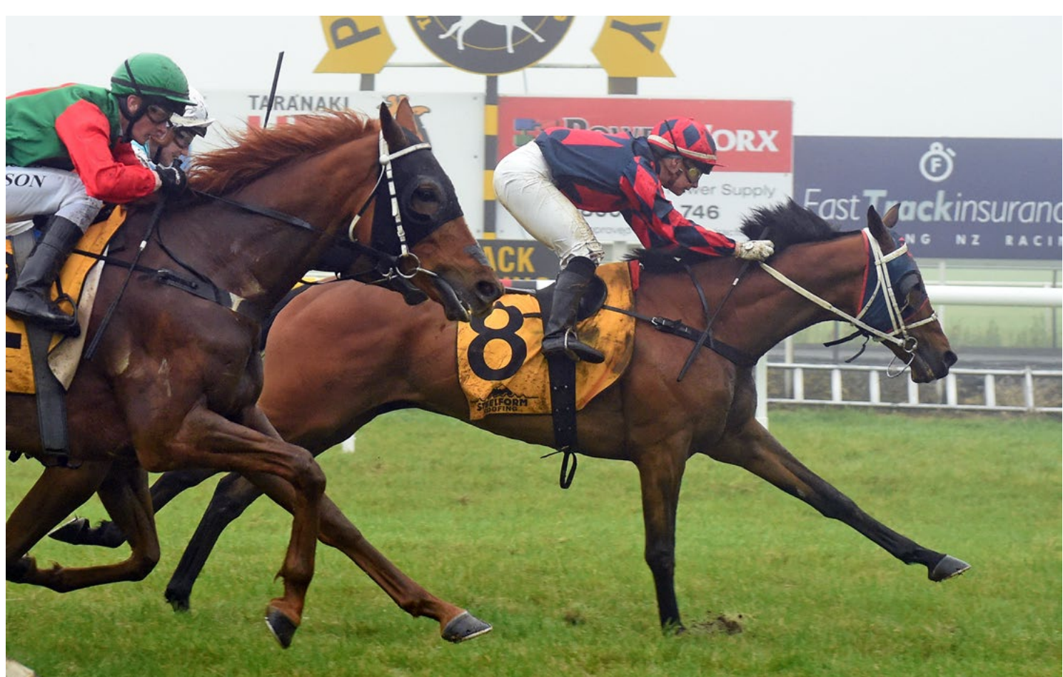
Time Bomb ticking over well for Hawera